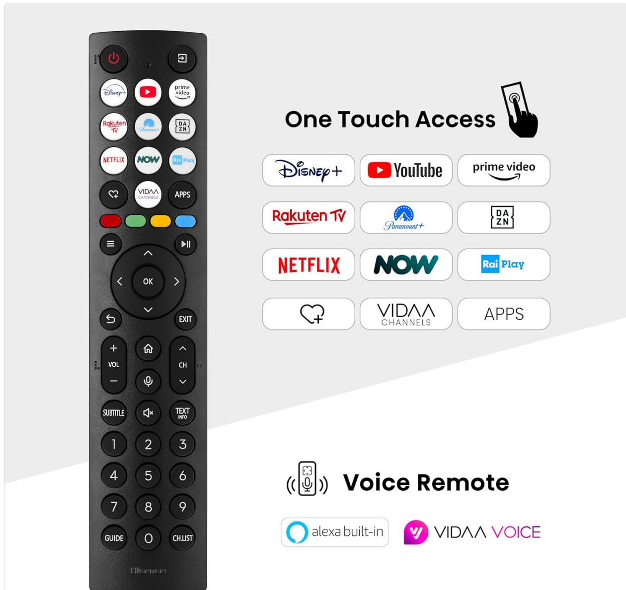
Image: The Hisense remote control is shown, highlighting its layout with power, input, volume, channel, and navigation buttons. It also features one-touch access buttons for services like Disney+, YouTube, Prime Video, Netflix, and a dedicated voice control button with Alexa Built-in and VIDAA Voice logos.

The included remote control provides full functionality for your Hisense TV. It features dedicated buttons for popular streaming services and voice control capabilities.