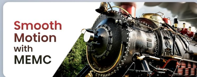
Image: A graphic illustrating key features of the Hisense E6 UHD 4K TV, including Precision Colour, Dolby Vision, VIDAA, 4K AI Upscaler, Smooth Motion with MEMC, and Game Mode Plus with VRR ALLM.