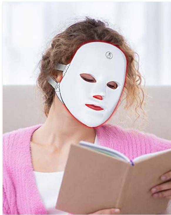
Image 3: The mask's ergonomic design with soft eye pads and adjustable strap for a comfortable fit.