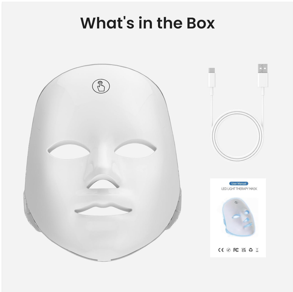
Image 2: Contents of the product box, including the mask, strap, USB-C cable, and user manual.