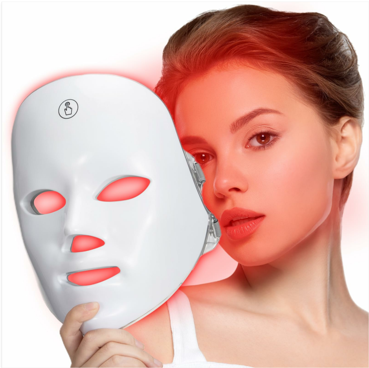
Image 1: SUERBEATY Red Light Mask, showcasing its sleek design and cordless nature.