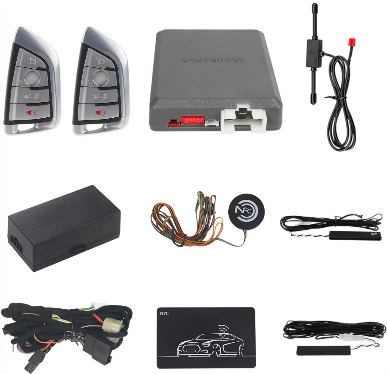
Image: All components included in the EASYGUARD EC211PP-BM2-NFC-D1 system.