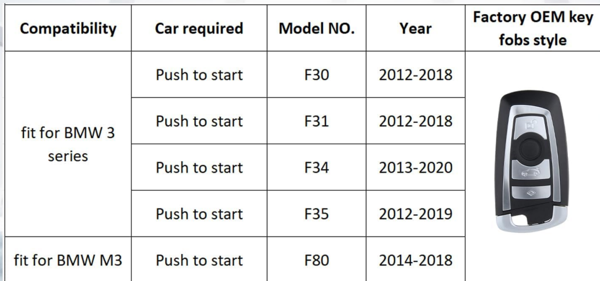
Image: Detailed compatibility chart for the system.