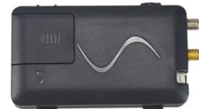
BT001 or 4G LTE module

Image: Detailed view of all included accessories.