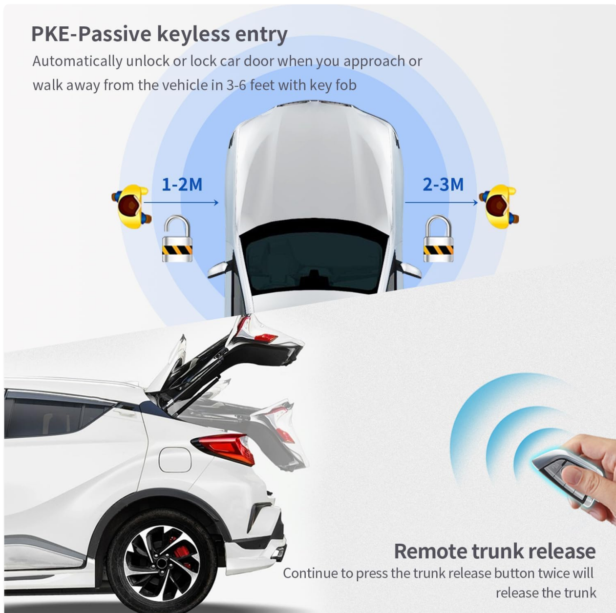
Image: PKE passive keyless entry and remote trunk release functionality.

The PKE feature automatically unlocks or locks your car doors as you approach or walk away from the vehicle with the key fob. The system will unlock when you are within 3-6 feet and lock when you move 3-6 feet away.