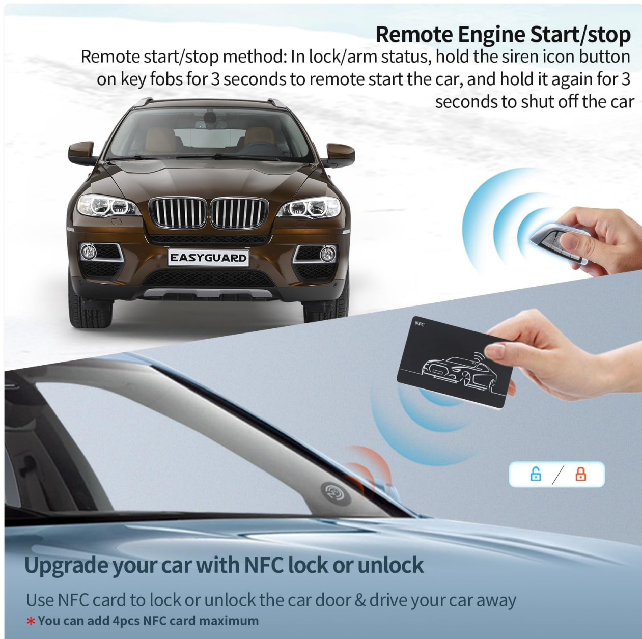
Image: NFC card lock/unlock and remote engine start/stop.

Use the provided NFC card to lock or unlock the car door. This feature provides an alternative entry method without the key fob.