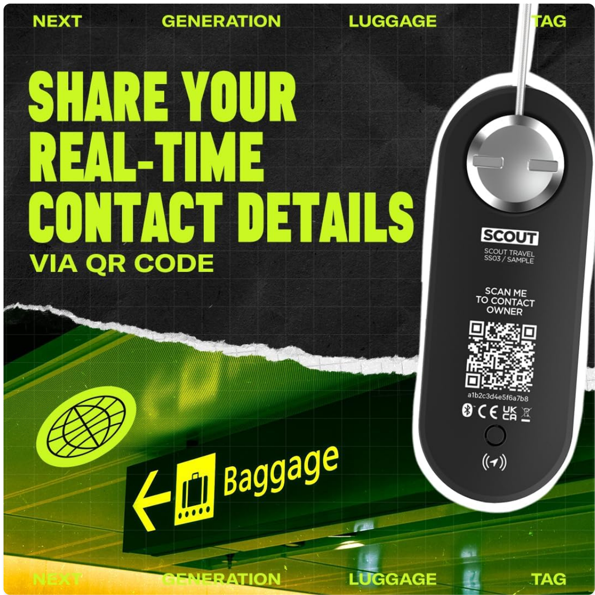
Image: The QR code on the Knog Scout iOS Smart Tag for digital contact sharing.