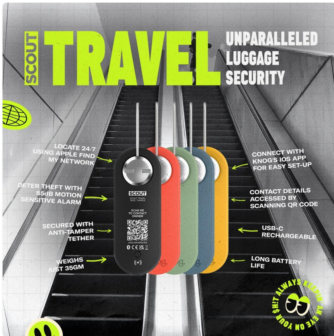
Image: The Knog Scout iOS Smart Tag, highlighting its features and design.