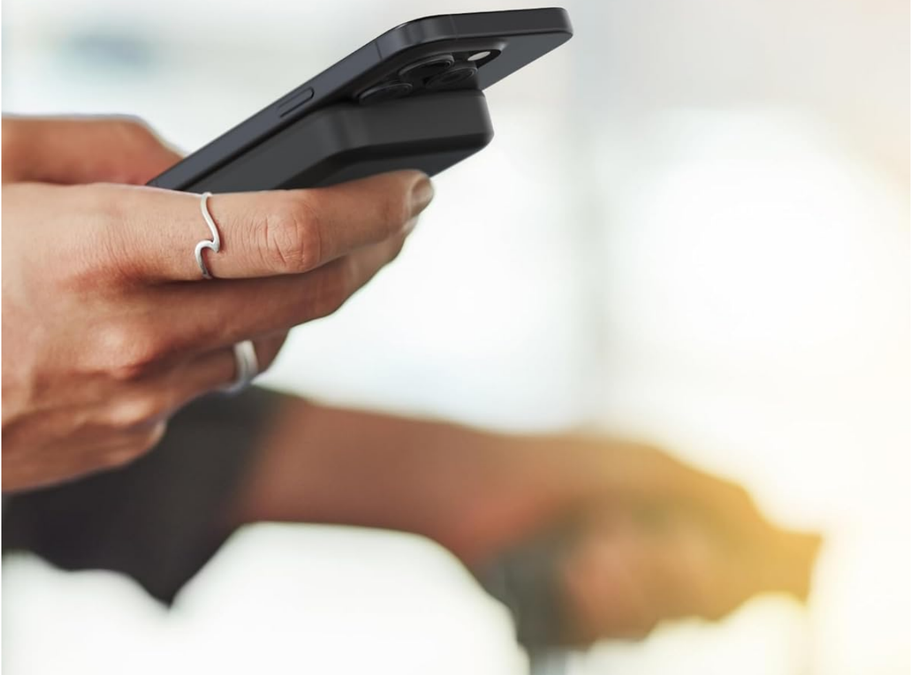
Image: The power bank shown with an overlay indicating it adds 28 hours of battery life to a device.

Compliant with TSA airline safety standards for peace of mind while flying, our wireless power bank can be with you in your carry-on.