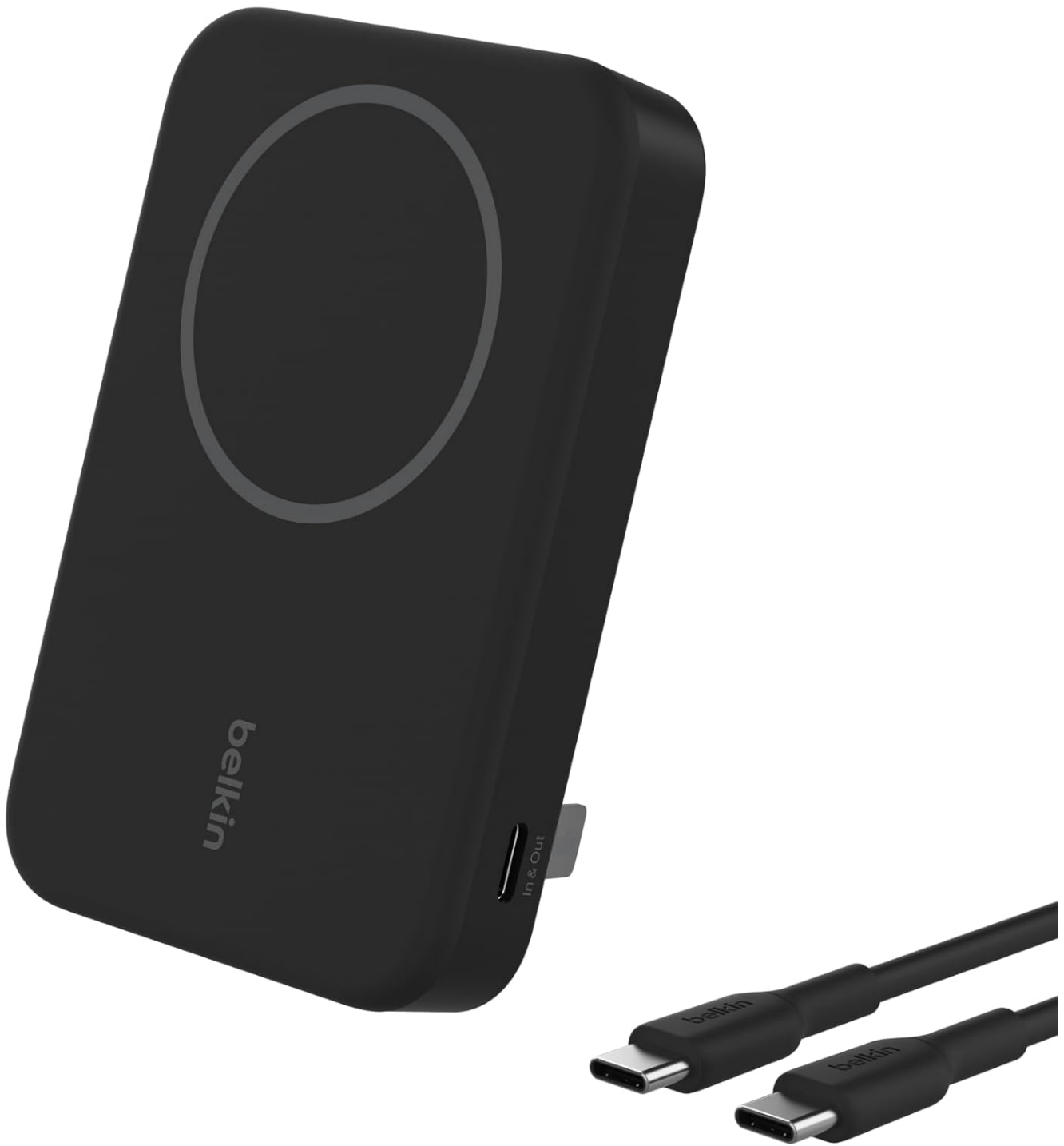
Image: The Belkin BoostCharge Pro Wireless Power Bank in black, shown with the included USB-C to USB-C cable.