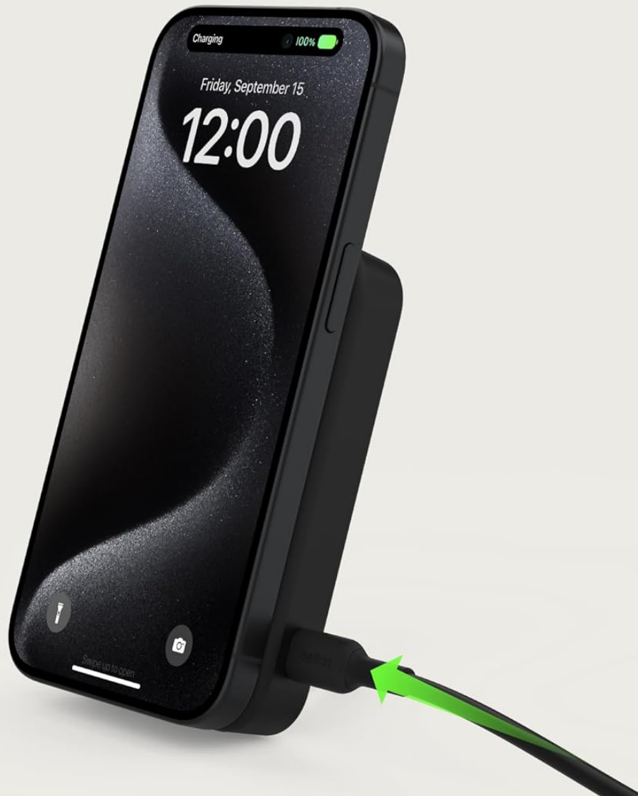
Image: An iPhone standing upright, supported by the integrated kickstand of the attached power bank, displaying the time.

Just plug into a wall outlet and the dual-purpose design will charge your device while recharging the power bank.