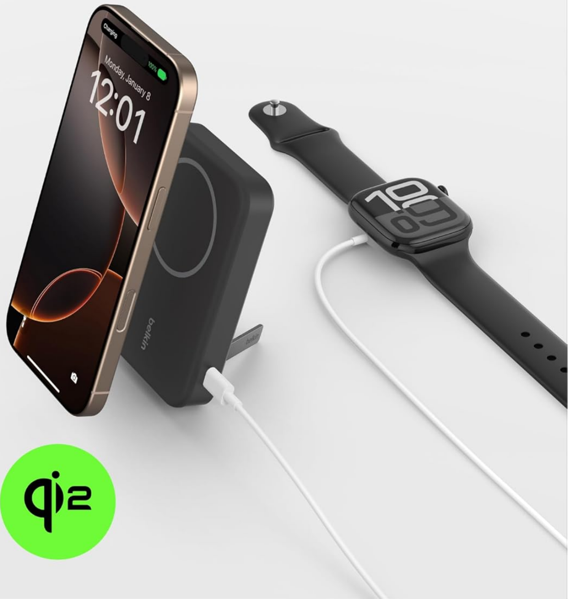
Image: An iPhone wirelessly charging on the power bank while an Apple Watch is simultaneously charged via the power bank's USB-C port.