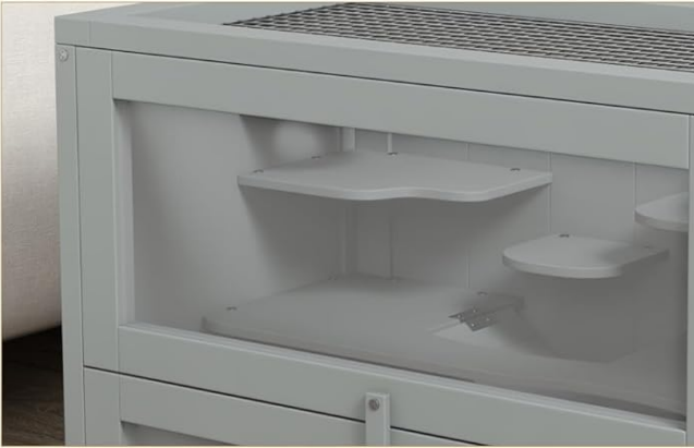
Organic Glass for Observation