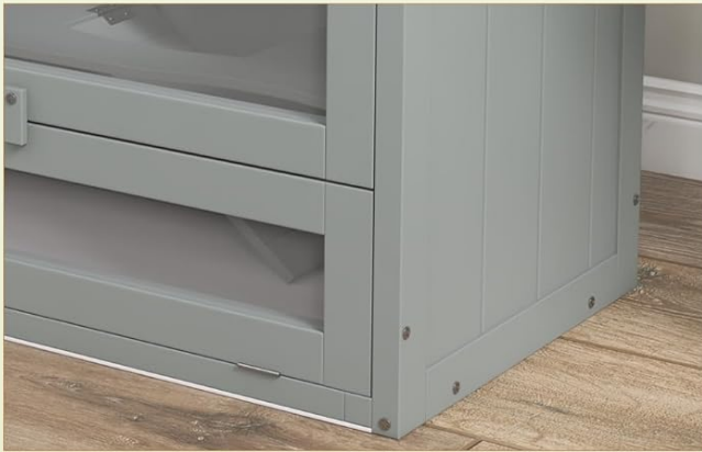
Fir Wood Enhances Stability