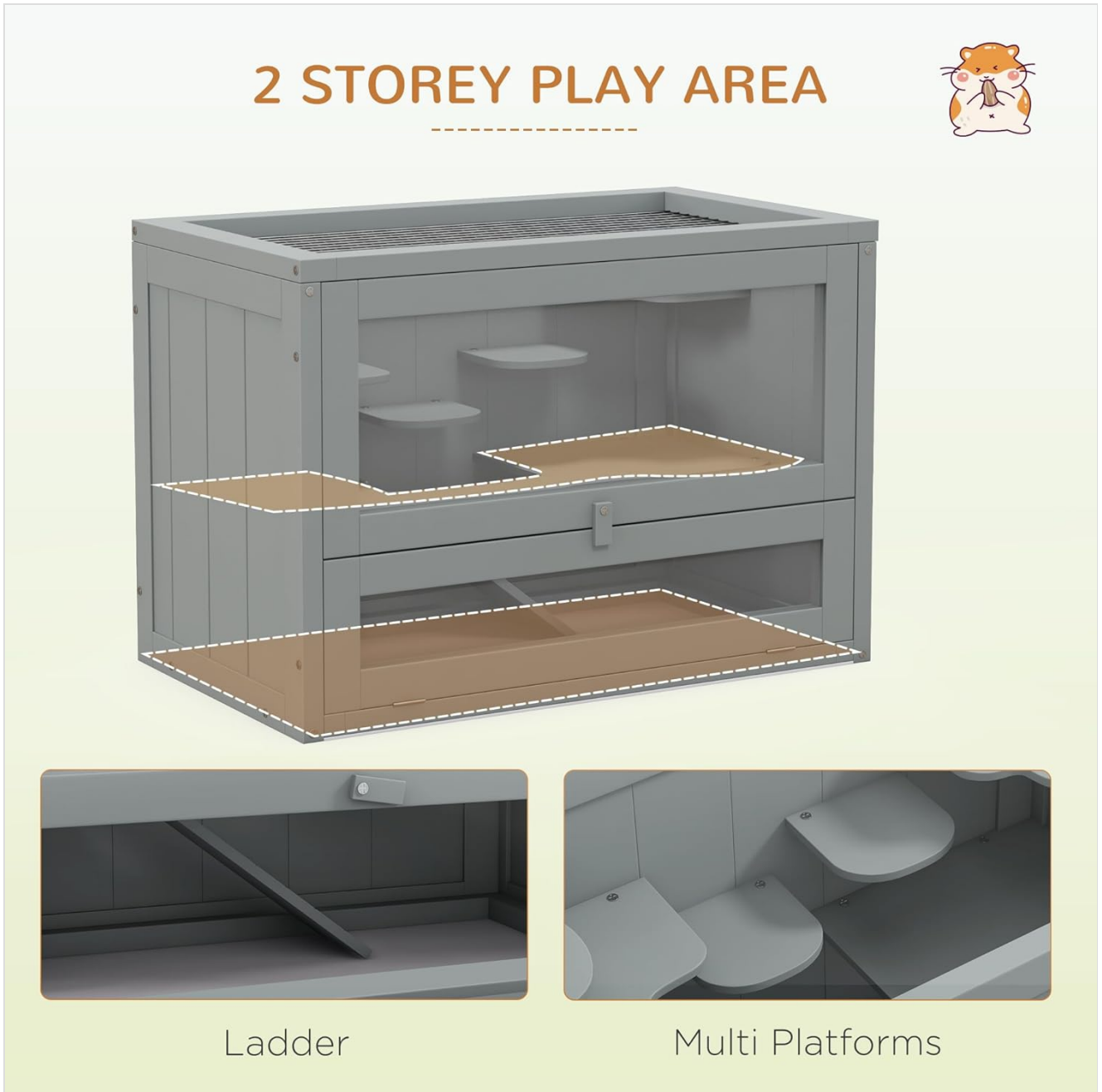
Image: Diagram illustrating the two-storey play area with a ladder and multiple platforms for small animals.