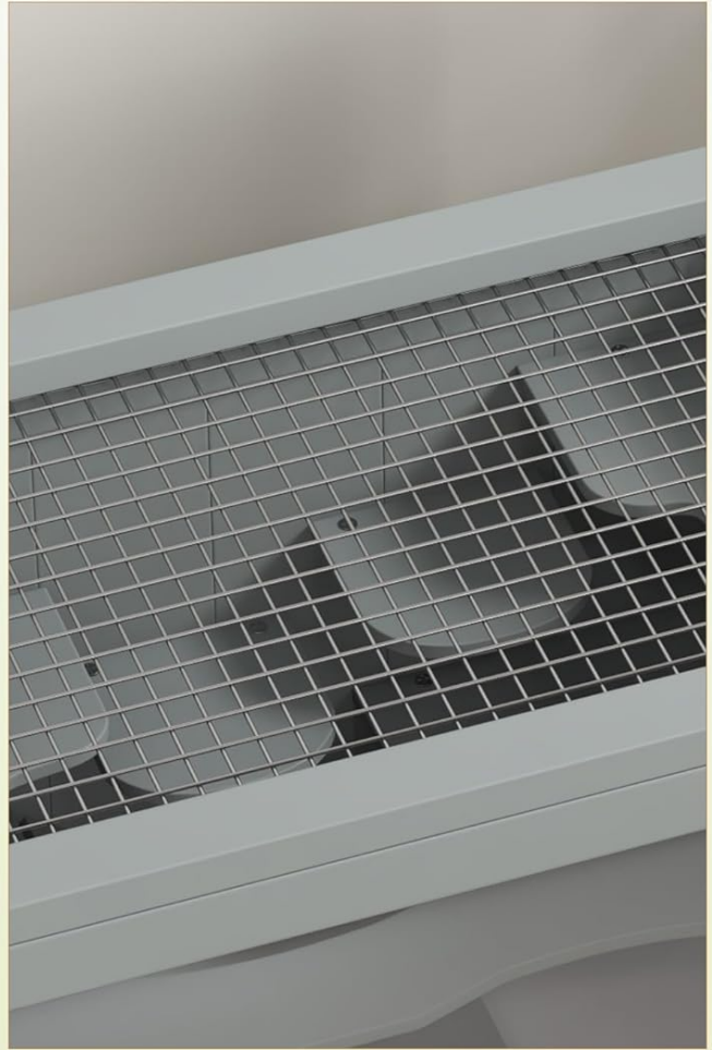
Mesh Wire for Air Circulation

Image: Details of the habitat's construction, including organic glass, fir wood, and mesh wire.