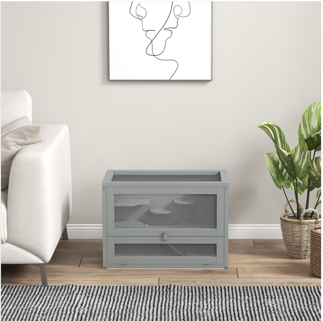
Image: The front door of the habitat, partially open, providing access to the lower level.