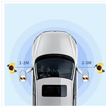
Figure 3.2: The system is compatible with vehicles featuring a factory original push start button.