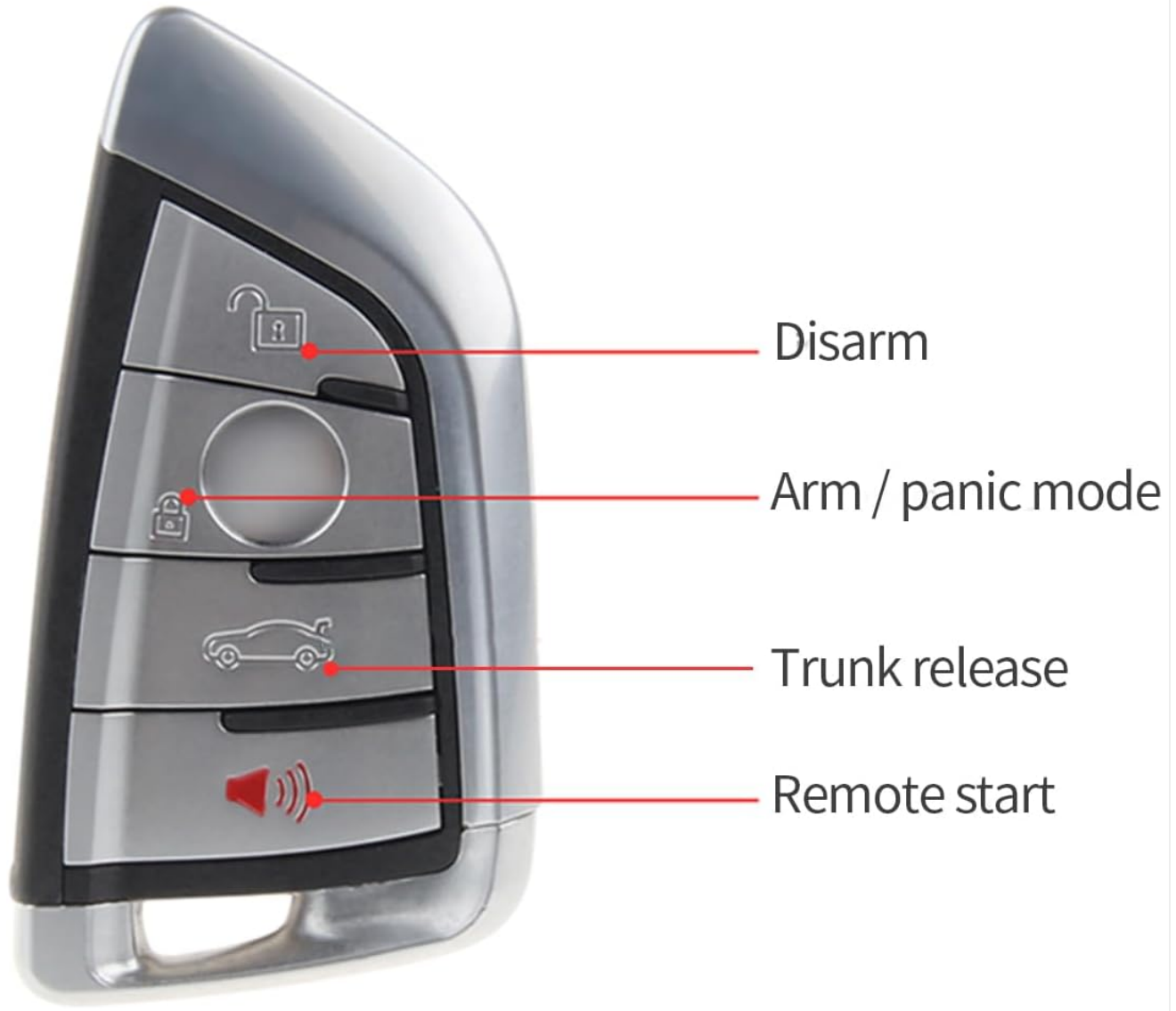
Figure 6.1: Key Fob Button Functions.