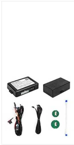
Figure 5.1: Bypass module and wiring for professional installation.