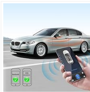
Figure 4.3: Optional smartphone app control and GPS tracking.