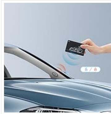
Figure 4.2: Remote Engine Start/Stop and NFC card access.