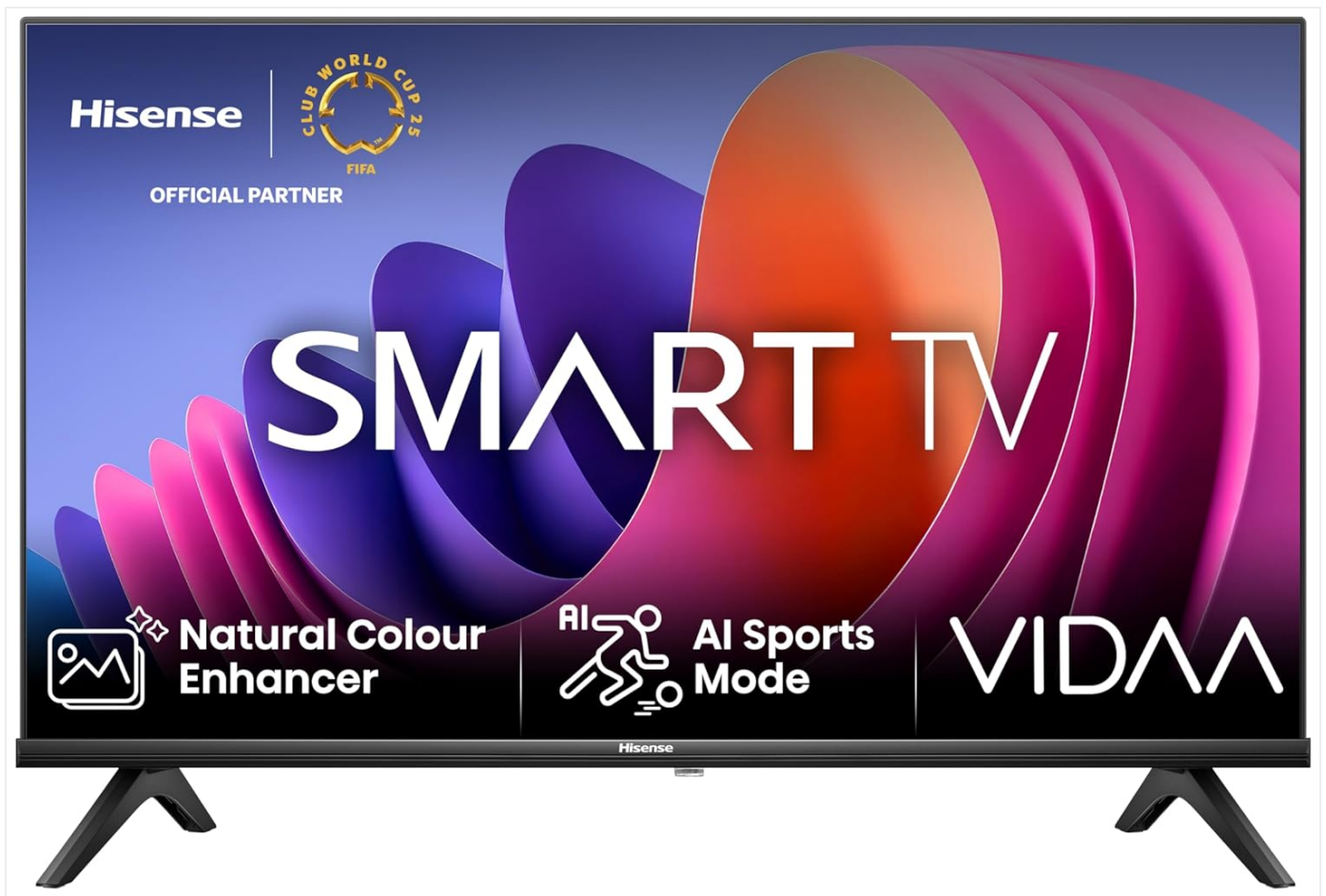
Figure 1.1: Hisense 40A4N Full HD Smart TV. This image shows the front view of the Hisense 40A4N television, highlighting its slim bezels and the Hisense logo at the bottom center.