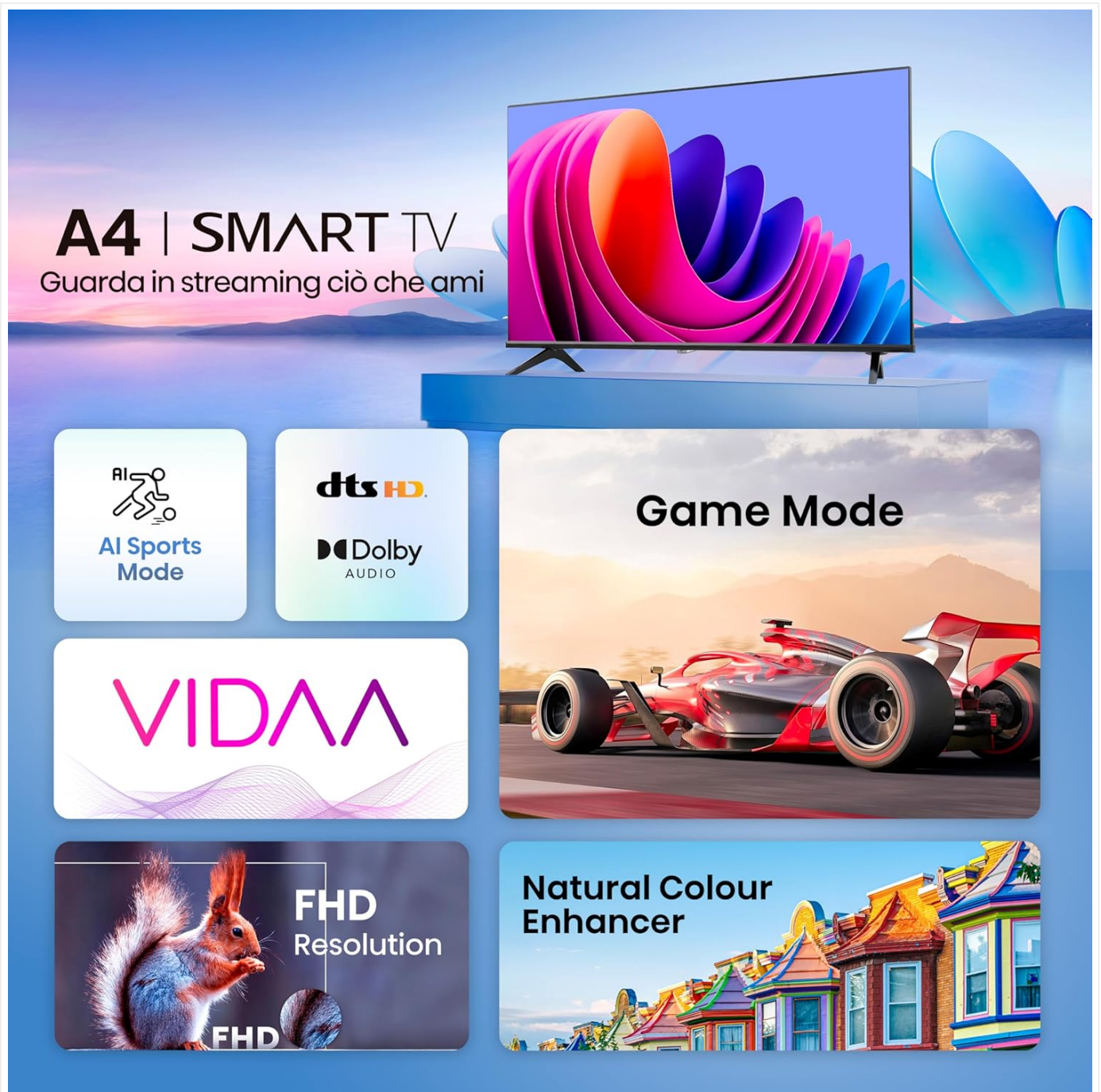
Figure 5.3: Key Features. This image highlights several key features of the Hisense A4 Smart TV, including AI Sports Mode, DTS HD, Dolby Audio, Game Mode, VIDAA, FHD Resolution, and Natural Colour Enhancer.