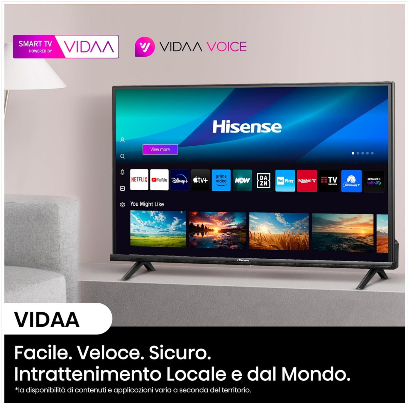
Figure 5.2: VIDAA Smart TV Interface. This image displays the user interface of the VIDAA Smart TV, showing various streaming applications and content recommendations, emphasizing its ease of use and quick access to entertainment.

Your Hisense TV runs on the VIDAA U7 Smart TV operating system, providing a fast, intuitive, and secure entertainment experience. Access a wide range of apps, streaming services, and local content.