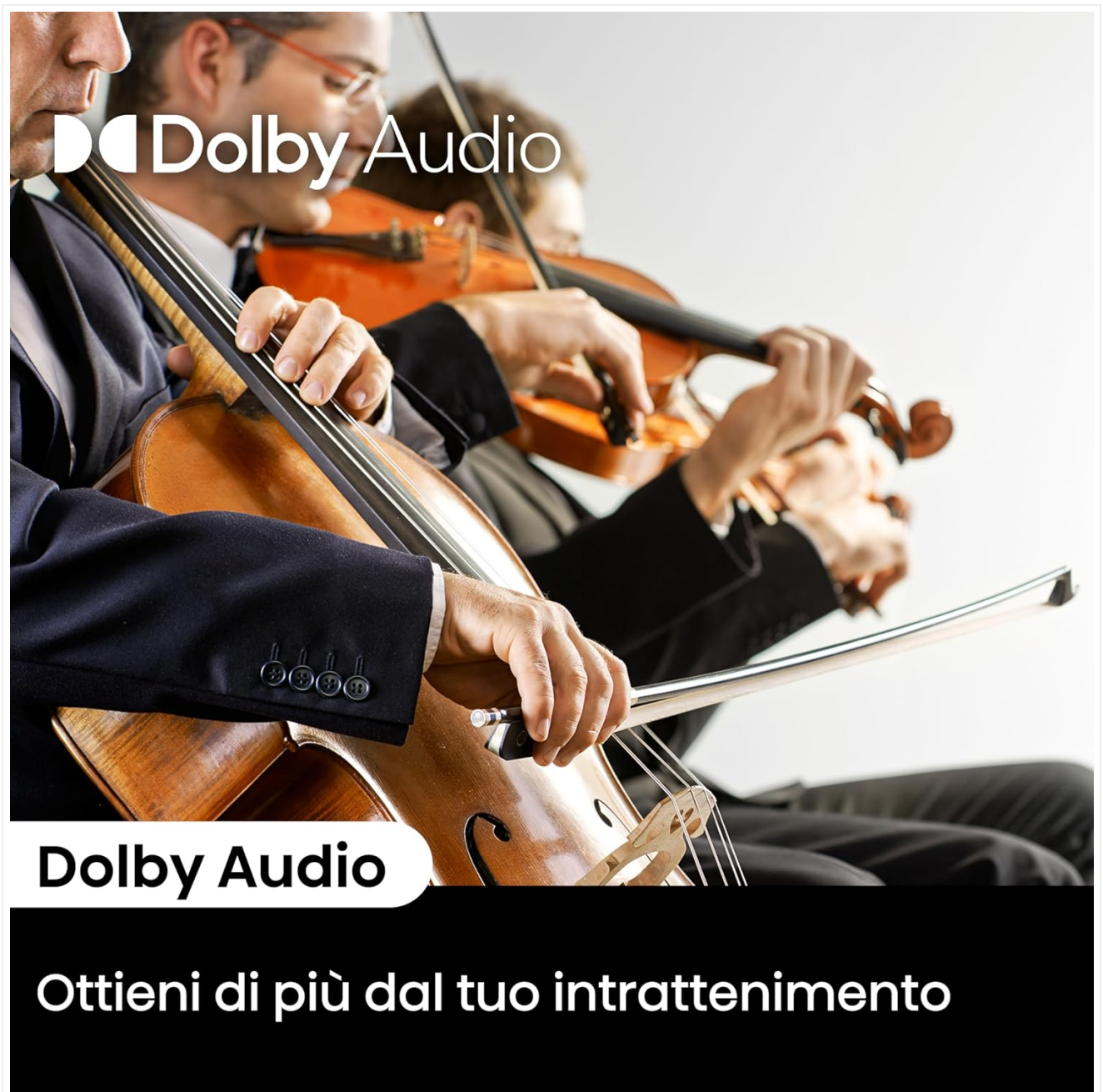
Figure 5.3.2: Dolby Audio. This image depicts musicians, symbolizing the enhanced audio experience provided by Dolby Audio technology, promising richer and more immersive sound.