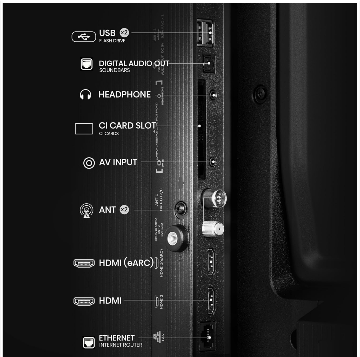
Figure 4.1: Rear Panel Connections. This image displays the various input and output ports on the back of the Hisense 40A4N TV, including USB (x2), Digital Audio Out, Headphone, CI Card Slot, AV Input, ANT (x2), HDMI (eARC), HDMI (x2), and Ethernet.