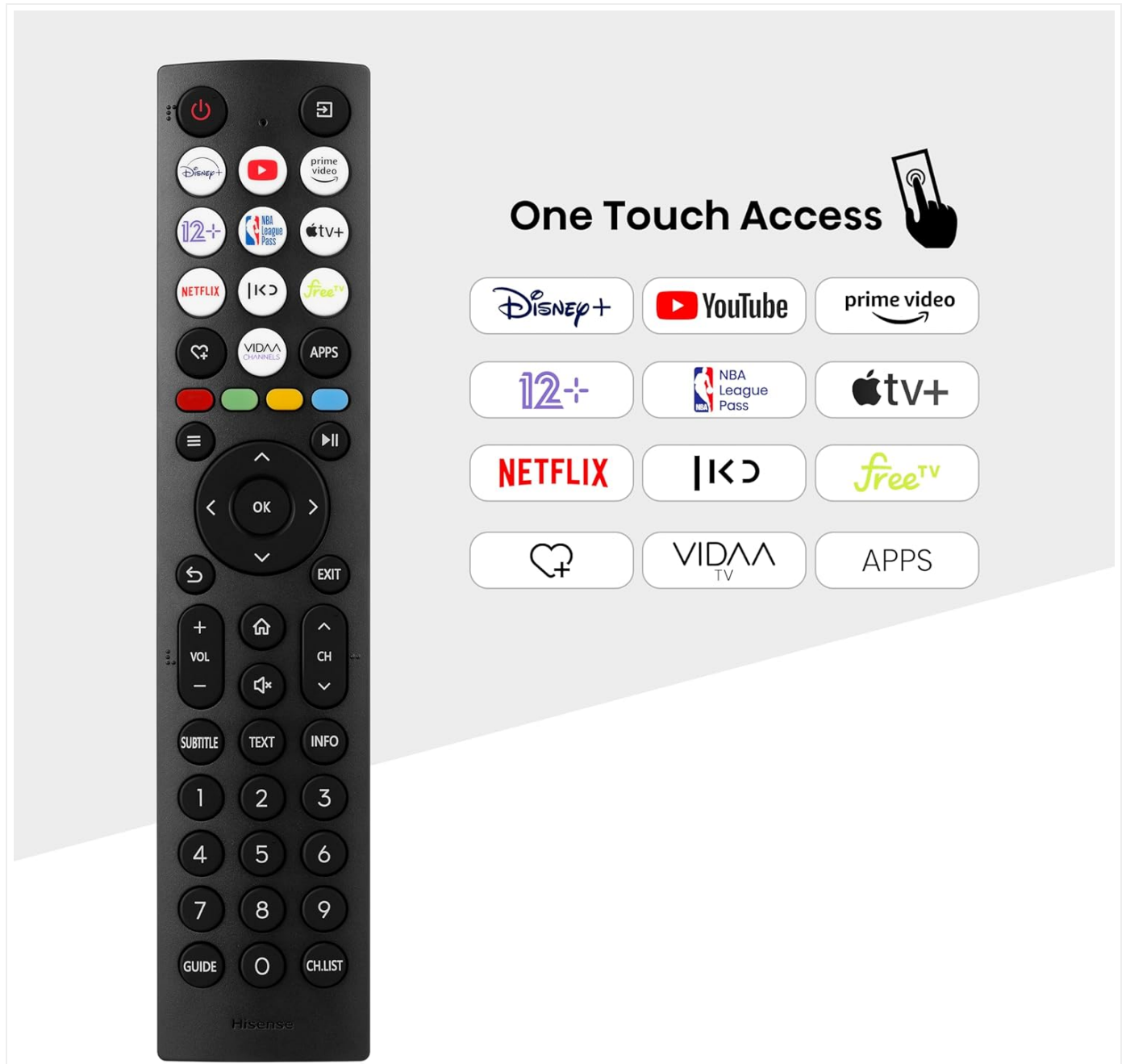
Figure 5.1: Remote Control Layout. This image shows the Hisense TV remote control, highlighting dedicated buttons for popular streaming services like Disney+, YouTube, Prime Video, Netflix, and others, along with standard navigation and control buttons.

The remote control allows you to navigate the TV's features and settings. Familiarize yourself with the buttons and their functions.