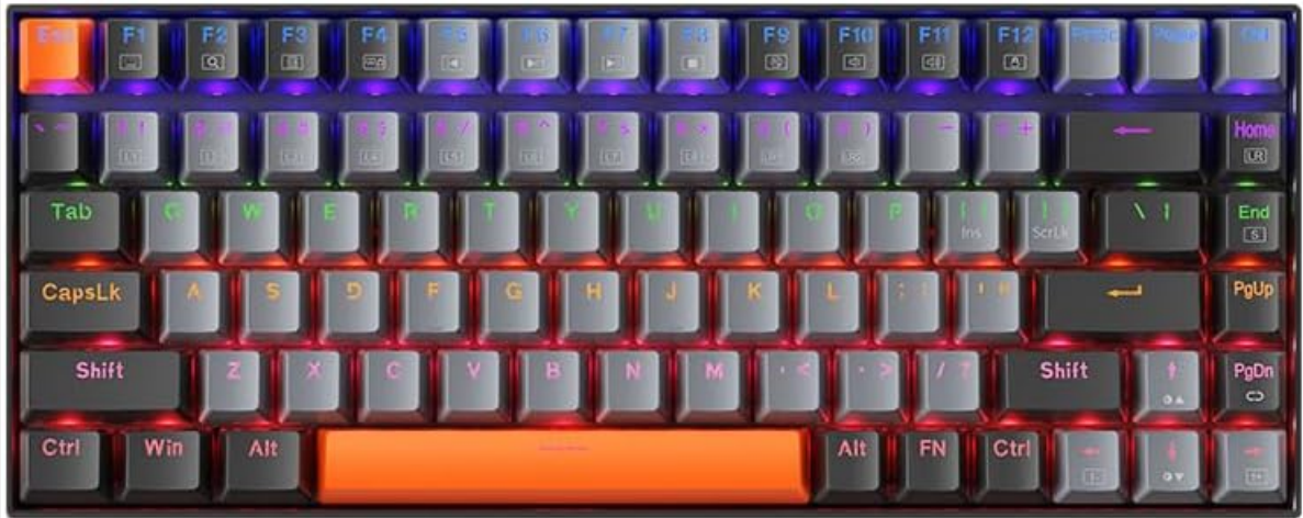
Figure 1: Top view of the Machenike K500A 75% Mechanical Keyboard, showcasing its compact 84-key layout and rainbow LED backlighting.

The Machenike K500A is a compact 75% mechanical keyboard designed for gaming and general use. It features 84 keys, hot-swappable linear red switches, and customizable RGB LED backlighting.