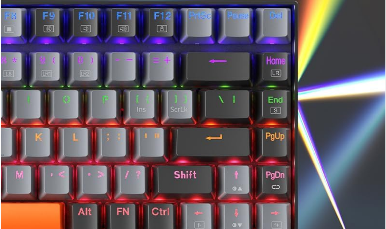
Figure 4: Close-up view of the keyboard keys illuminated by the rainbow LED backlight, demonstrating the visual effects.

Featuring 9 preset marquee lighting effects.