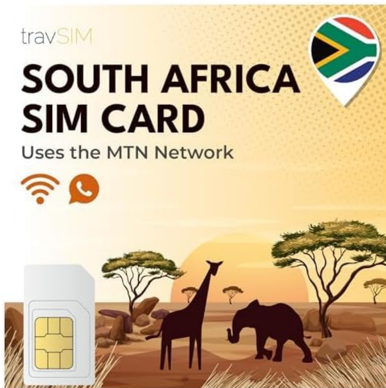
An image showing a multi-cut SIM card, illustrating standard, micro, and nano SIM sizes.