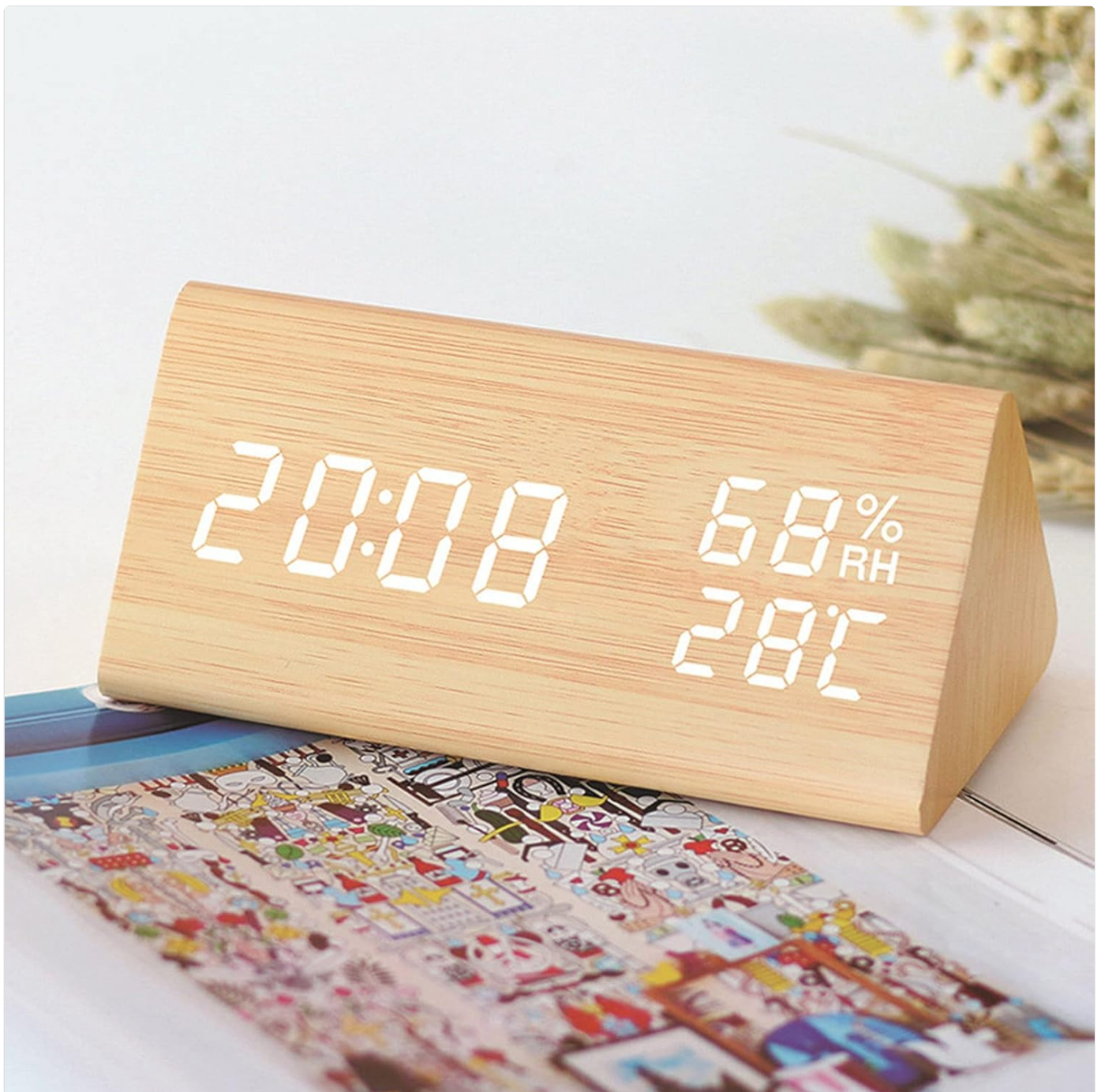
Figure 1: Front view of the Ubervia YJ-5038 alarm clock, showing the digital display with time (20:08), humidity (68% RH), and temperature (28°C).