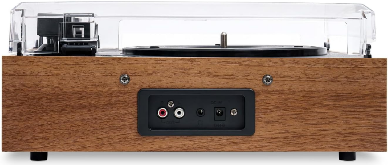
Rear panel with RCA and headphone outputs.