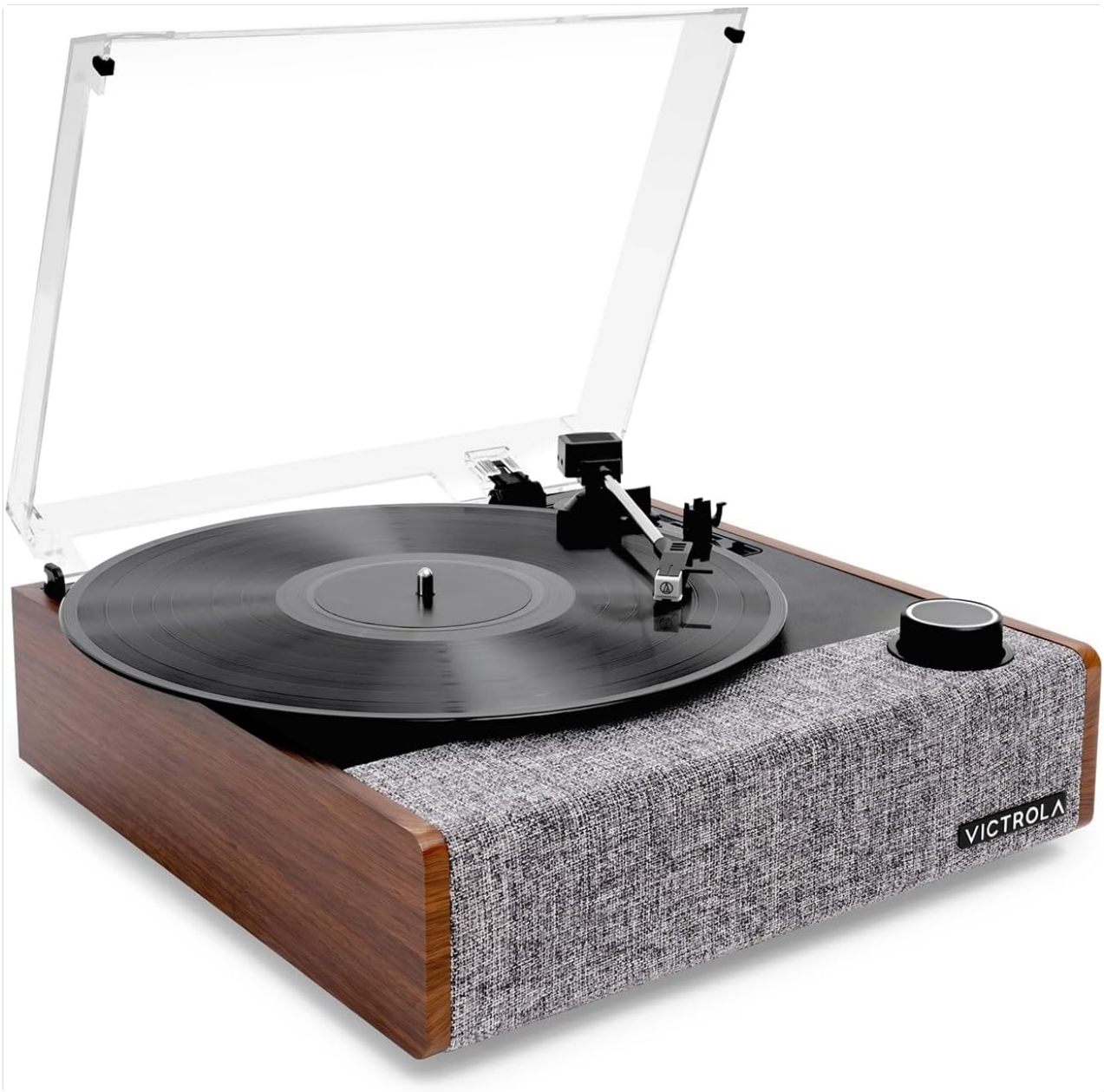
The Victrola Eastwood II Record Player, featuring its classic design and integrated components.