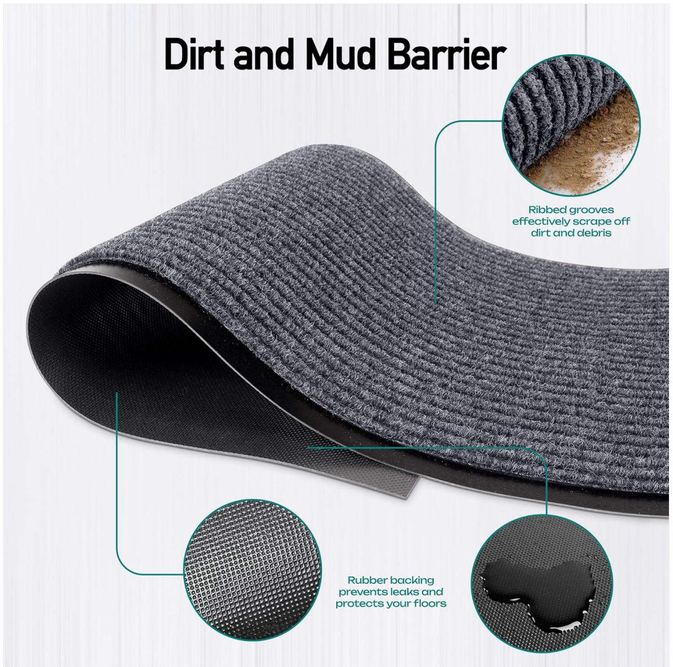
Figure 2.3: Detailed view of the mat's ribbed grooves designed to scrape off dirt and debris, and the rubber backing that prevents leaks and protects floors.