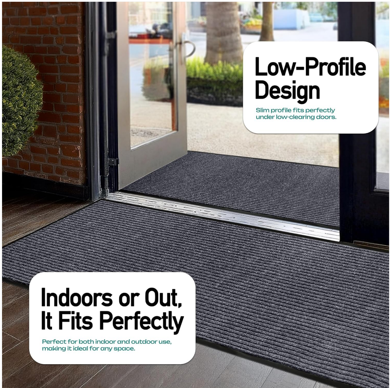
Figure 2.4: The mat's low-profile design allowing it to fit seamlessly under most doors, preventing obstruction.