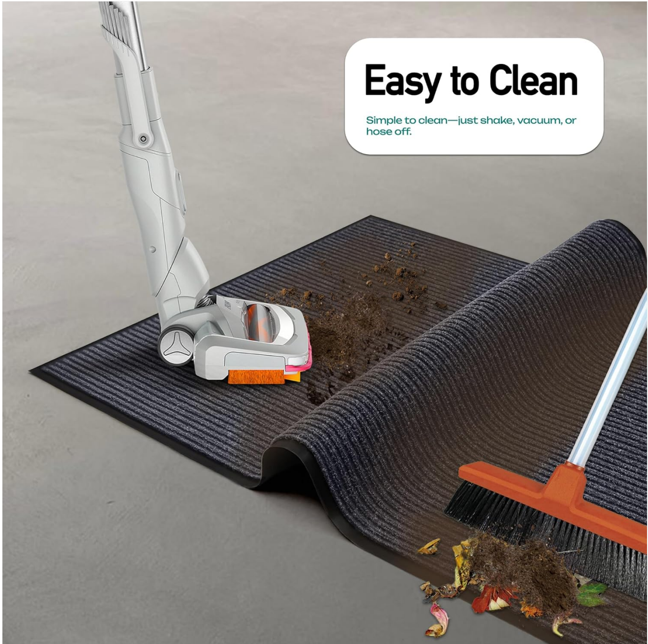
Figure 5.1: Illustration of cleaning methods for the MaxMat, showing both vacuuming and sweeping to remove accumulated dirt.

Note: Avoid using harsh chemicals or bleach, as these can damage the mat's material and affect its performance.