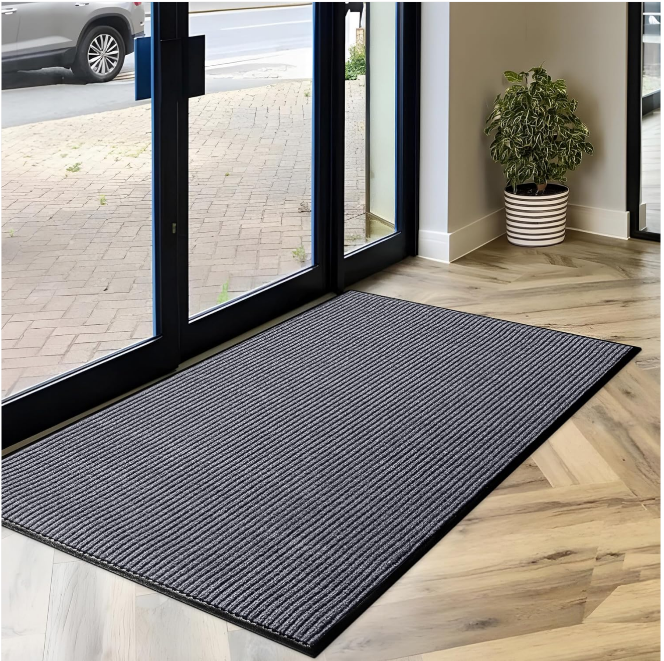
Figure 2.2: The MaxMat Commercial Floor Mat installed in a commercial building entryway, demonstrating its large coverage and low-profile design.