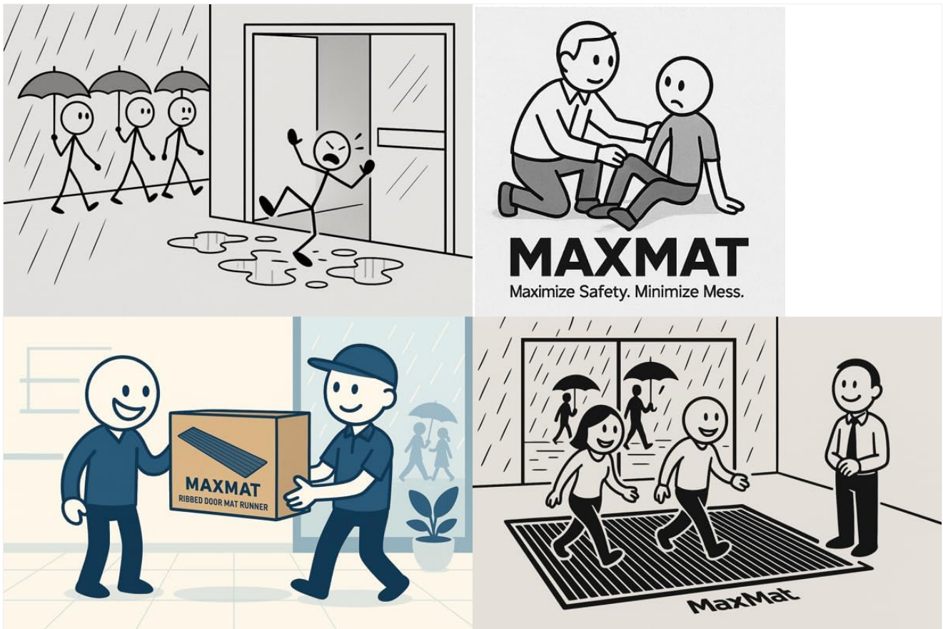
Figure 8.1: Illustrations highlighting the safety benefits of the MaxMat, including preventing slips and trapping mud to keep floors clean.