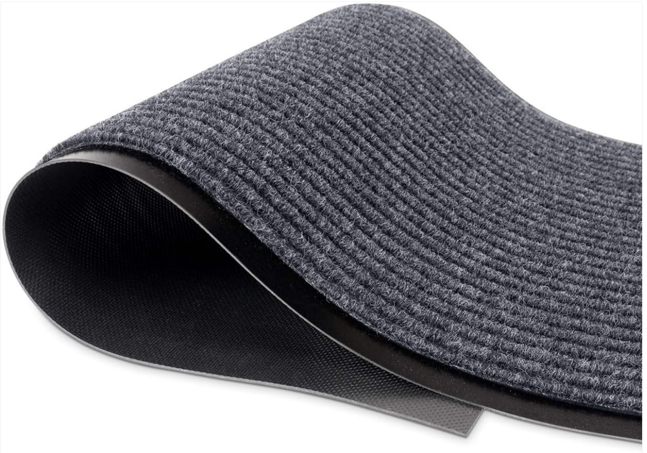
Figure 2.1: The MaxMat Commercial Floor Mat, showcasing its ribbed surface and durable rubber backing when partially rolled.