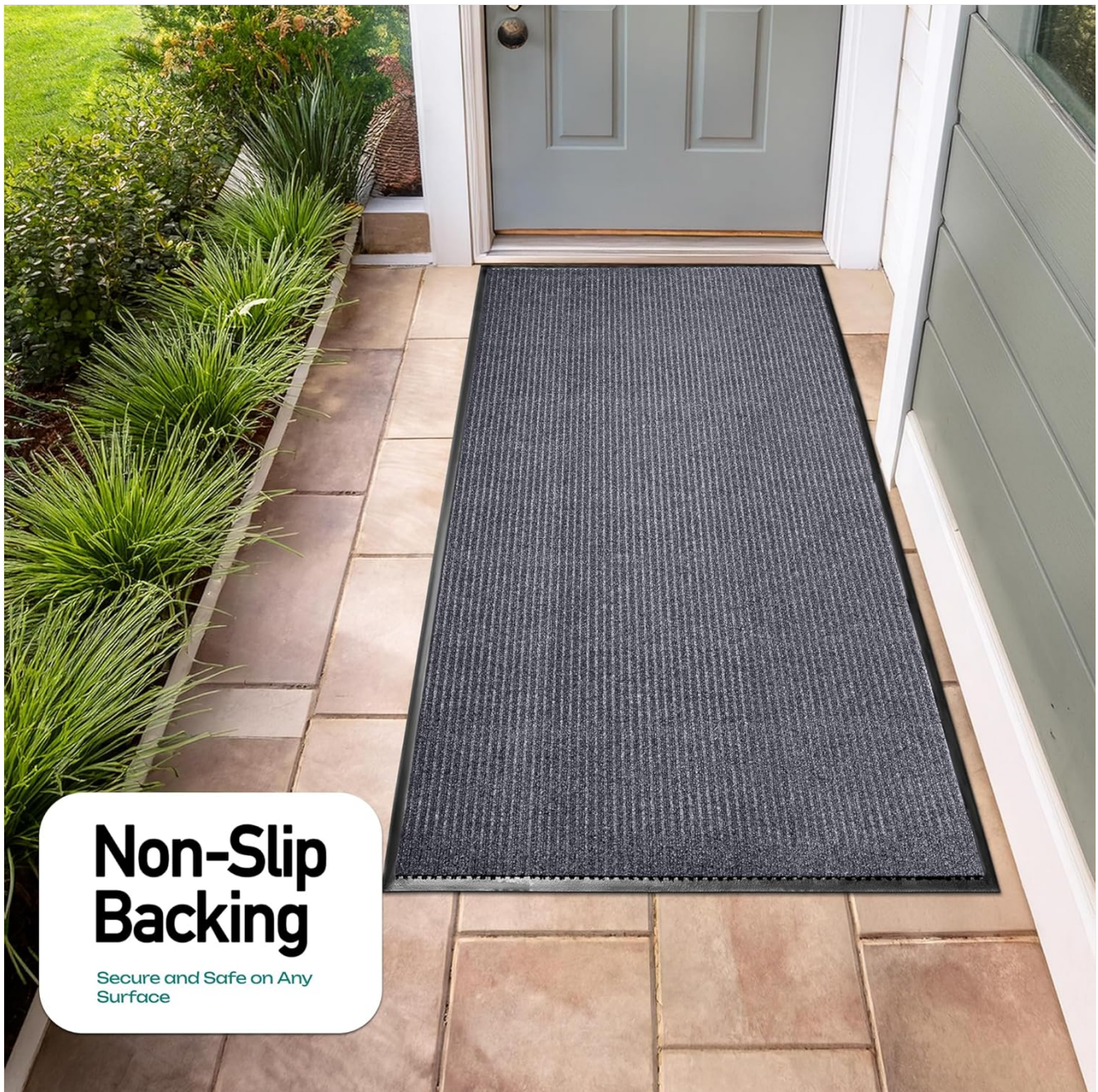
Figure 3.1: The MaxMat Commercial Floor Mat securely placed on an outdoor patio, demonstrating its non-slip backing and readiness for use.