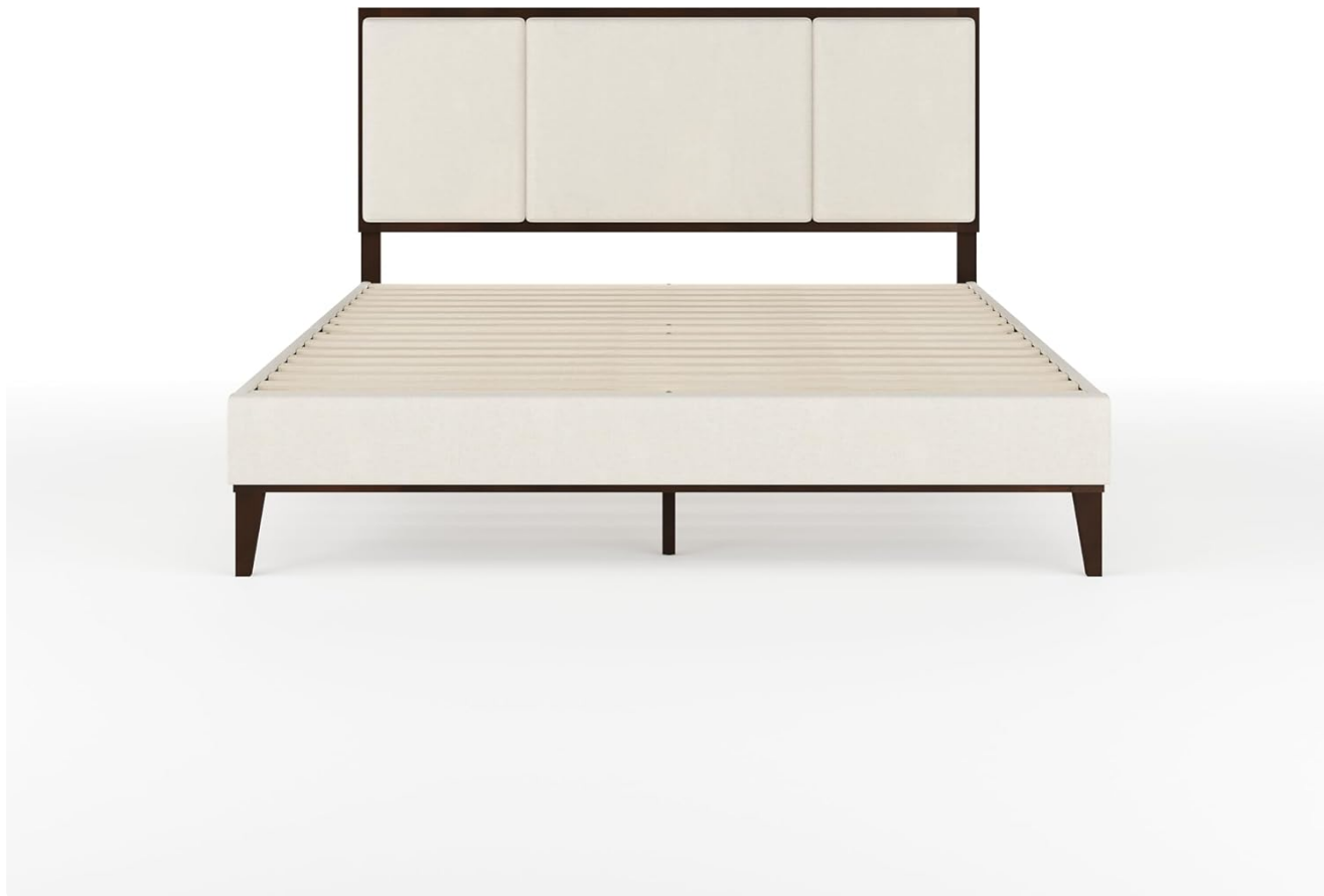
Image: Front view of the bed frame with slats.