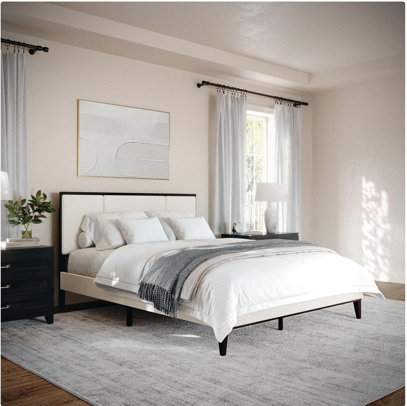
Image: Martha Stewart Jett Platform Bed in a bedroom setting.