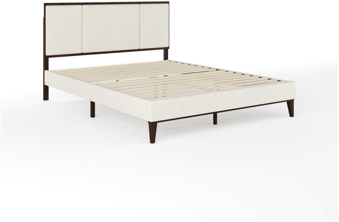
Image: Side view of the bed frame with slats.

Important Note: Some users have reported that bolt labeling in the assembly instructions may require careful cross-referencing with the physical parts. Always verify the correct bolt size and type for each step using the provided diagrams. If any instructions seem unclear, refer to the visual diagrams or contact customer support for clarification.