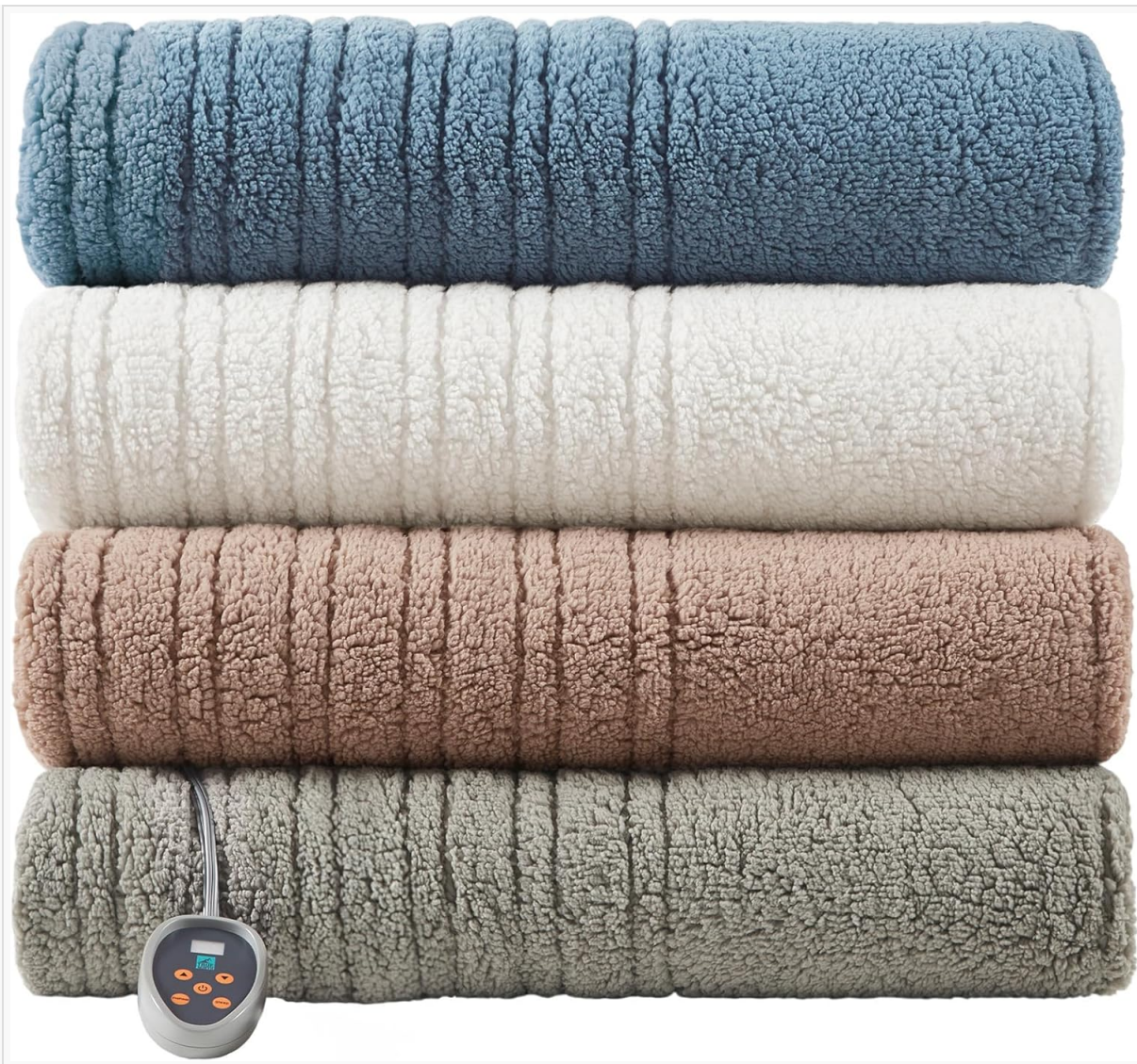
Image: Visual representation of a Full-sized heated blanket with its dimensions (80"W x 84"L), power cord length (6 ft), and controller cord length (12.5 ft).