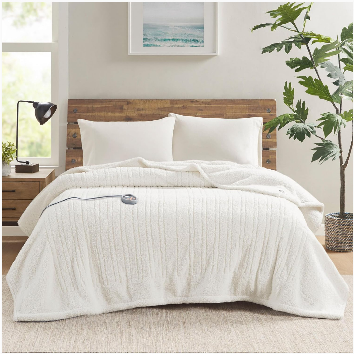
Image: The True North by Sleep Philosophy Heated Electric Blanket in Ivory color, draped over a full-sized bed, showcasing its sherpa texture and integrated controller.