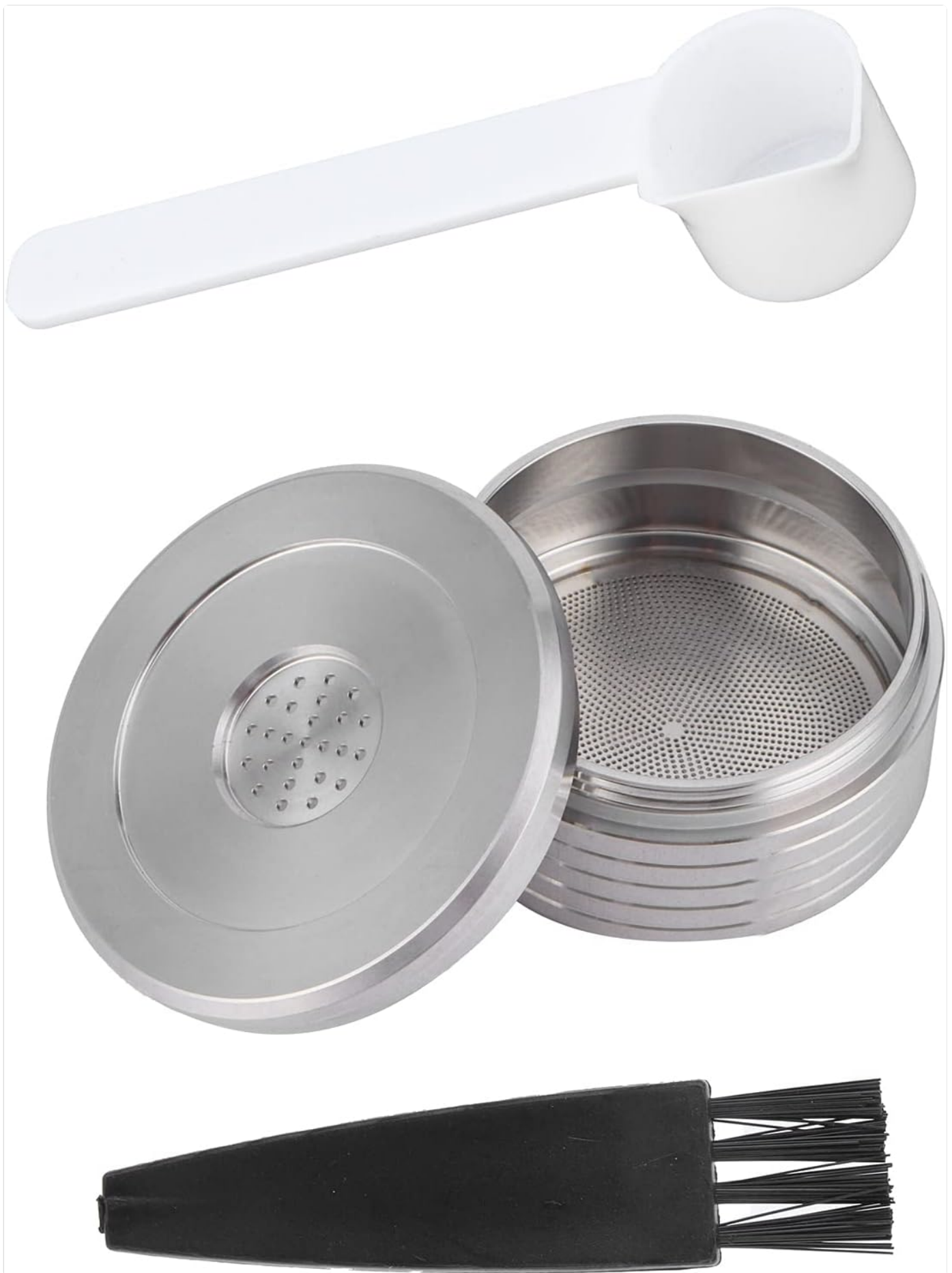
Image: The complete set including the reusable stainless steel coffee capsule, a white measuring spoon, and a black cleaning brush.