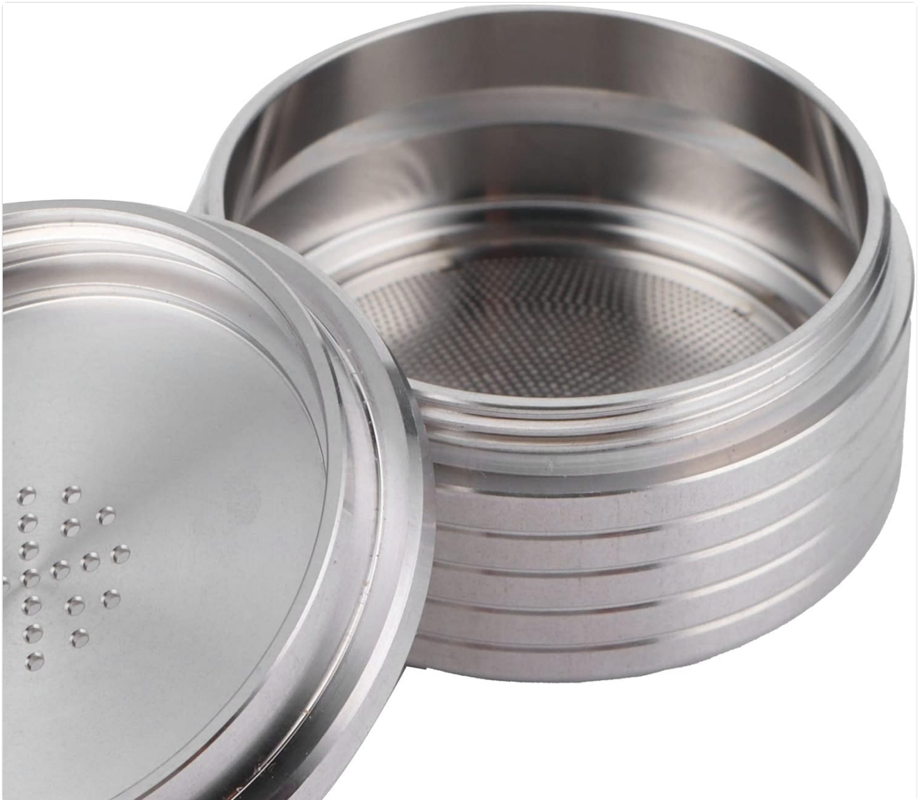
Image: A close-up view of the open stainless steel coffee capsule, highlighting the fine mesh filter at the bottom, which requires thorough cleaning.