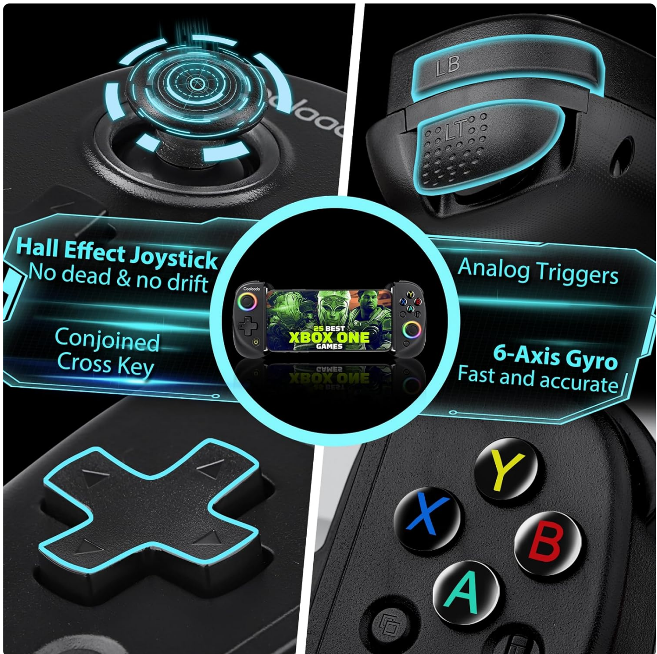
Image 4.3: Detailed view of Hall Effect Joysticks, Analog Triggers, Conjoined Cross Key, and 6-Axis Gyro.