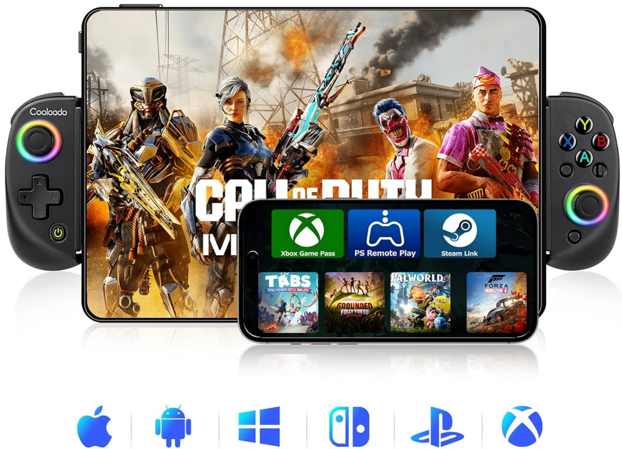
Image 1.1: The Coolaado Wireless Mobile Gaming Controller, compatible with multiple platforms.