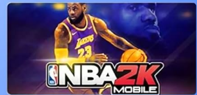
NBA 2K Mobile