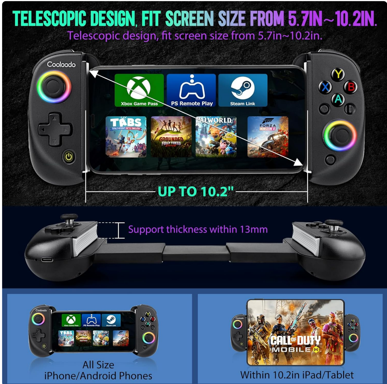
Image 3.1: Telescopic design and device compatibility measurements.