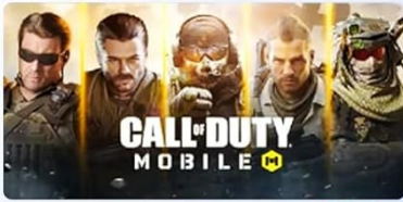
Call of Duty Mobile