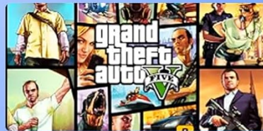
Grand Theft Auto GTA5