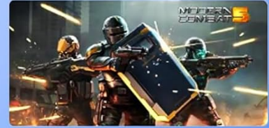
Modern Combat 5