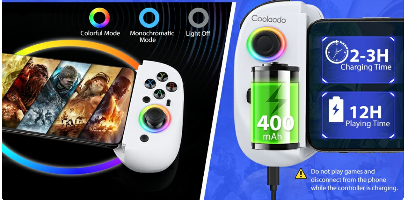
Image 4.1: Button Diagram of the Wireless Mobile Gaming Controller.

Press and hold on the "T" + press "L3" button to adjust the light mode.