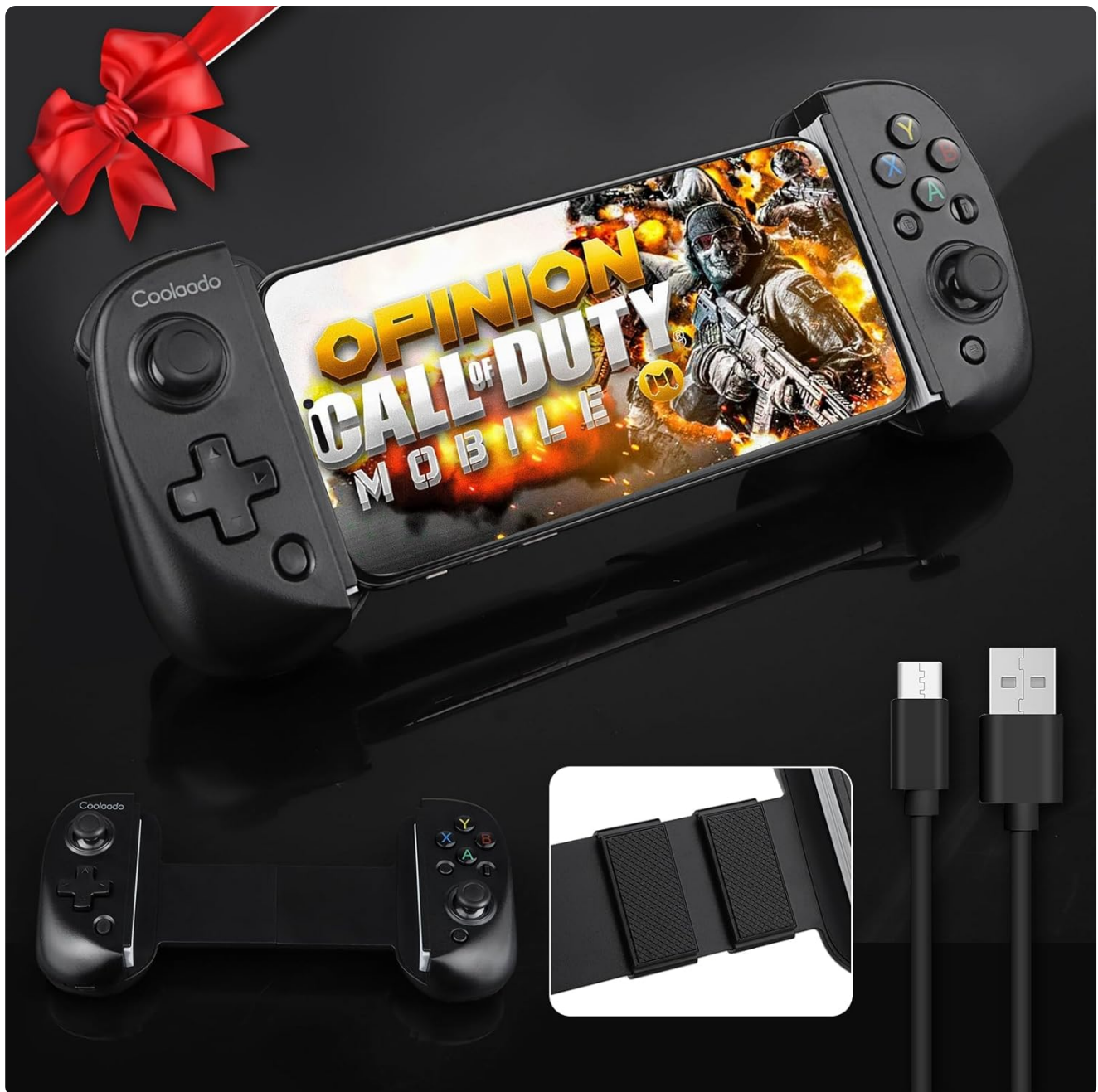
Image 2.1: Package contents including the controller, charging cable, and user manual.