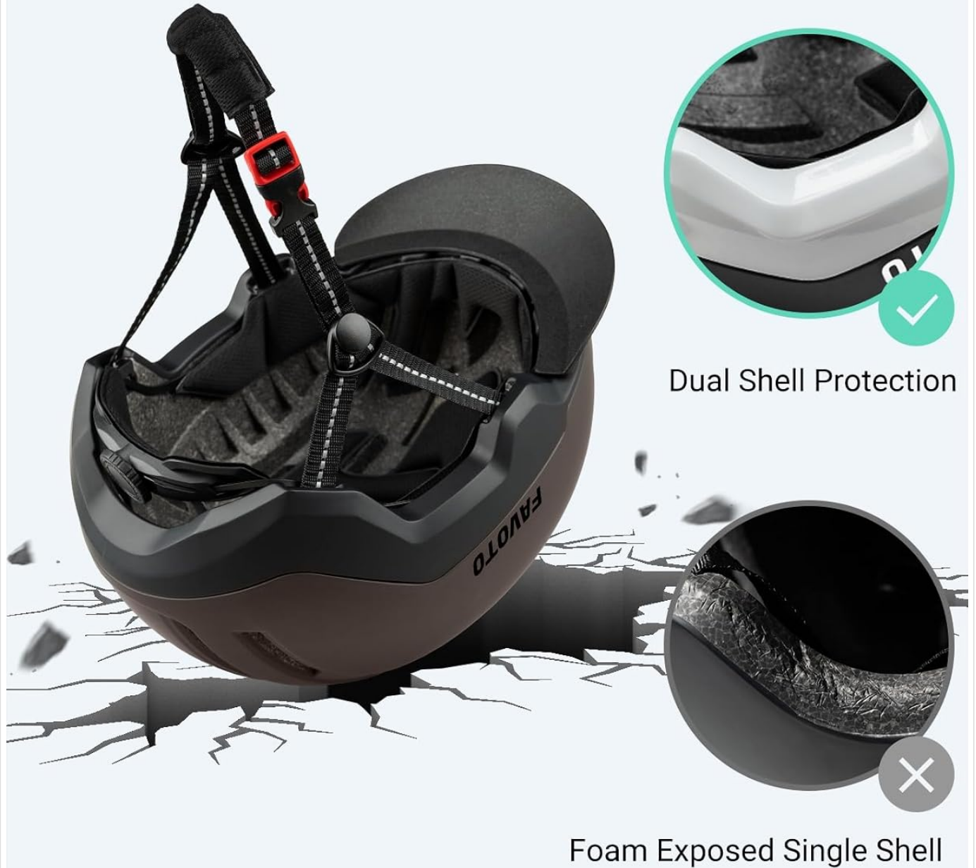
Figure 2: Illustration of the helmet's Dual Shell Protection technology, which provides comprehensive and durable safety compared to single-layer shells. This design enhances impact resistance.

Dual Shell provides comprehensive protection and is more durable and safer than the single-layer shell.