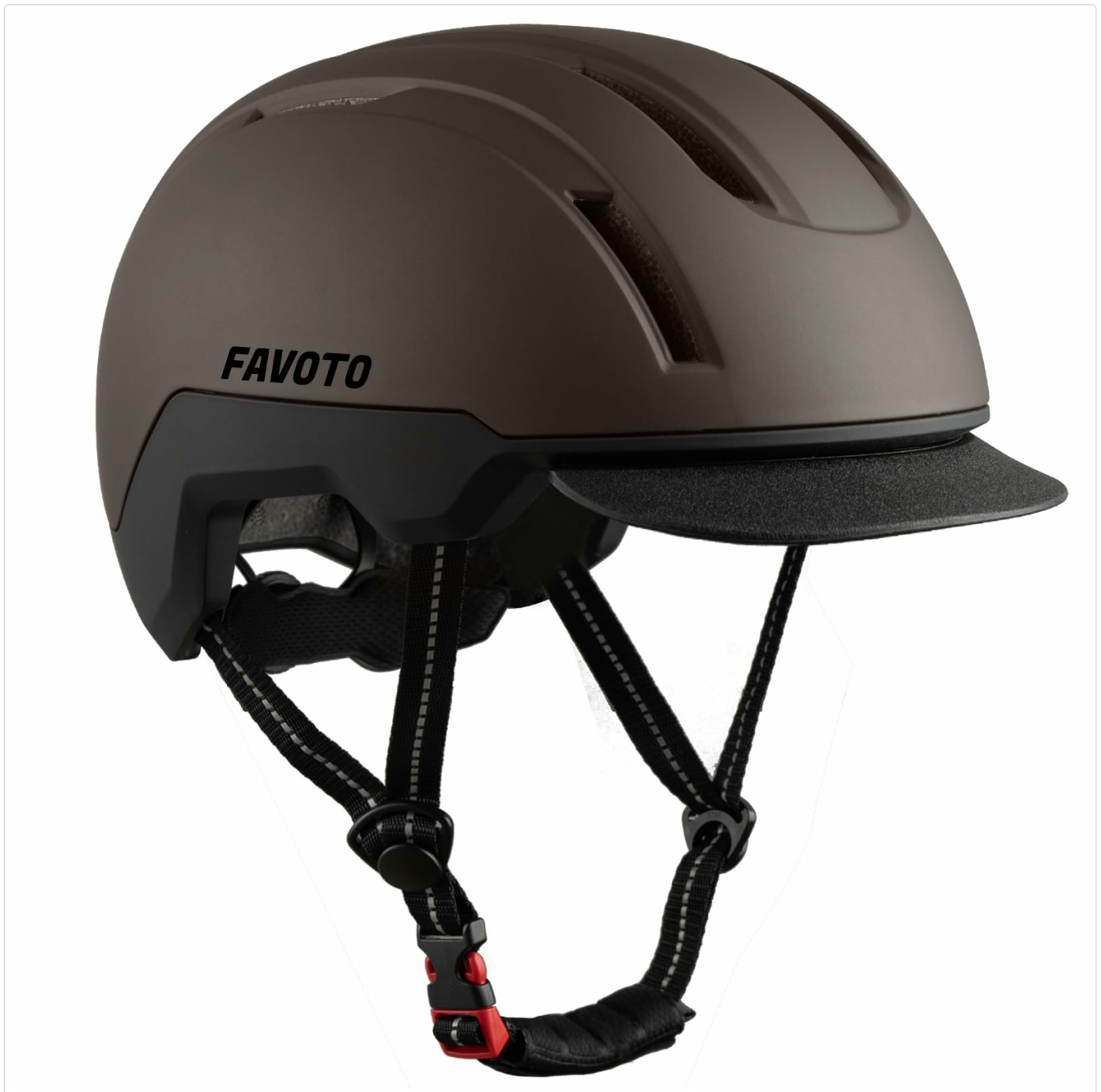
Figure 1: Overview of the Favoto Urban Cycling Helmet, highlighting its breathable design with 10 vents for optimal airflow, lightweight construction at approximately 290g, and comfortable, removable, and washable liner.