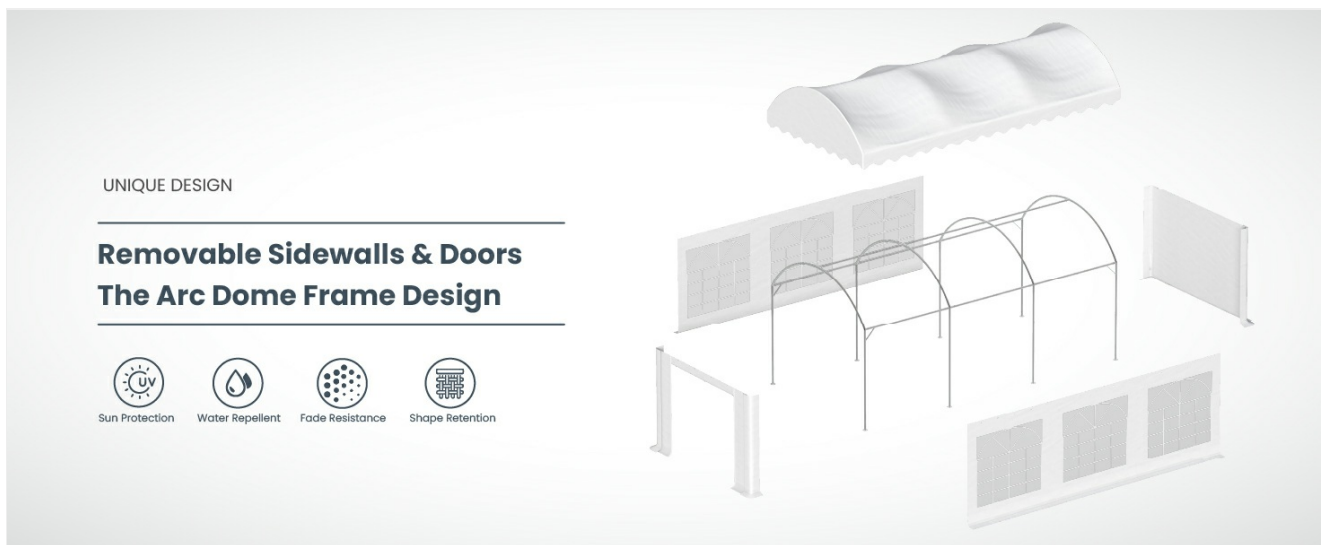
Image 2: An exploded diagram showing the main components of the party tent, including the frame, roof cover, and removable sidewalls.