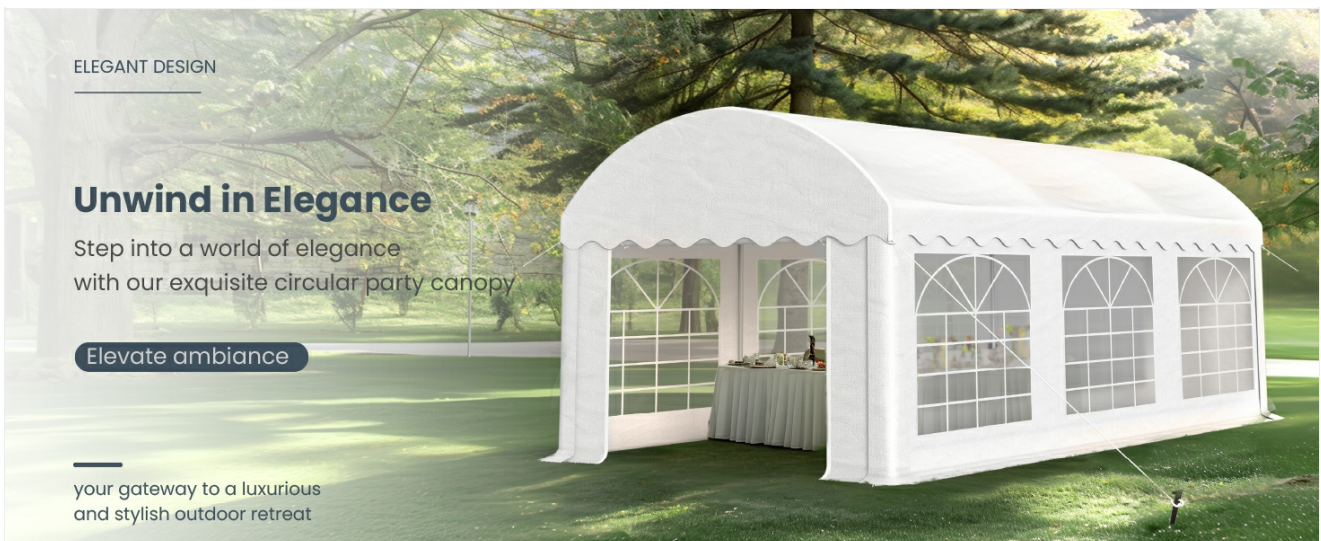
Image 1: The PHI VILLA Party Tent demonstrating its waterproof and UV protection capabilities, suitable for various outdoor conditions.

This manual provides detailed instructions for the assembly, operation, and maintenance of your PHI VILLA 20'x10' Heavy Duty Party Tent. This tent is designed for outdoor events, offering shelter and protection from various weather conditions. Please read all instructions carefully before assembly and use to ensure safe and proper operation.