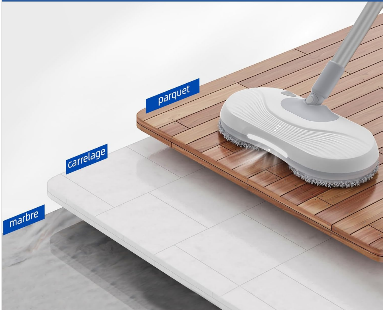
Figure 6: Effective on various hard floor surfaces.