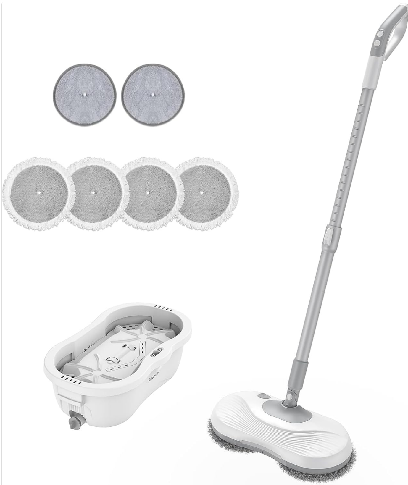
Figure 1: Redkey M1 Cordless Electric Mop, self-cleaning bucket, and included washing pads.