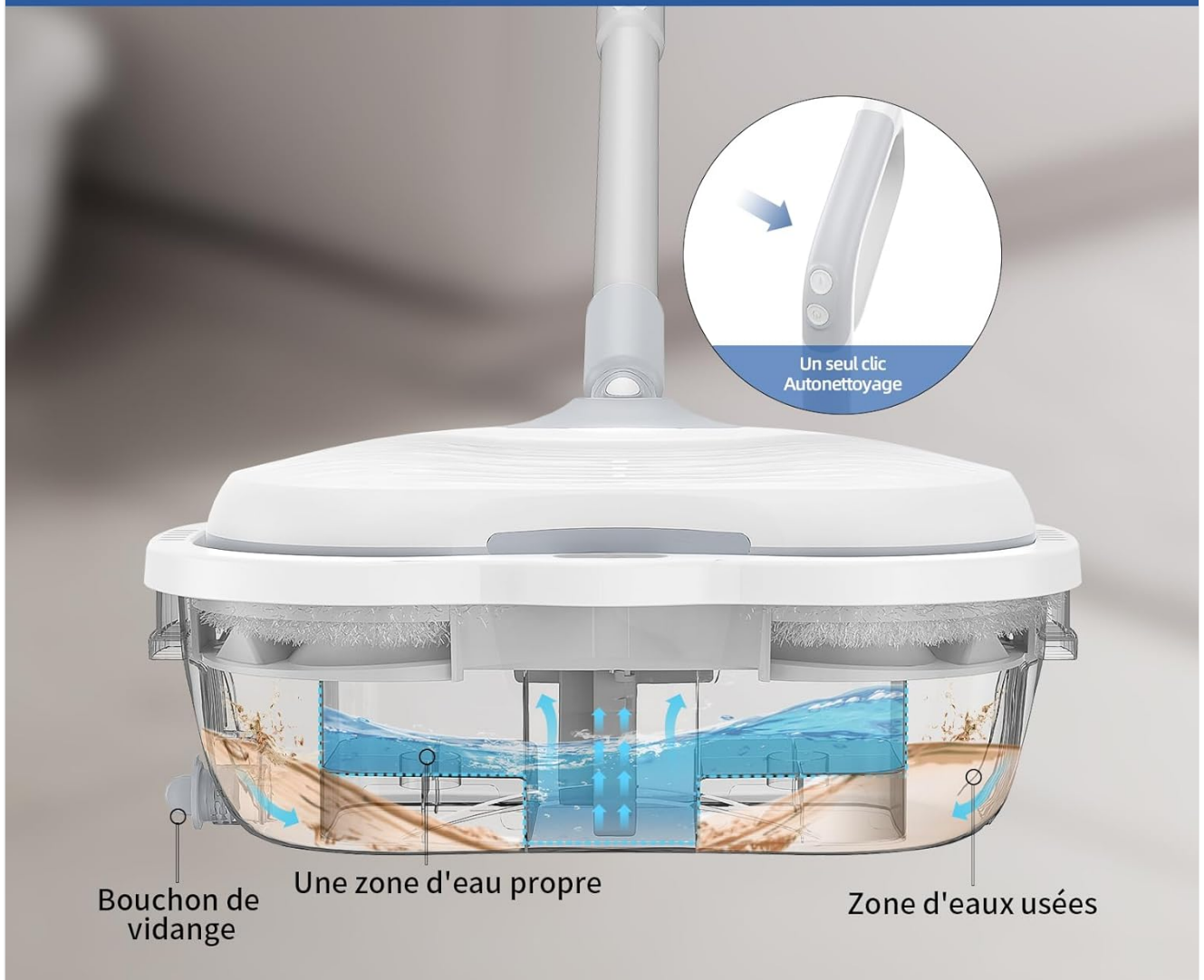
Figure 7: The self-cleaning bucket separates clean and dirty water for efficient pad cleaning.

Maintenez le bouton de pulvérisation d'eau enfoncé pendant 2 secondes, la machine passe en mode de nettoyage automatique. Après 15 secondes de nettoyage et 30 secondes de grattage, le nettoyage s'arrêtera automatiquement.