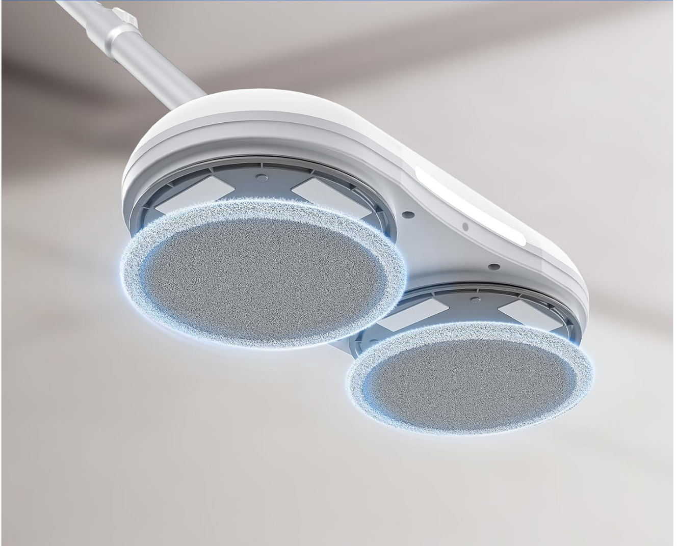
Figure 8: The durable microfiber pads are washable and reusable.

Le tampon en fibres ultrafines à grain abrasif et au toucher doux, réutilisable, est inclus dans l'emballage et peut être jeté dans la machine à laver après utilisation.