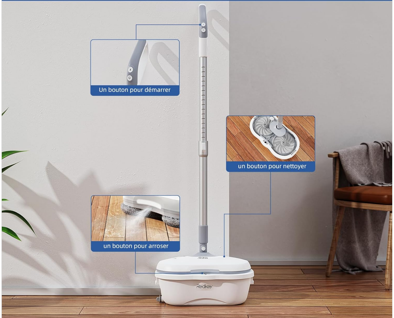
Figure 4: Control buttons for starting, cleaning, and spraying water.