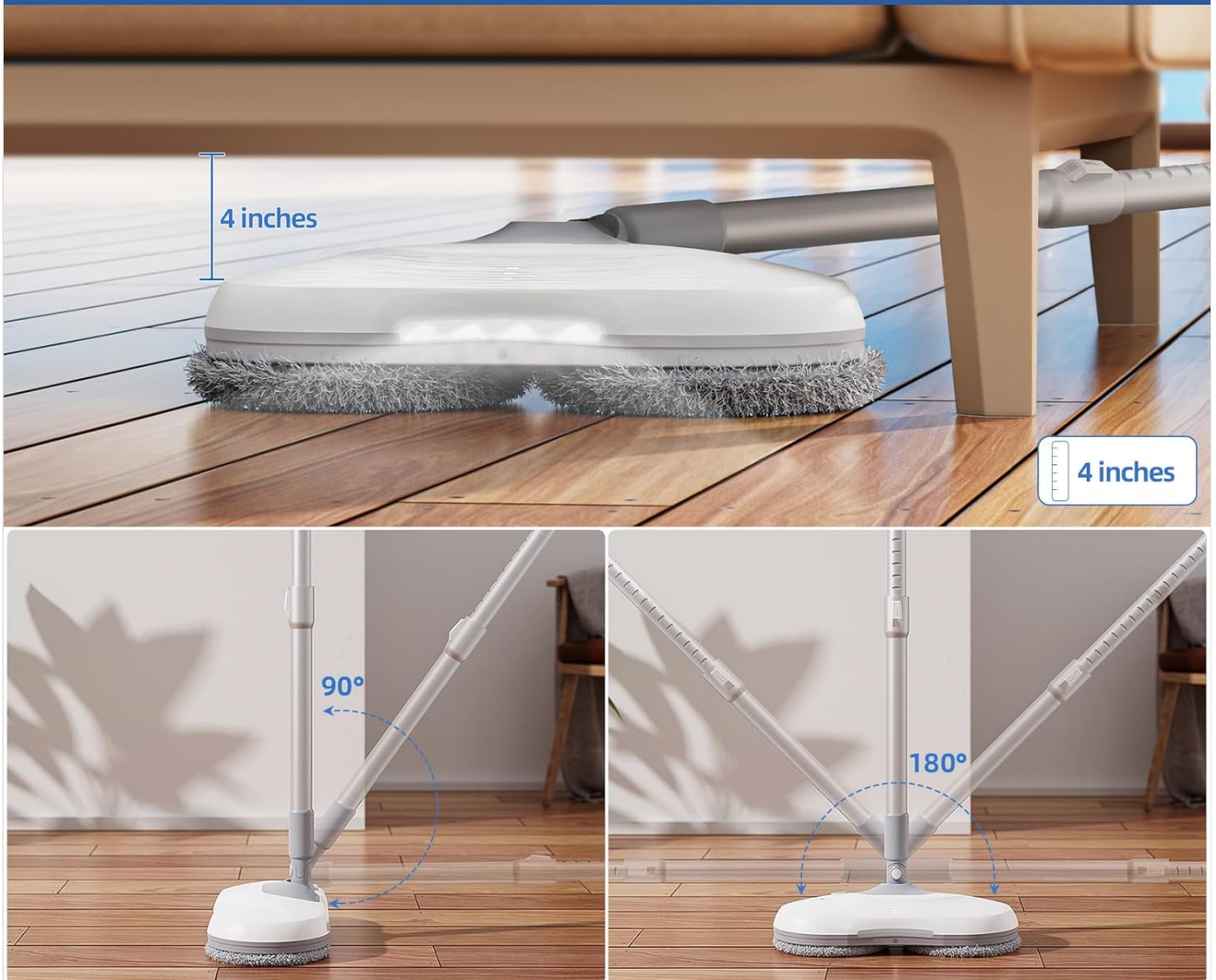
Figure 5: The mop head adjusts to various angles for versatile cleaning.