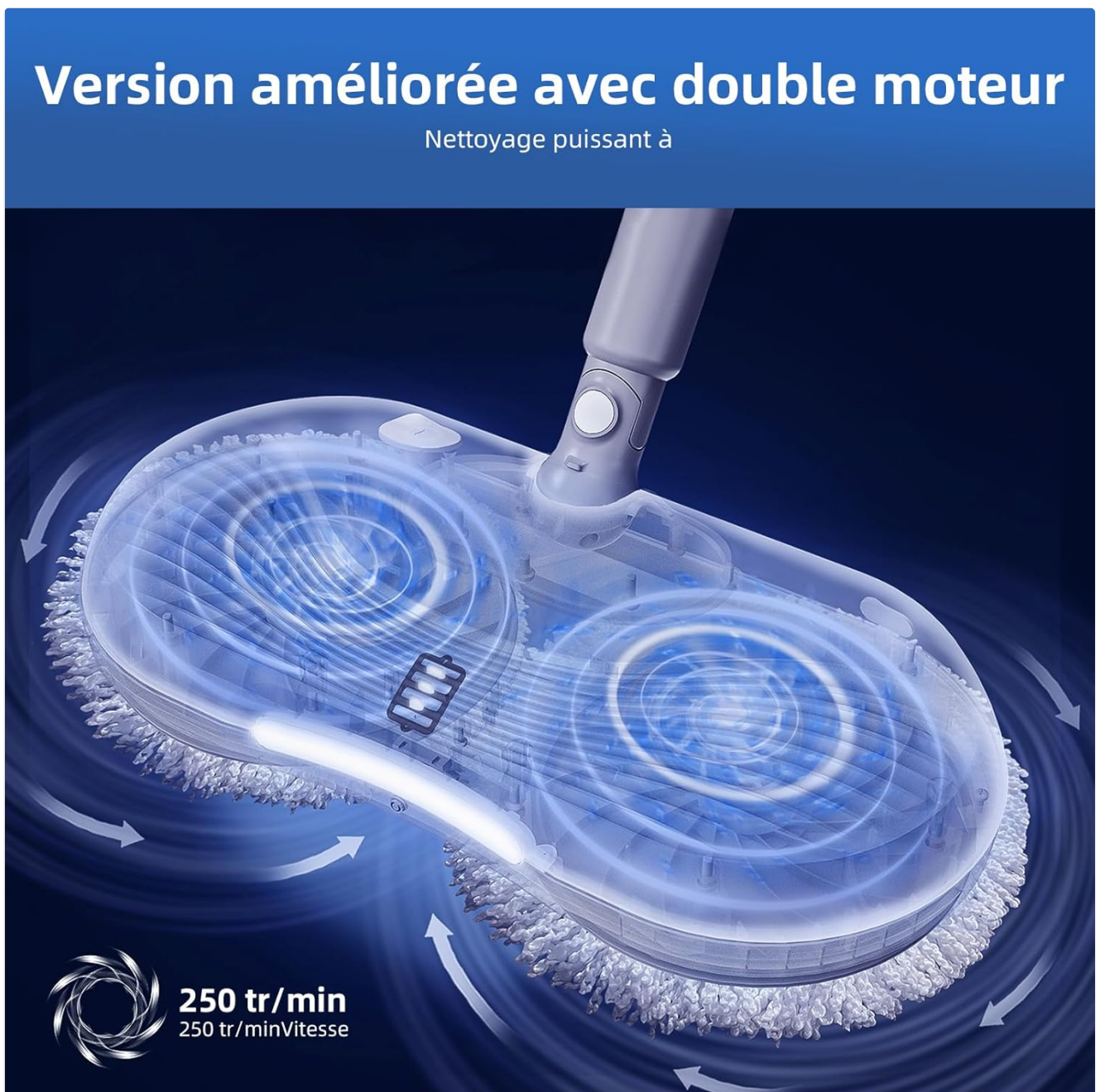
Figure 3: The Redkey M1 features powerful dual motors for efficient cleaning.

Once powered on, the dual motors will begin spinning the mop pads at up to 220 RPM, effectively cleaning your floors.