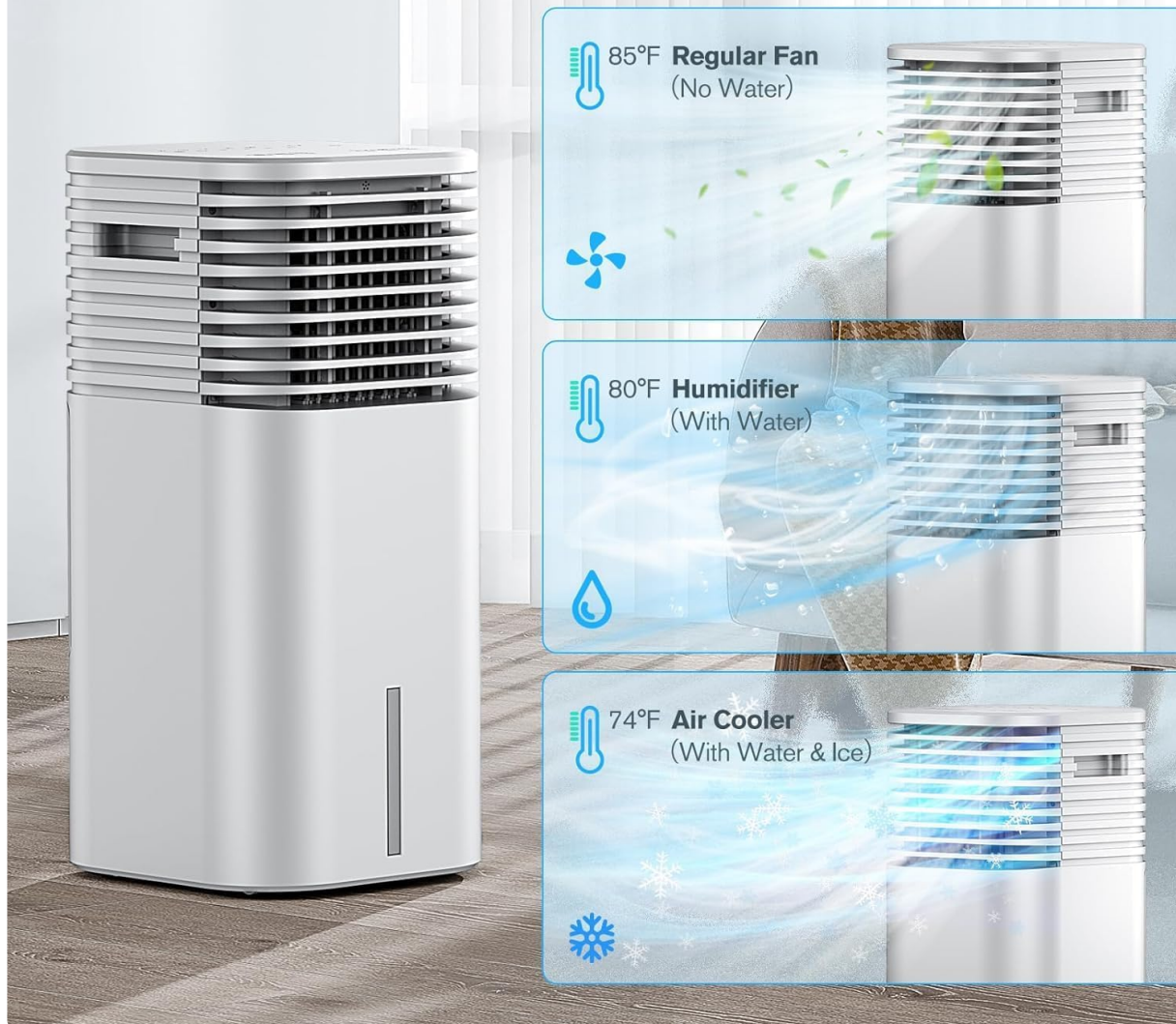
Image 4: The 3-in-1 functionality of the unit: Fan mode (no water), Humidifier mode (with water), and Air Cooler mode (with water and ice).