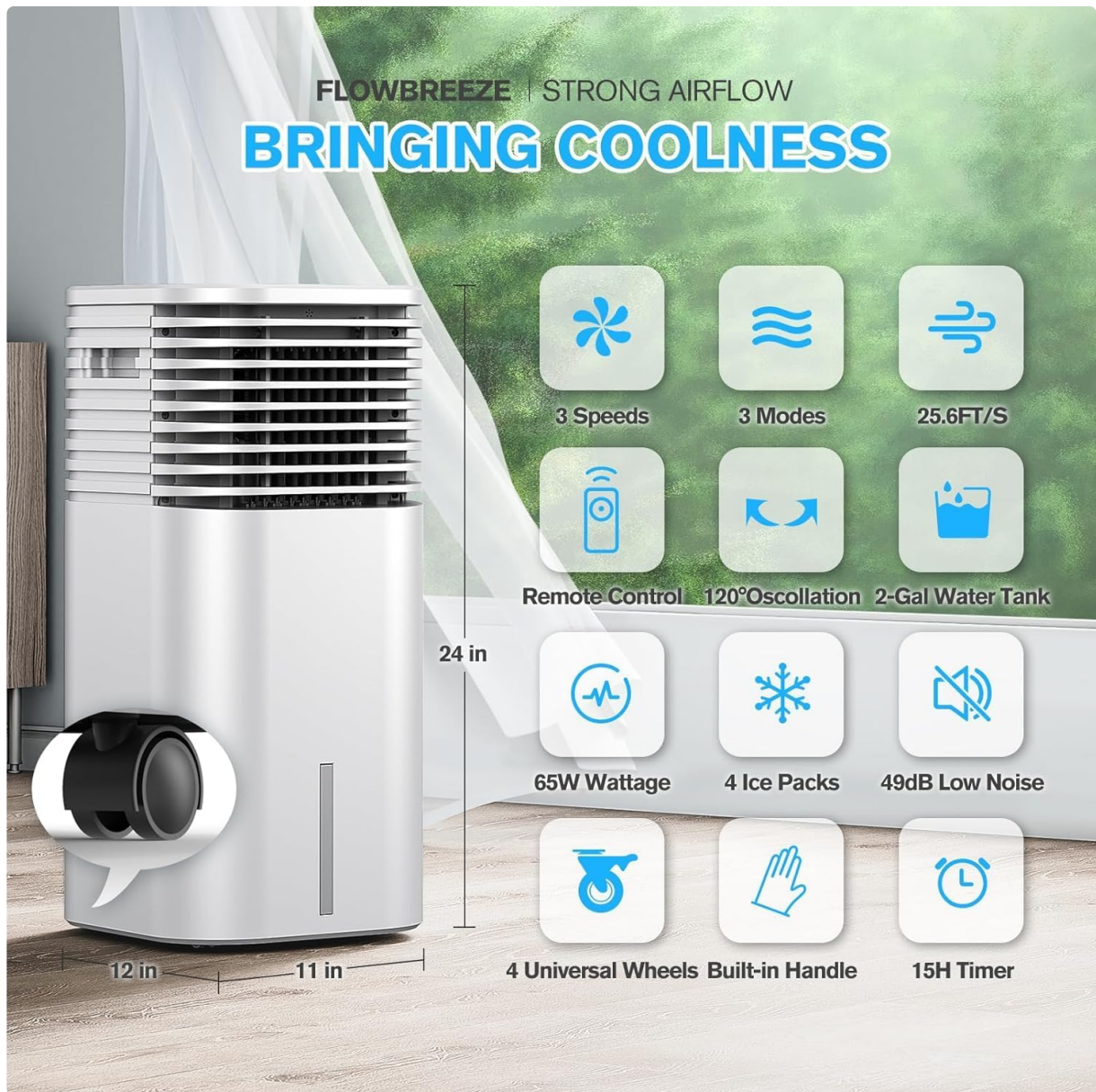
Image 2: Overview of the unit's dimensions (24" H, 12" D, 11" W) and key features including 3 speeds, 3 modes, 25.6 ft/s airflow, remote control, 120° oscillation, 2-gallon water tank, 65W wattage, 4 ice packs, 49dB low noise, 4 universal wheels, built-in handle, and 15H timer.