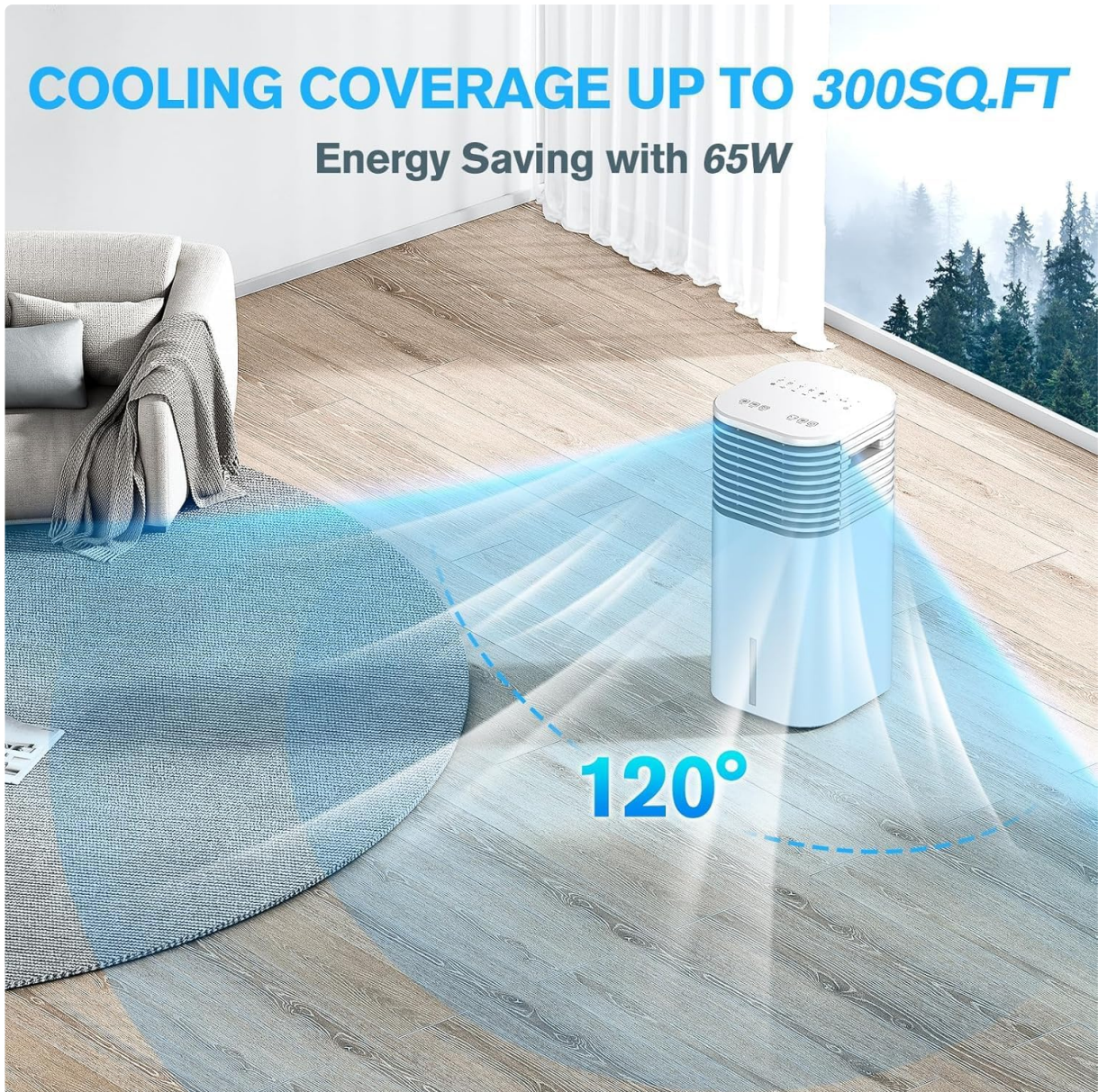
Image 8: The unit's 120° oscillation capability ensures wide cooling coverage up to 300 sq.ft.

The unit features 120° automatic horizontal oscillation to distribute cool air evenly across the room. Vertical airflow can be manually adjusted by 20° using the shutters for targeted cooling.