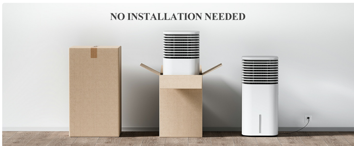
Image 3: The unit is ready for immediate use upon unboxing and plugging in, requiring no complex installation.