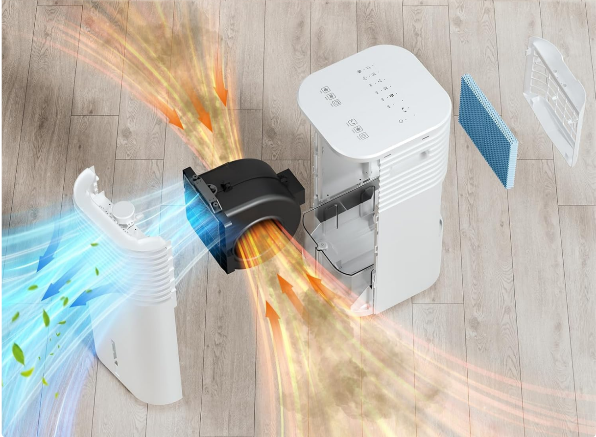
Image 11: The internal turbo design and removable filter for easy maintenance and efficient airflow.

It can balance the temperature and promote air circulation, which is something that ordinary fans cannot do.