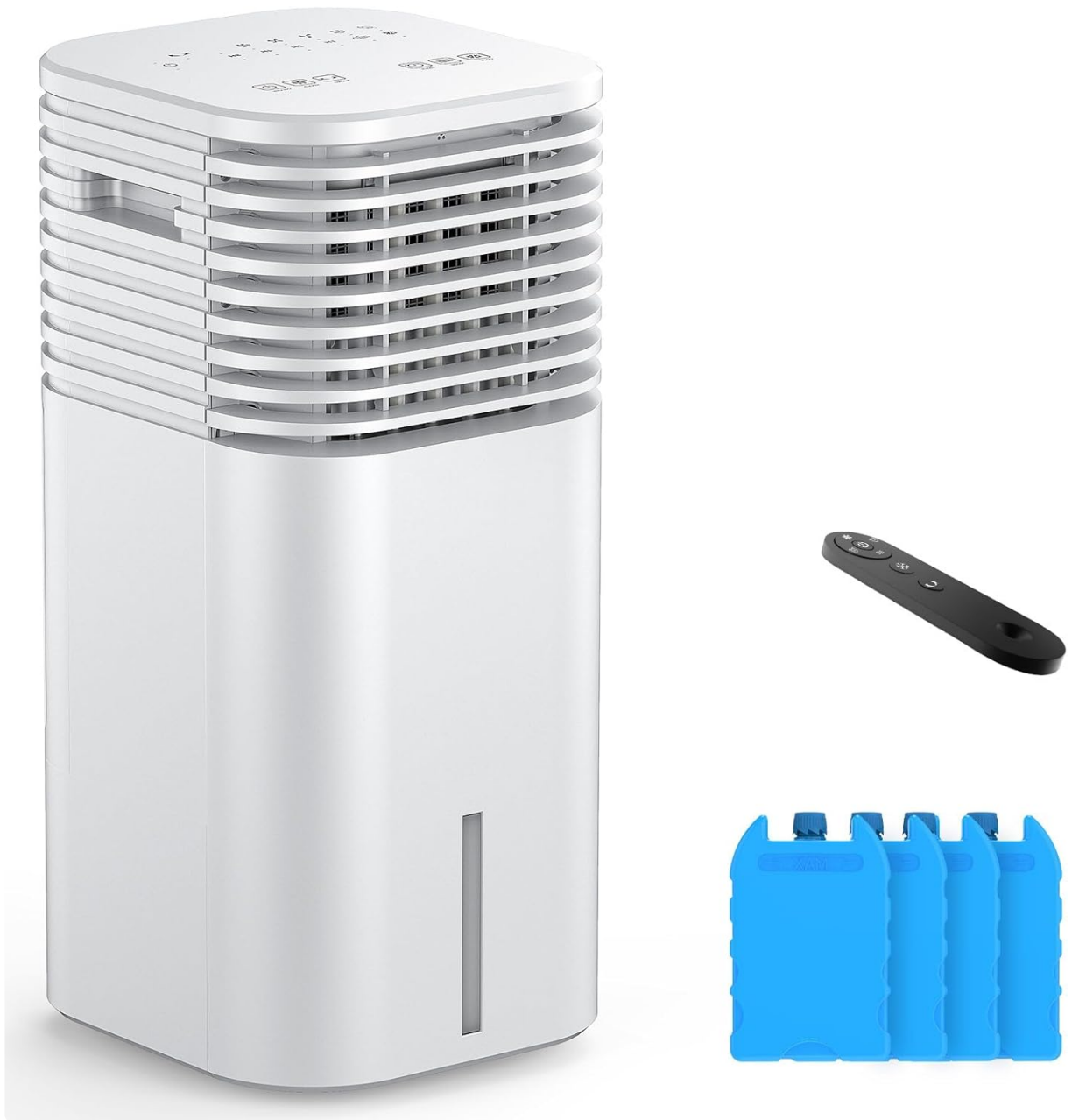
Image 1: The FLOWBREEZE DL3W Portable Air Conditioner, its remote control, and the four included ice packs.