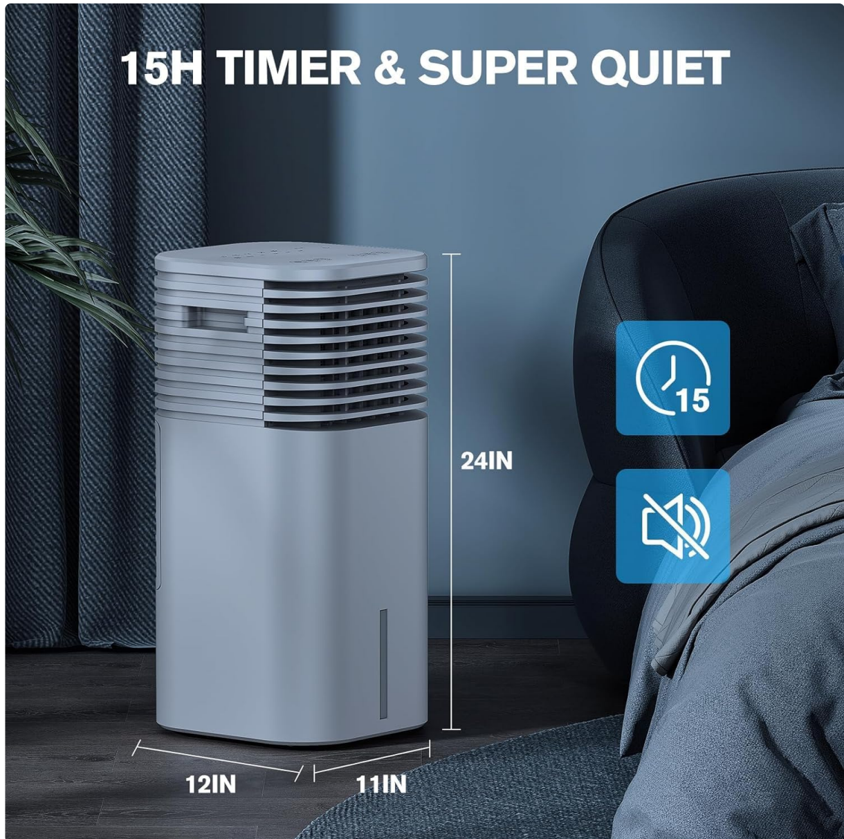
Image 9: The unit features a 15-hour timer and operates at an ultra-quiet 49dB, ideal for undisturbed sleep or work.

Set the timer for 0-15 hours to automatically turn off the unit. This feature is useful for energy saving and for ensuring the unit turns off after you fall asleep or leave the room.