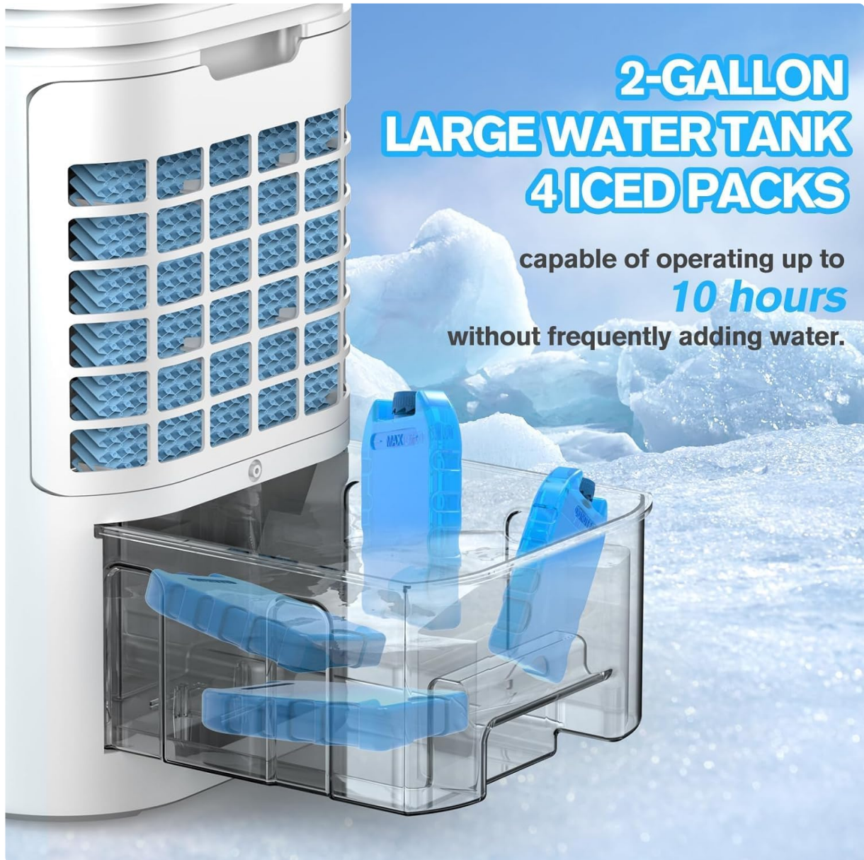
Image 6: The 2-gallon water tank, designed to hold the four ice packs for extended cooling.

The unit will then blow cooler wind. The 2-gallon tank allows for up to 10 hours of continuous operation without frequent refills. When the water runs out, the unit automatically switches to fan mode.