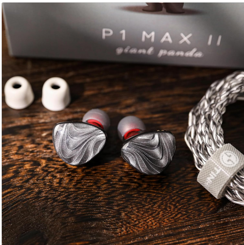
Figure 2: Included eartips and IEM units.