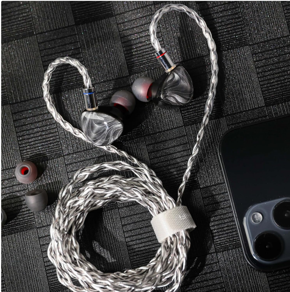
Figure 4: IEMs connected to a mobile device for audio playback.