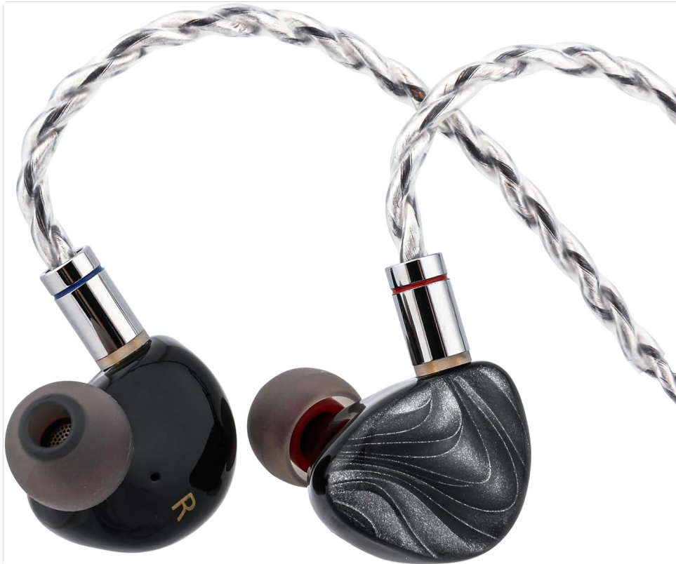
Figure 1: Linsoul TIN HiFi P1 MAX II In-Ear Monitors with detachable cable.

The Linsoul TIN HiFi P1 MAX II In-Ear Monitors (IEMs) are designed for audiophiles and gamers seeking a high-fidelity audio experience. Featuring a next-generation 14.2mm planar magnetic driver, these wired earbuds offer precise sound reproduction and an ergonomic design for extended comfort.