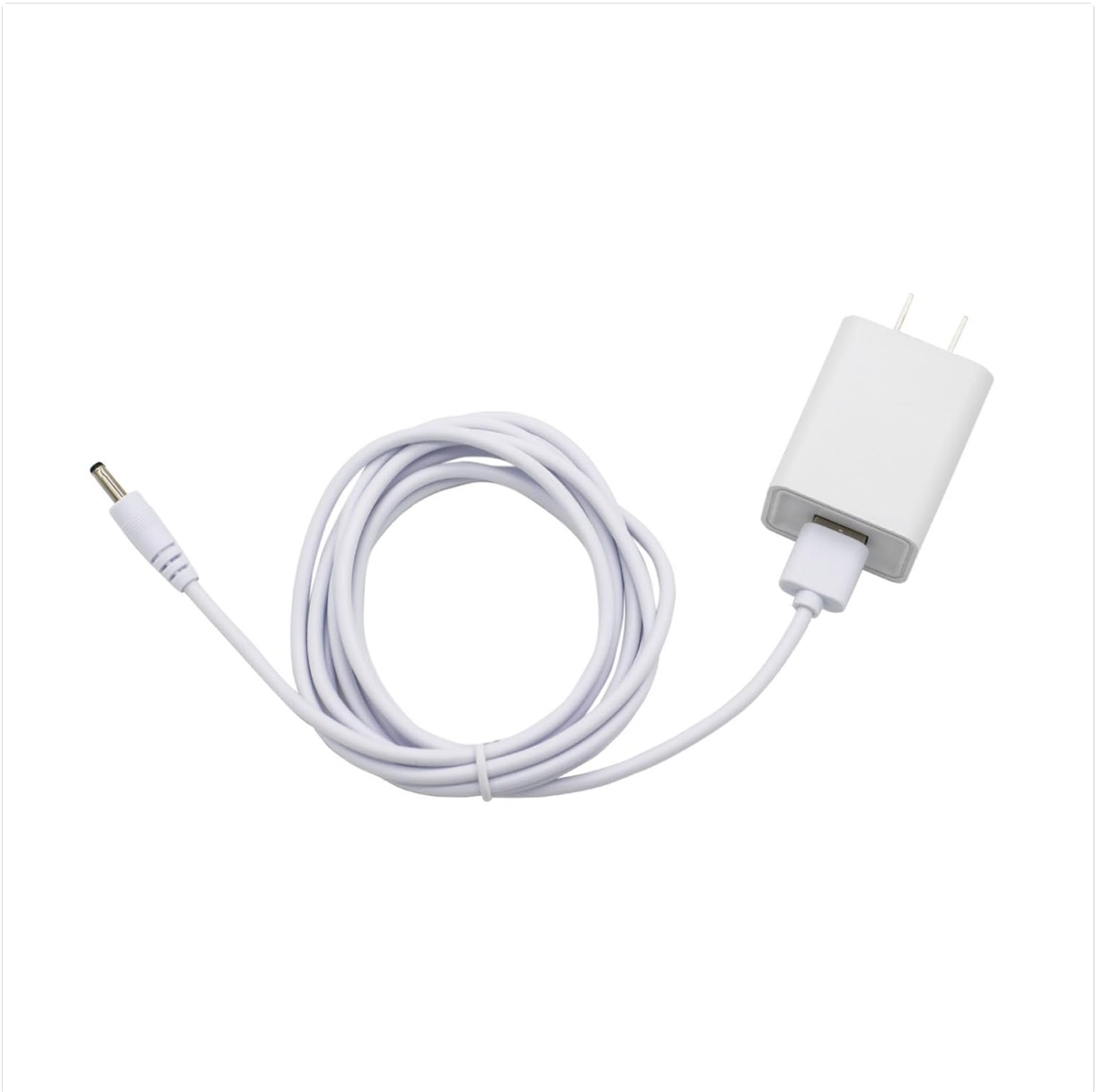
Image: The PDEEY 5V 2A power adapter and the USB to DC charging cable, coiled neatly.