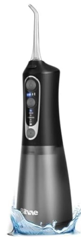
Bitvae C6 Water Flosser

Image: A visual representation of compatible Bitvae devices, including electric toothbrushes (R1, D2, R2, S2) and water flossers (C2, C5, C6).