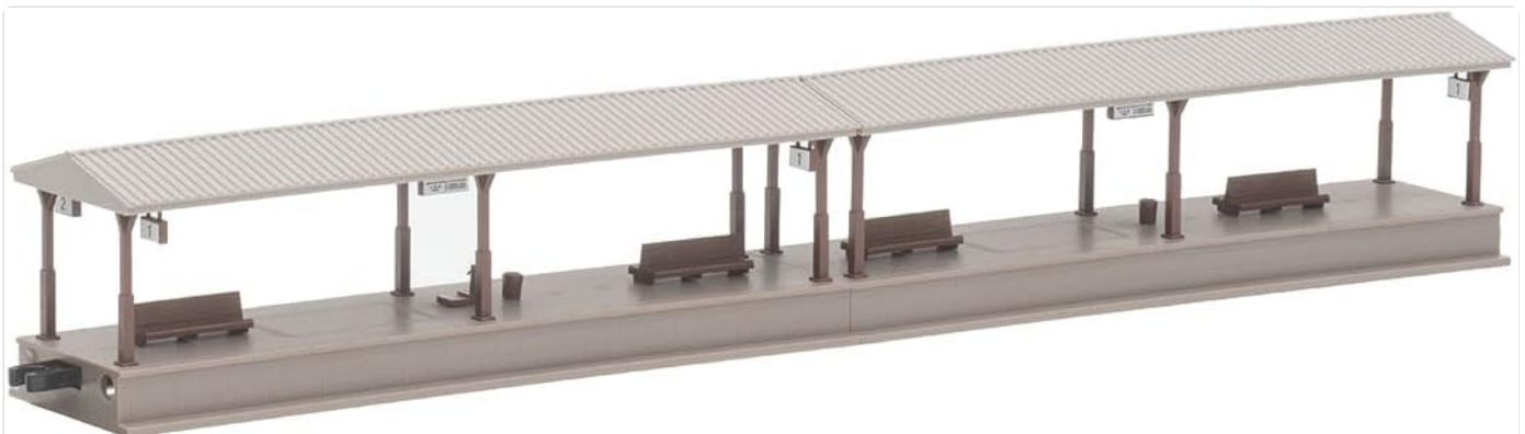
Figure 1.1: Overview of the TOMIX 4258 N Gauge Island Type Local Type Covered Extension Part.