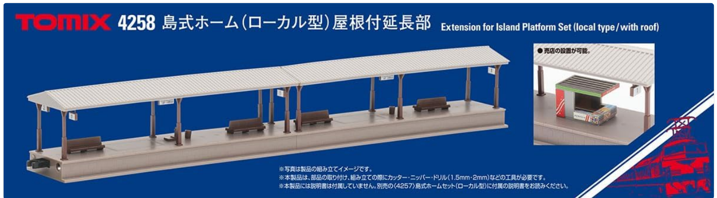
Figure 3.1: The TOMIX 4258 extension part, illustrating its design and potential for customization.