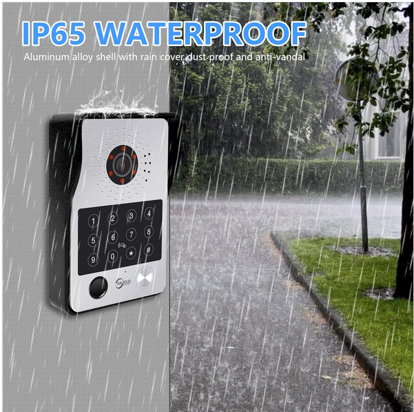
Image: The doorbell unit is shown installed on an exterior wall during a rain shower, highlighting its IP65 waterproof and anti-vandal features.

The outdoor doorbell unit features an IP65 waterproof rating, providing protection against dust and water splashes. The aluminum alloy shell with a rain cover enhances its durability against various weather conditions.