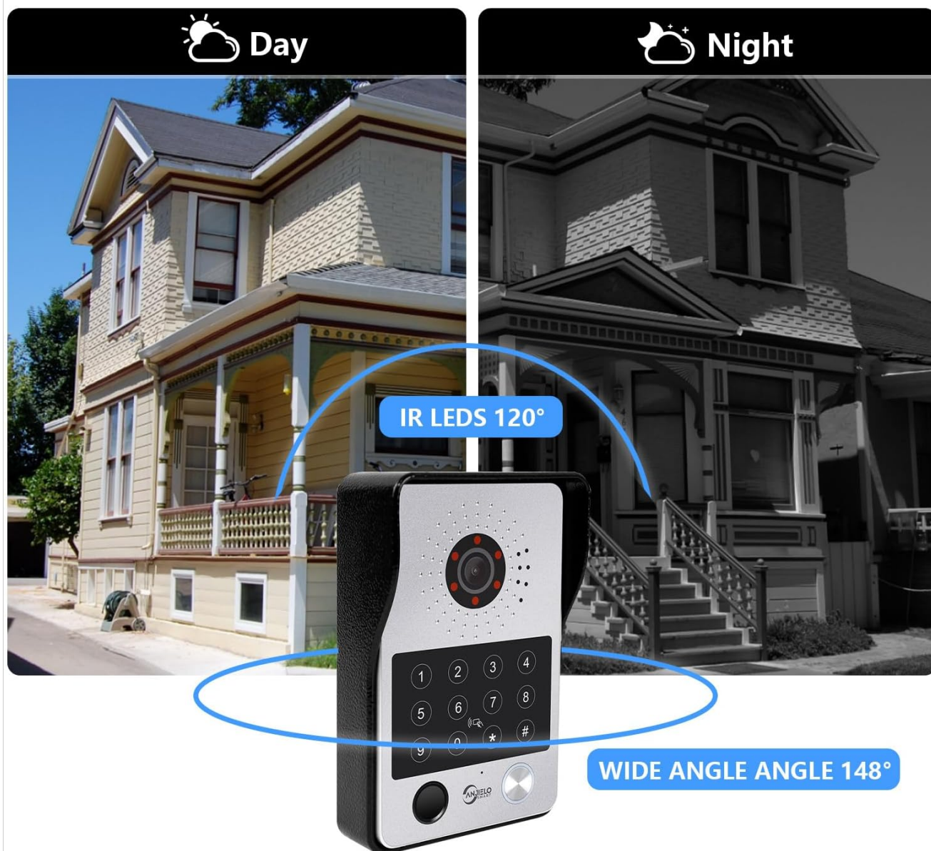
Image: Displays the doorbell's 1080P HD camera performance during both day and night, emphasizing the 148-degree wide-angle view and the effectiveness of the 120-degree IR LEDs for clear night vision.

You can see clearly without light even dark