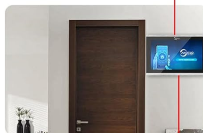
Image: Illustration of 4-wire cable connections between the indoor monitor, outdoor doorbell, and an electronic lock. The diagram indicates that the longest distance between the monitor and camera is 100m.