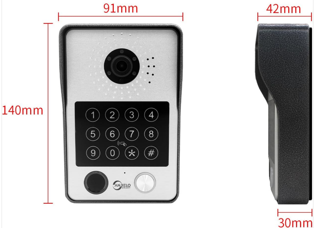
Image: A close-up diagram of the doorbell unit, labeling its components such as the rain cover, IR-LED, camera, speaker, keypad, card reader, microphone, call button, and fingerprint sensor. Dimensions are also provided: 140mm height, 91mm width, and 30mm depth.