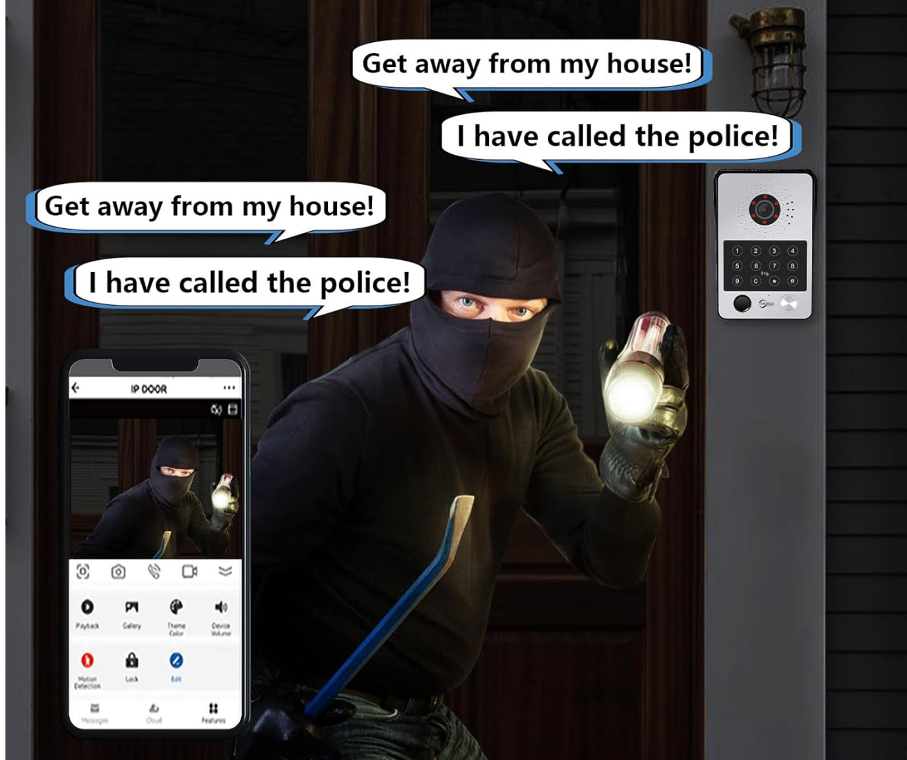
Image: Illustrates the smart PIR motion detection feature, where an alert is received on a mobile phone and monitor when movement is detected, allowing for immediate response or warning.

Once movement is detected, you will receive an alert on your cell phone and monitor. Or warn the thief on your computer.