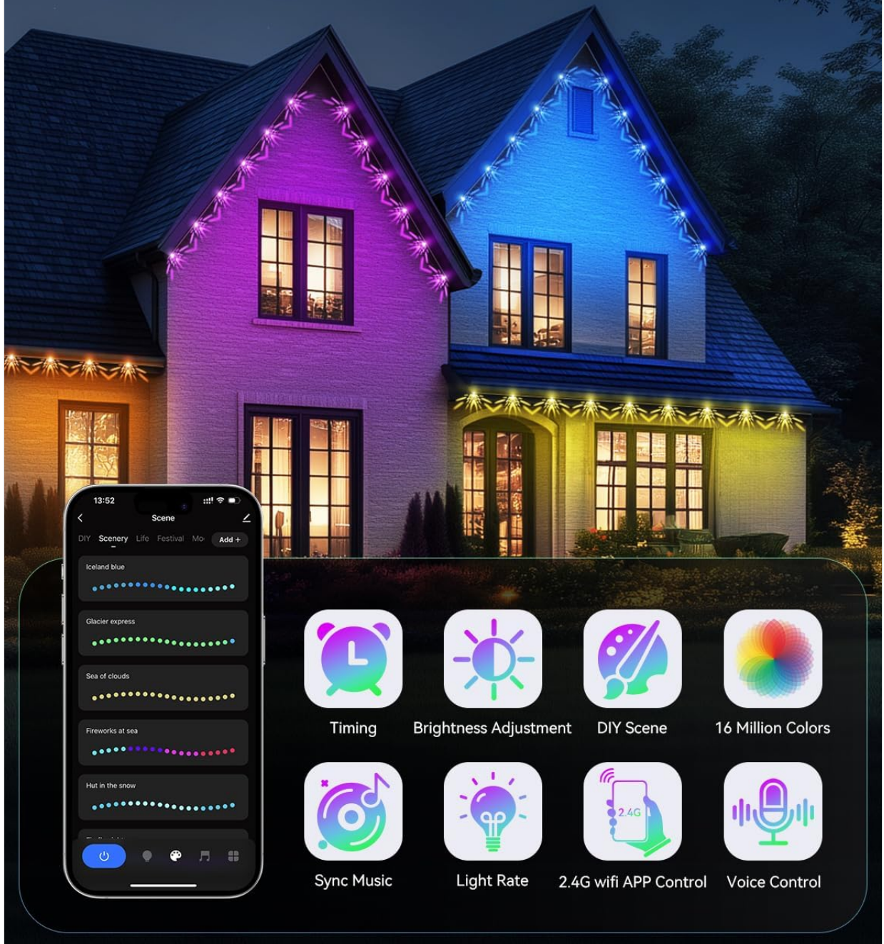
Image 3: The Lemon23 mobile application interface, illustrating various control options such as timing, brightness adjustment, DIY scenes, and color selection for the LemonNova lighting system.

More functions can be achieved through the Lemon23 APP