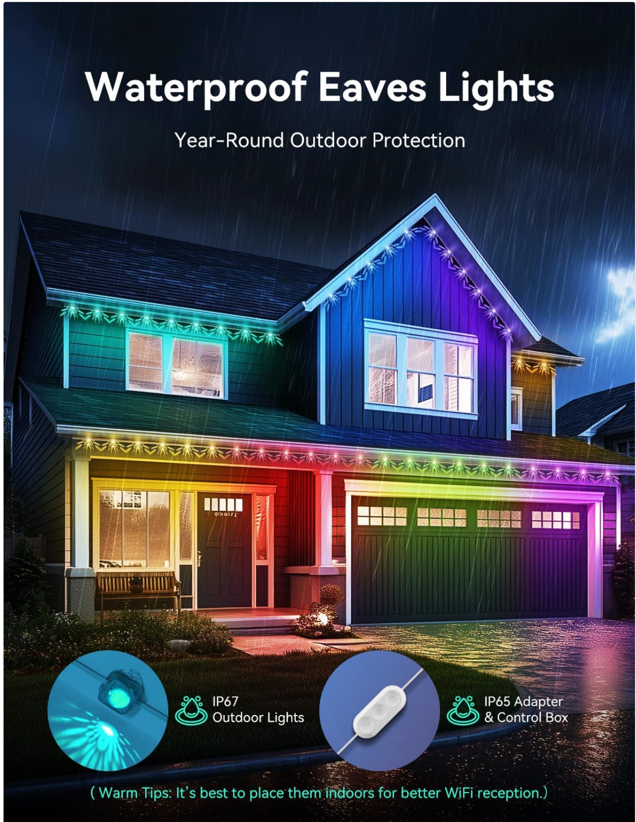
Image 4: LemonNova lights installed on a house during rainfall, highlighting their waterproof design (IP67 for lights, IP65 for adapter/control box).