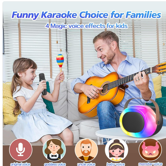
Image: A family enjoying the karaoke machine, illustrating the various voice changing effects available on the microphones.