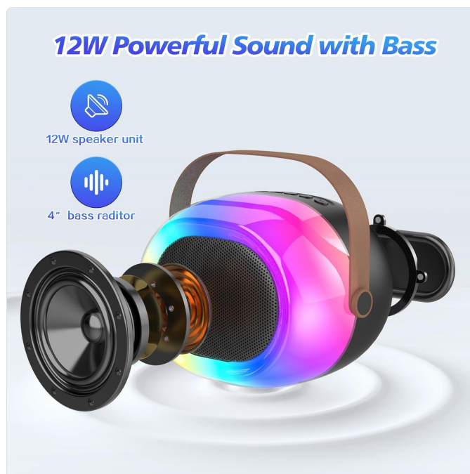
Image: An exploded view of the speaker unit highlighting its 12W speaker and 4-inch bass radiator for enhanced sound.