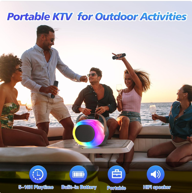
Image: The portable karaoke machine being used outdoors, emphasizing its built-in battery and extended playtime.