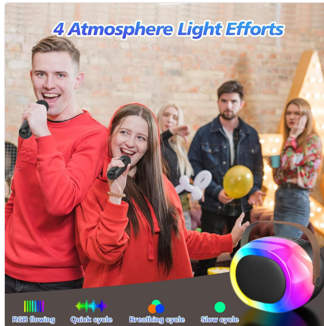
Image: The dynamic atmosphere lights of the karaoke machine creating a lively environment.

The speaker unit includes colorful dynamic atmosphere lights. These lights can be changed to different modes to enhance the ambiance. Refer to the speaker's control buttons for light mode selection (usually integrated with the 'M' button or a dedicated light button if available).