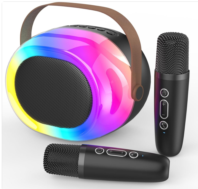
Image: The MEGUO K38 Portable Bluetooth Karaoke Machine, including the main speaker unit and two wireless microphones.