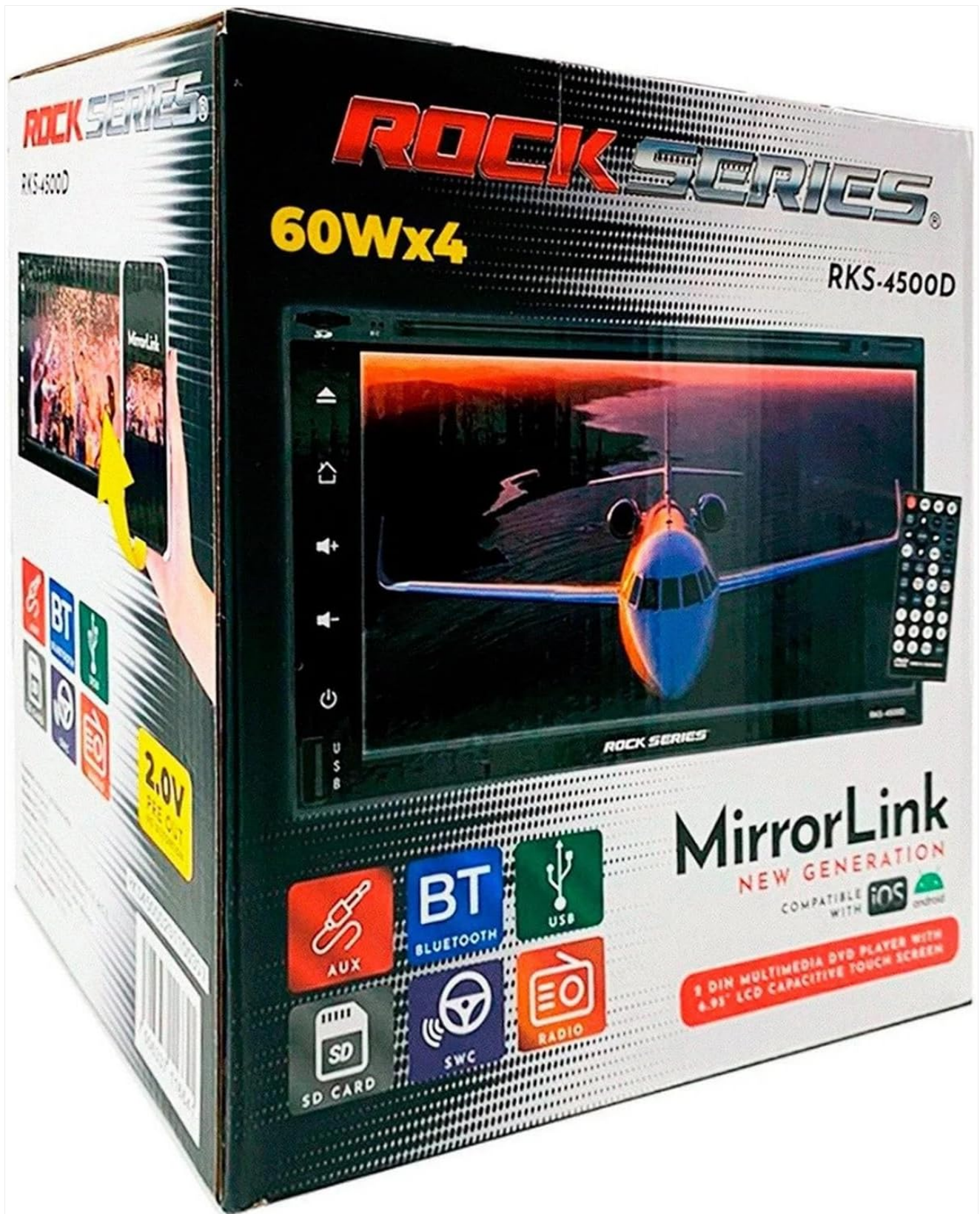
Figure 4.4: Retail packaging of the RKS-4500D, emphasizing MirrorLink compatibility for Android and iOS devices.