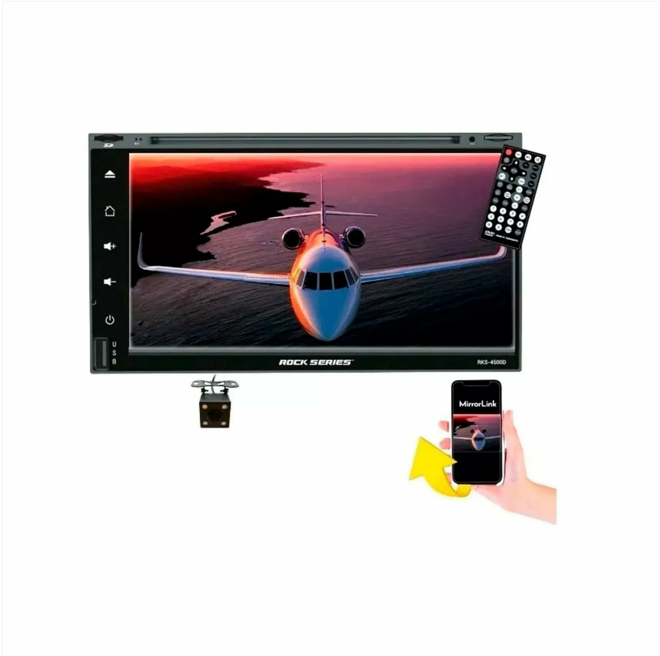
Figure 4.1: Rock Series RKS-4500D Car Stereo, remote control, and reverse camera, shown with its retail packaging.

Familiarize yourself with the components of your Rock Series RKS-4500D car stereo.