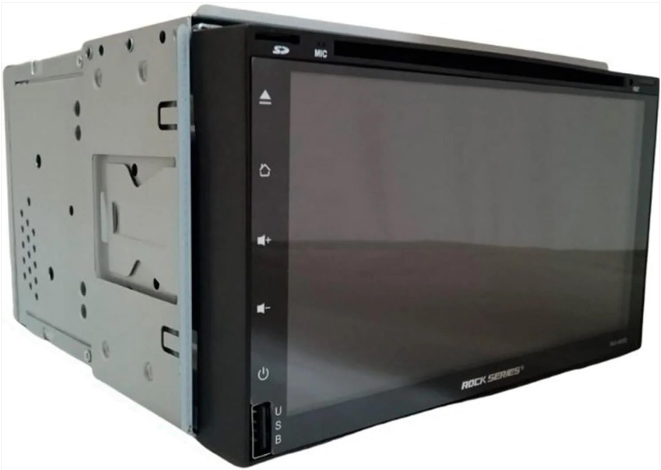
Figure 4.2: Side view of the RKS-4500D unit, showing the mounting brackets and ventilation.