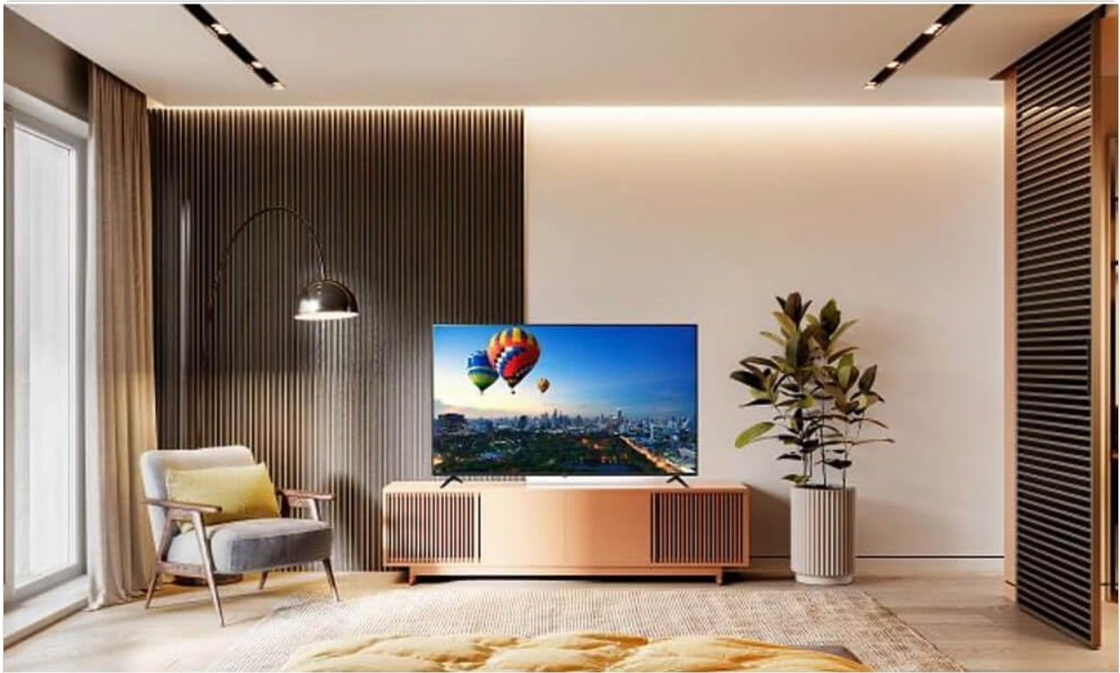
Image: The LG 50-Inch Class UT75 Series 4K UHD Smart TV seamlessly integrated into a modern living room, showcasing its sleek design and vibrant display.

Welcome to the instruction manual for your new LG 50-Inch Class UT75 Series 4K UHD Smart TV (Model: 50UT7570PUB). This television is designed to provide an immersive viewing experience with its 4K UHD resolution, powered by the advanced a5 AI Processor Gen7. Featuring the intuitive WebOS 24 platform and built-in Alexa, your LG TV offers seamless access to entertainment and smart home integration. This manual will guide you through the setup, operation, maintenance, and troubleshooting of your television to ensure optimal performance and enjoyment.