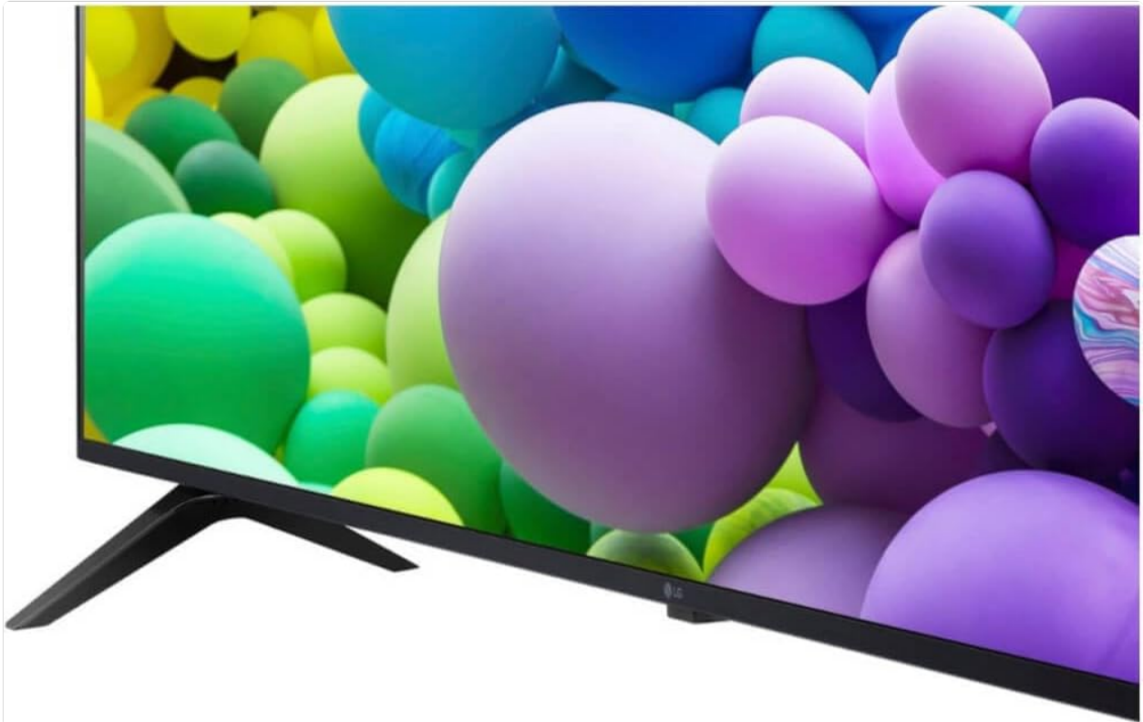
Image: A detailed view of the TV stand, showing its design and how it supports the television.