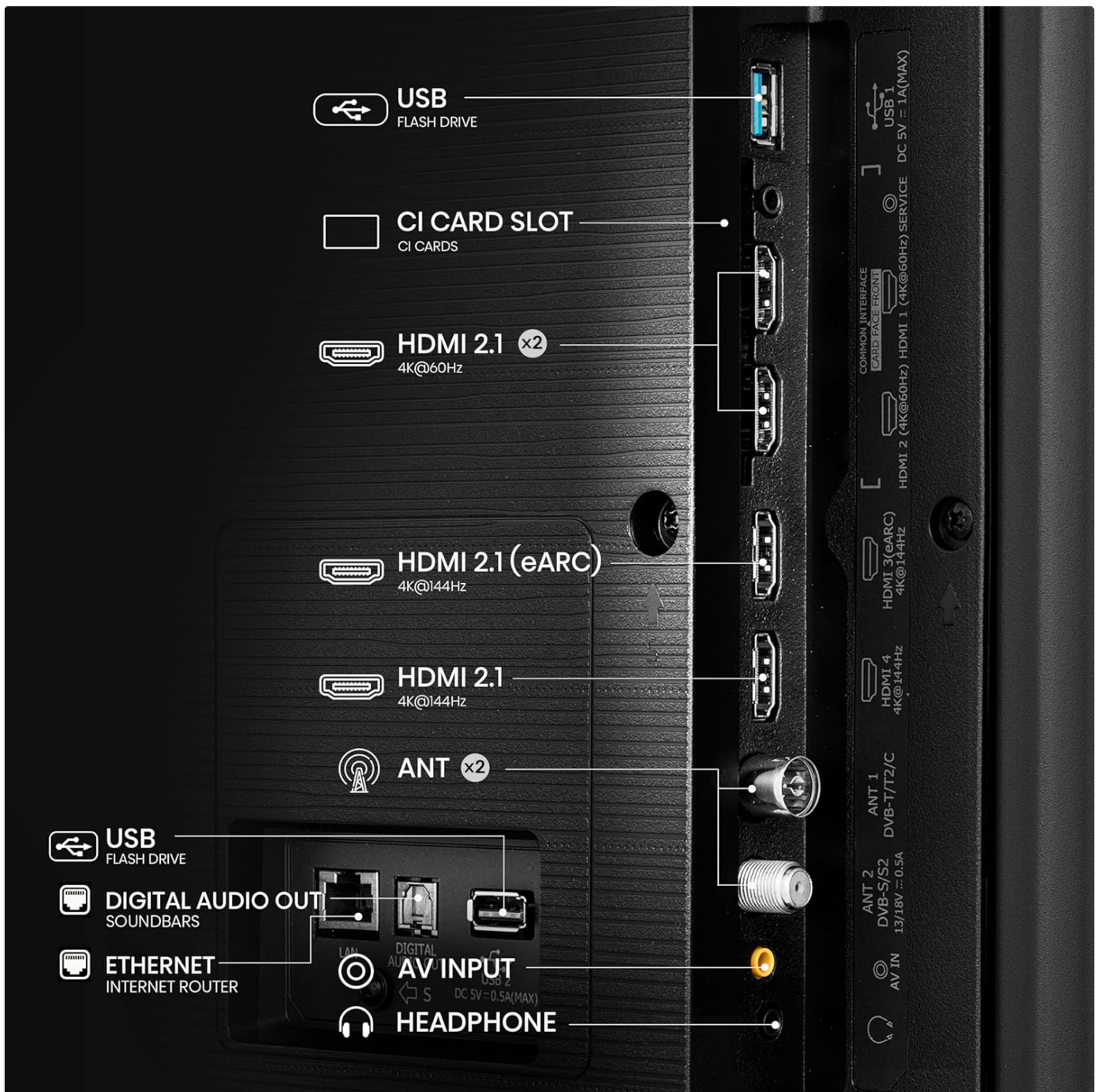
A detailed diagram of the Hisense TV's back panel, clearly labeling all available input and output ports including HDMI, USB, Ethernet, and antenna connections.