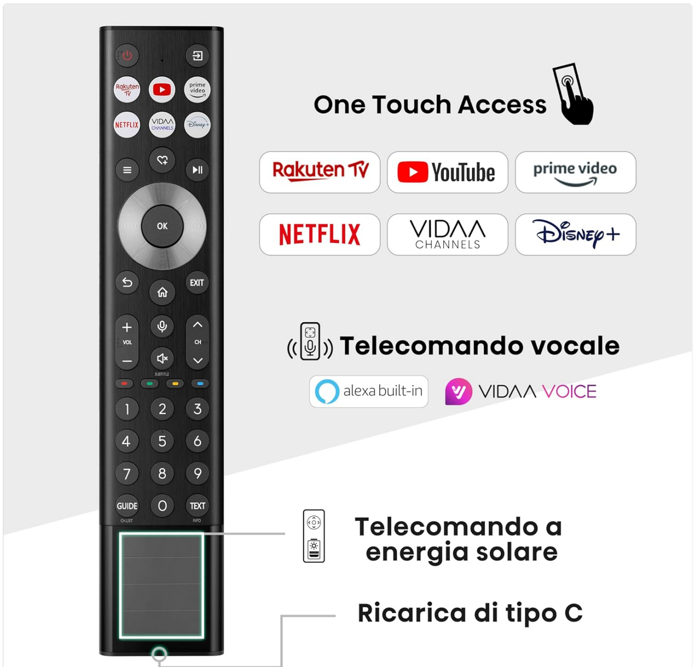
An image of the Hisense TV remote control, highlighting its solar charging capability, USB-C charging port, and dedicated buttons for voice control and popular streaming apps like Netflix and Prime Video.