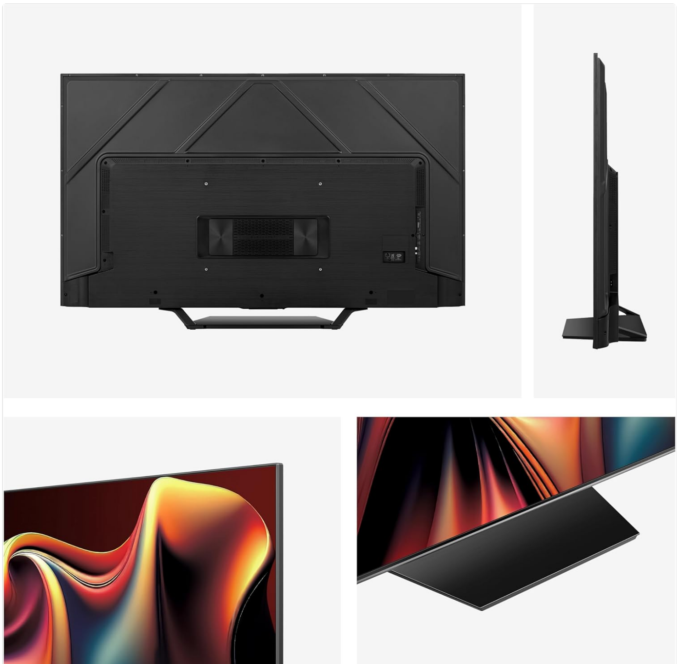
Various views of the Hisense TV, including the back panel, side profile, and close-ups of the stand and thin bezel.