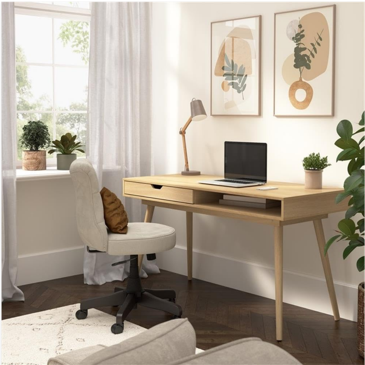
Image 1: The Bush Home Nora 54W Writing Desk in Natural Oak, shown in a modern home office environment with a laptop and office chair.