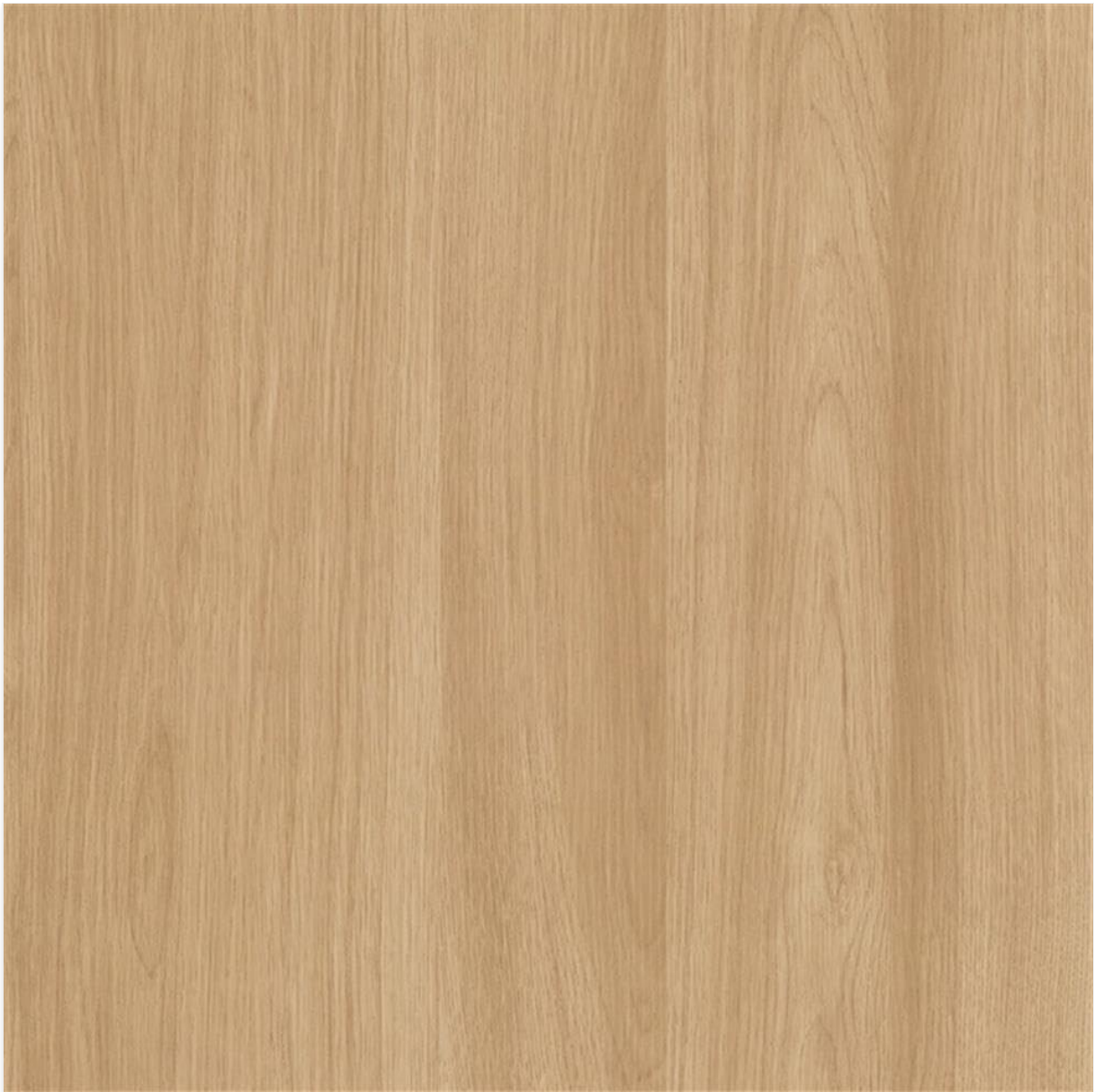
Image 5: A detailed view of the Natural Oak finish, highlighting the wood grain and texture of the desk surface.