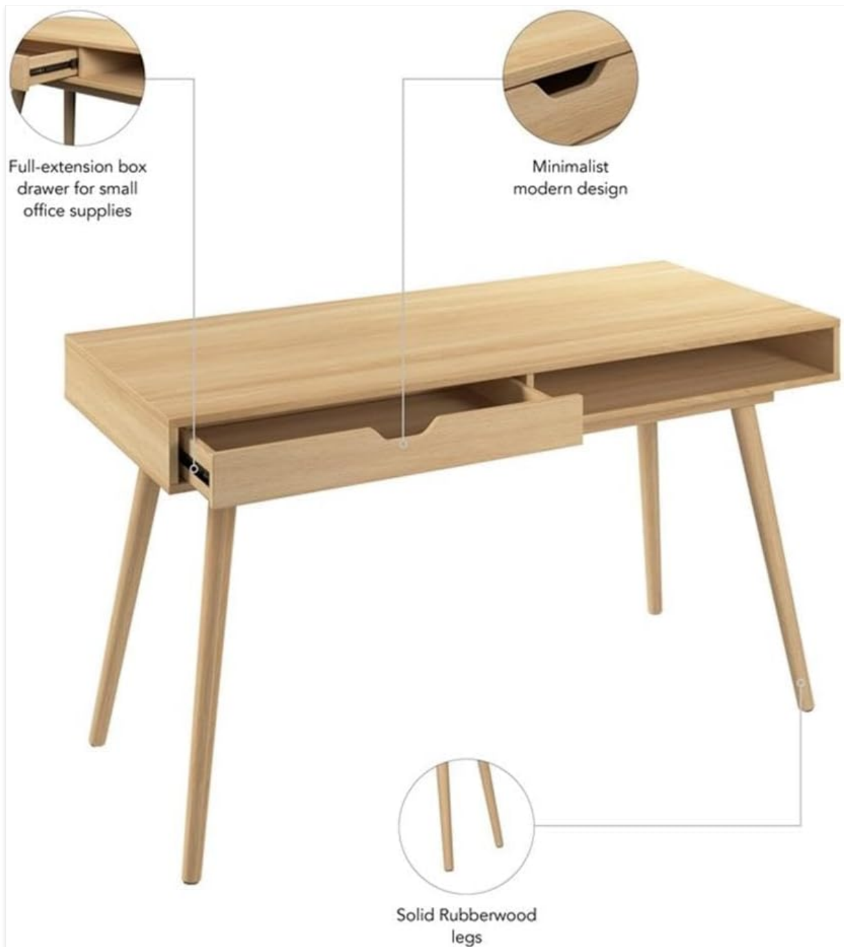
Image 3: Feature breakdown of the Nora Writing Desk, showing the full-extension drawer and the solid Rubberwood legs that contribute to its minimalist design.