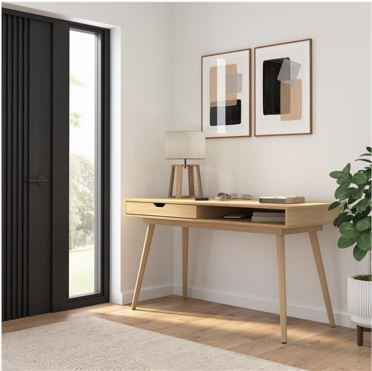
Image 4: The Nora Writing Desk configured as an entryway table, demonstrating its versatility beyond a traditional office setting.