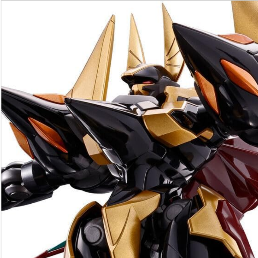
Image 1.1: Front close-up of the Gawain model, highlighting its detailed finish.

This manual provides detailed instructions for the assembly, operation, and maintenance of your BANDAI HG Gawain 1/35 Scale Model Kit. Please read all instructions carefully before beginning assembly to ensure proper construction and enjoyment of your model.