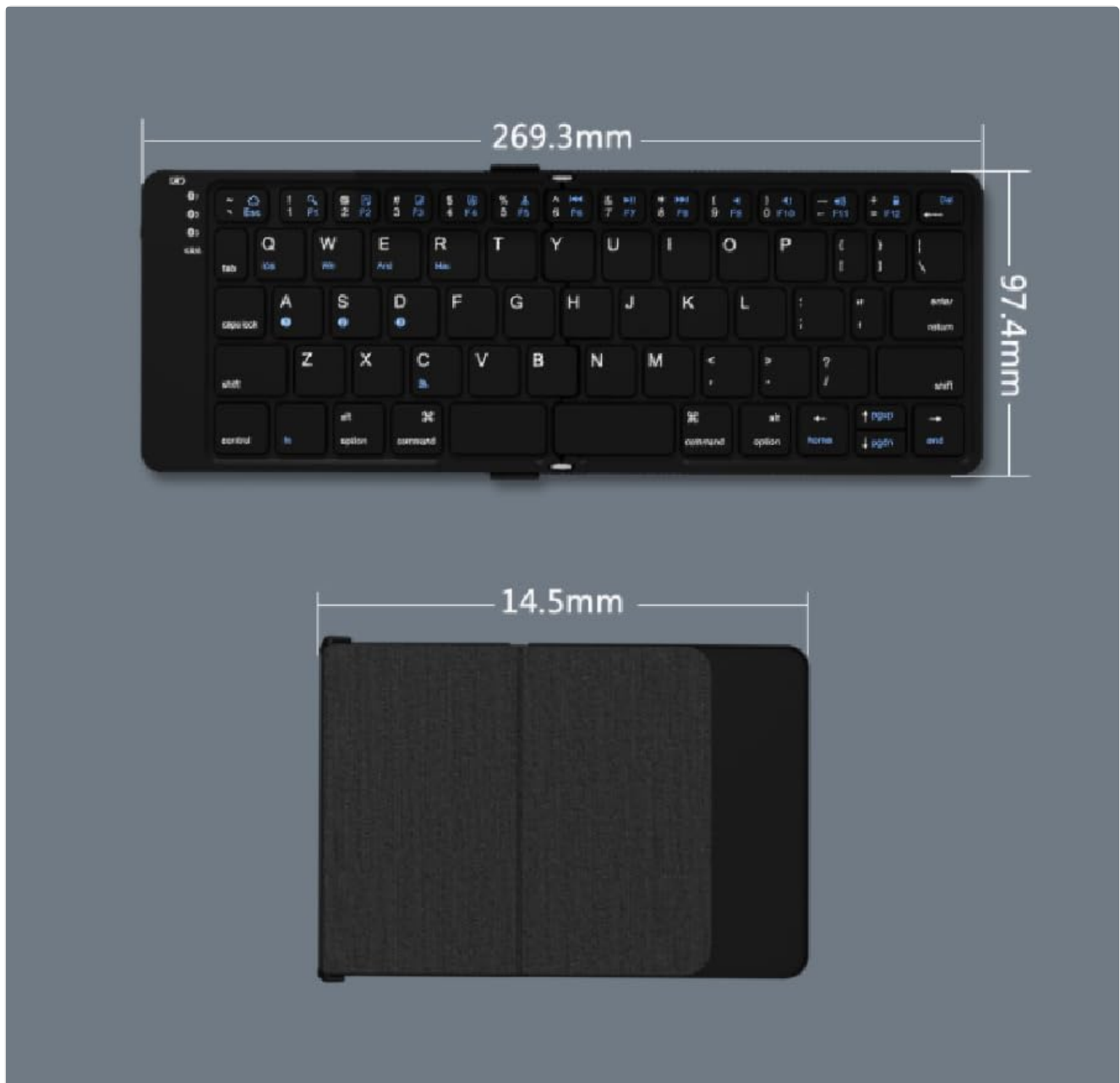
Figure 1: Keyboard dimensions when unfolded and folded.