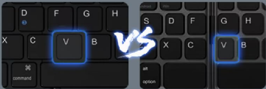
Figure 5: System compatibility key combinations.