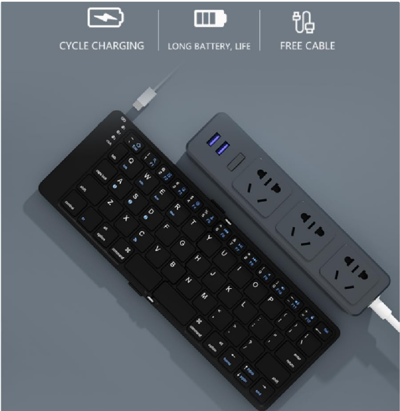
Figure 2: Charging the JOMAA Foldable Bluetooth Keyboard.

Before first use, fully charge the keyboard. Connect the provided Type-C USB cable to the keyboard's charging port and the other end to a USB power source (e.g., computer, wall adapter). The charging indicator light will illuminate. When the battery is low, a red light will flash.