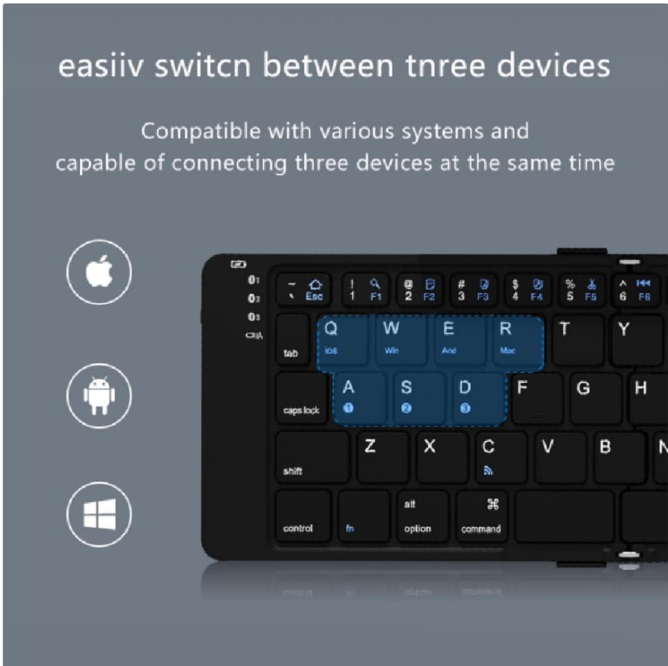
Figure 3: Bluetooth channel keys for multi-device connection.