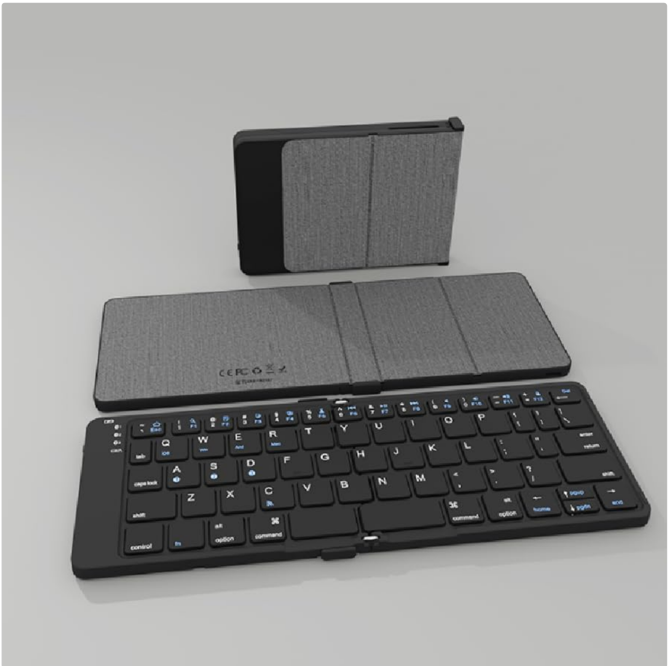
Figure 7: Magnetic folding mechanism and durability.