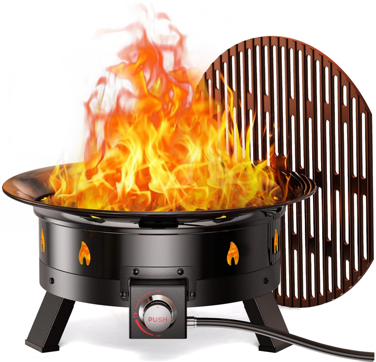
Figure 1: Ciays Large Propane Fire Pit 24 Inch