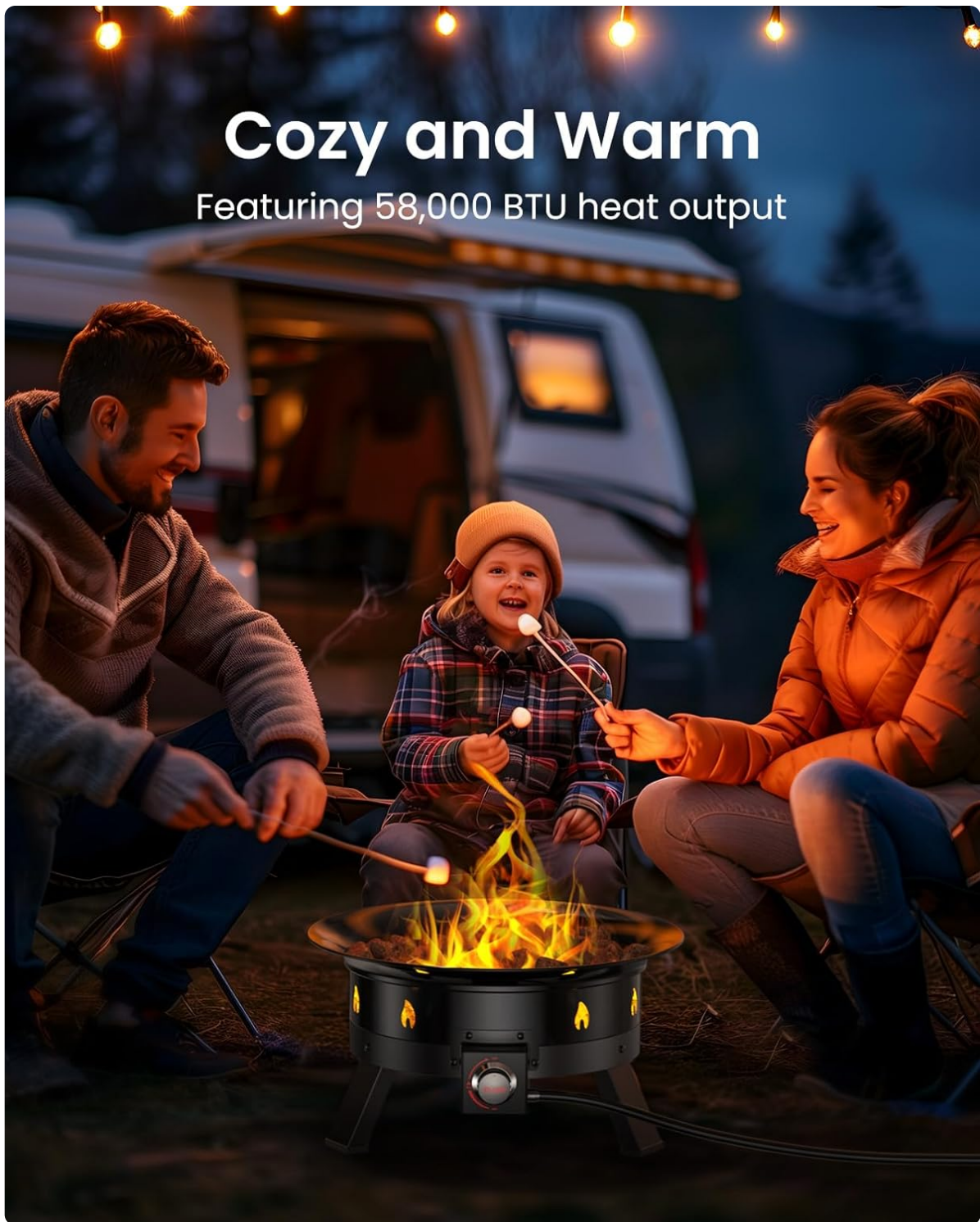
Figure 5: Enjoying the cozy warmth of the fire pit.