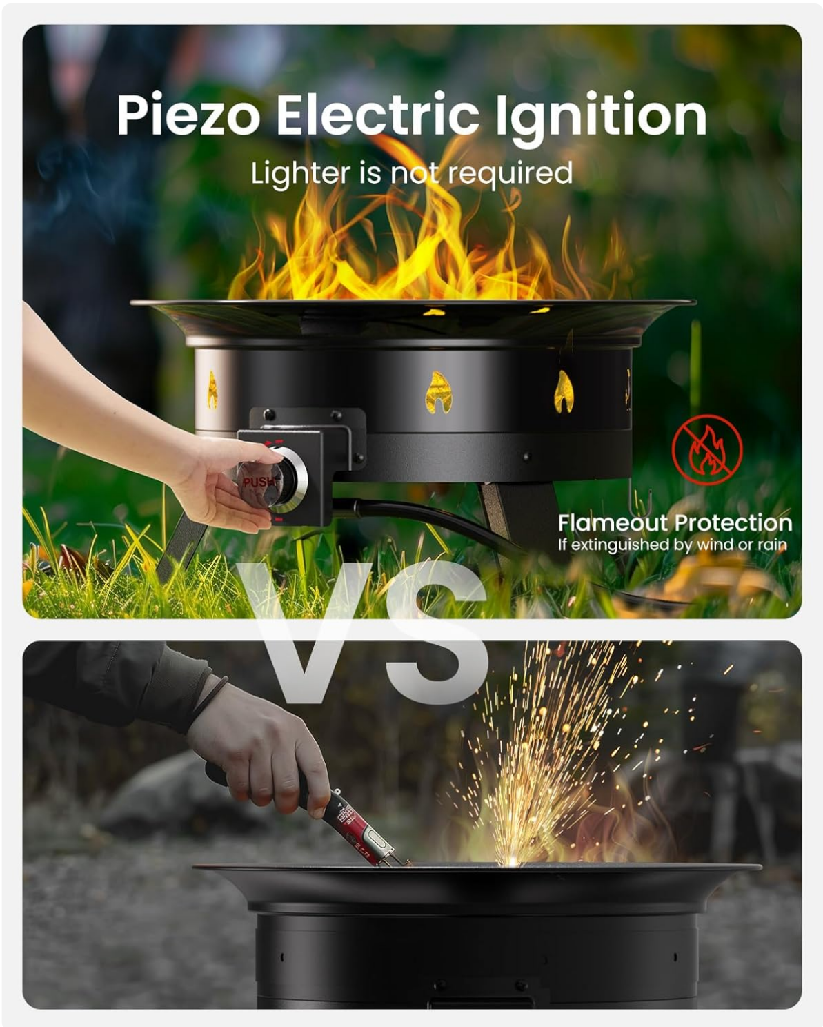
Figure 4: Piezo Electric Ignition for reliable lighting.