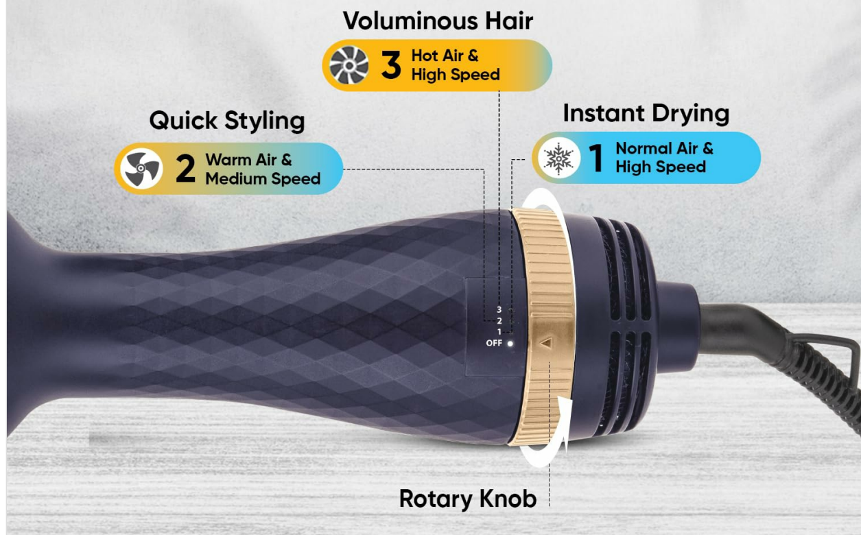
Image: The rotary knob on the handle, illustrating the three heat and two speed settings for customized styling.

Your TIME-SAVER for effortless drying and salon- worthy hairstyling in ONE GO 3 Heat/2 Speed Settings