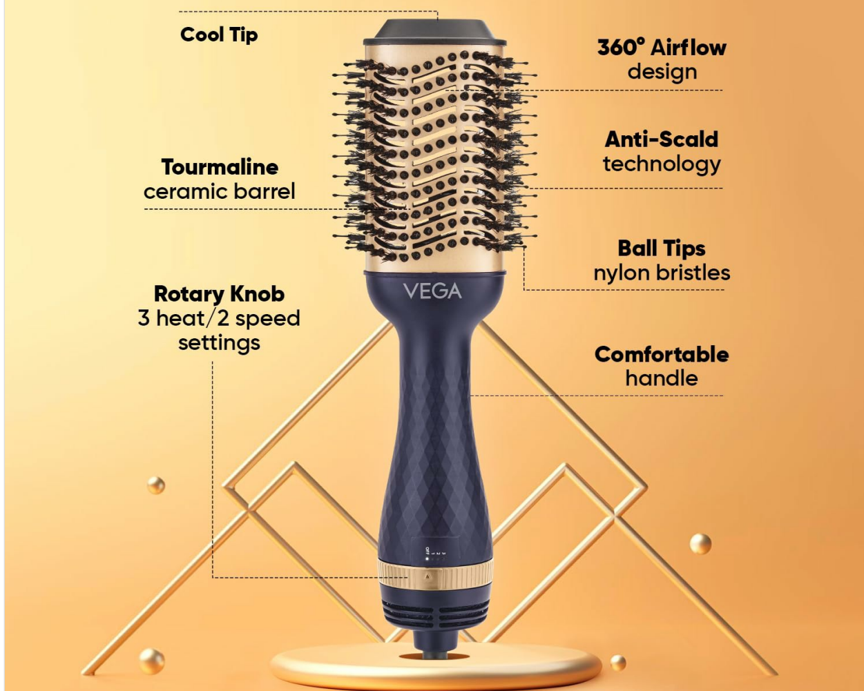
Image: Diagram of the VEGA Pro Volumizer Hair Dryer Brush with key components labeled, including Cool Tip, 360° Airflow design, Tourmaline ceramic barrel, Anti-Scald technology, Ball Tips nylon bristles, and Comfortable handle.