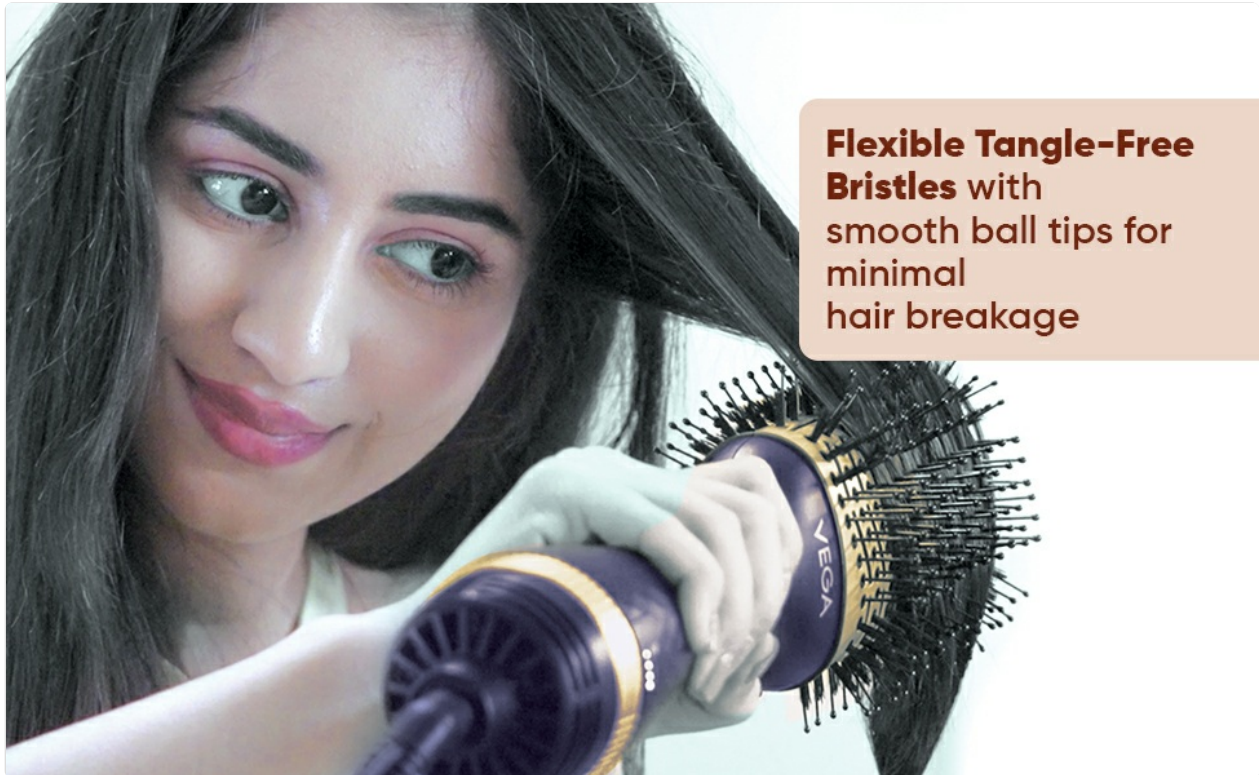
Image: Visual guide demonstrating the step-by-step process of using the hair dryer brush for drying and styling.

This appliance is suitable for both damp and dry hair.