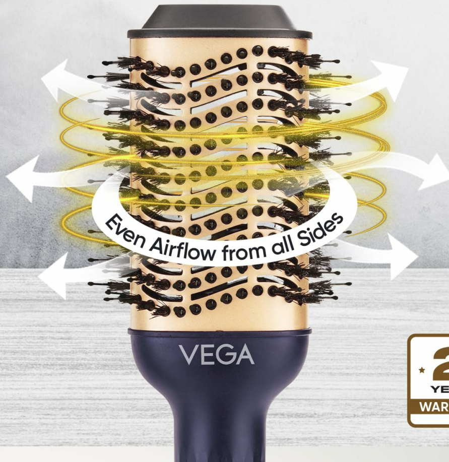
Image: Close-up of the brush head highlighting the 360° airflow vent design for efficient drying.