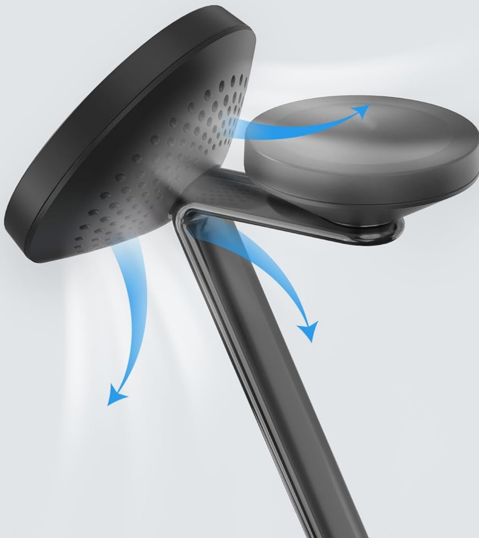
Image: A diagram showing airflow (indicated by blue arrows) around the charging pads, illustrating the heat dissipation mechanism designed to lower charging temperature.

Accelerate the air movement, lower charging temperature.