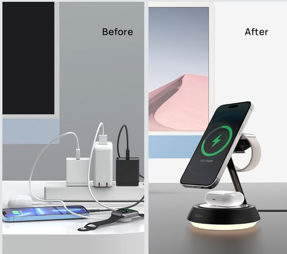
Image: A side-by-side comparison showing a cluttered charging area with multiple cables and adapters ("Before") versus a clean, organized setup with the SODI 3-in-1 Wireless Charging Station ("After").

Elegant and Functional All in One Design.