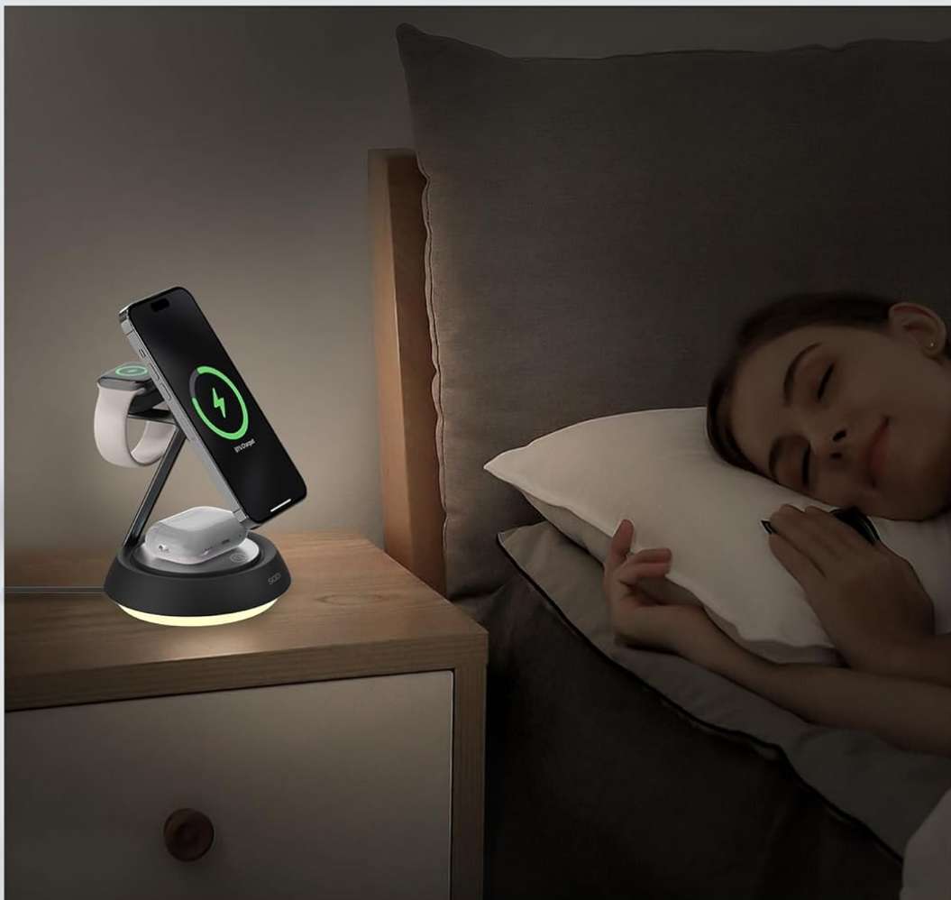
Image: The SODI 3-in-1 Wireless Charging Station on a bedside table, demonstrating its night light function with a soft glow, next to a sleeping person.

Enjoy the dark sleep mode, or click on the touch light for a soft experience.