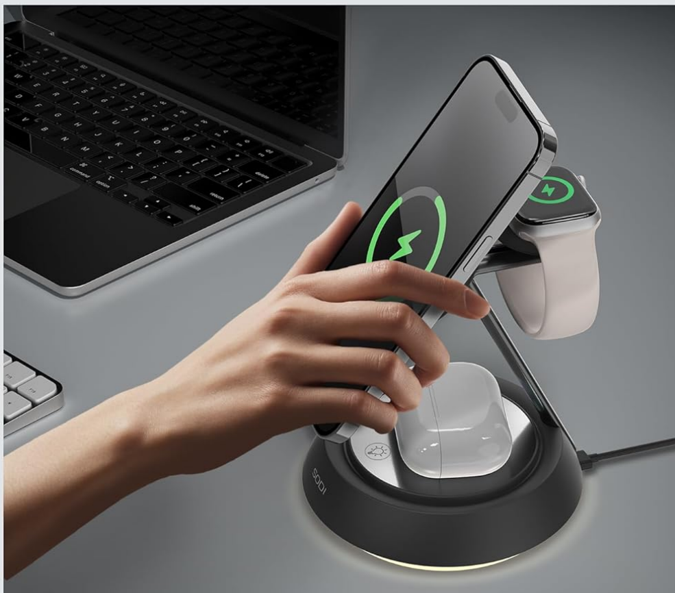
Image: A hand placing an AirPods charging case onto the base of the SODI 3-in-1 Wireless Charging Station, with an iPhone and Apple Watch already in place.

Elegant and Functional All in One Design.