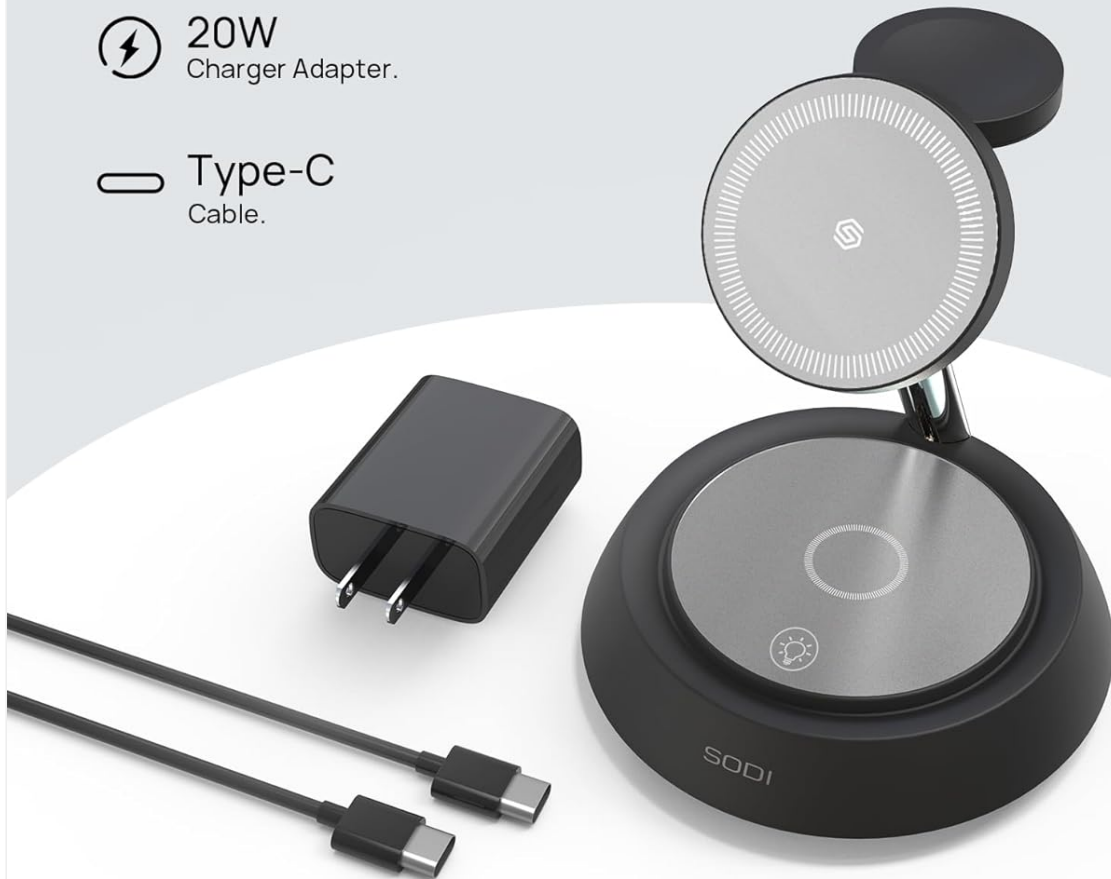
Image: A visual representation of the complete set of accessories, including the 3-in-1 charging station, USB Type-C cable, and US charger.