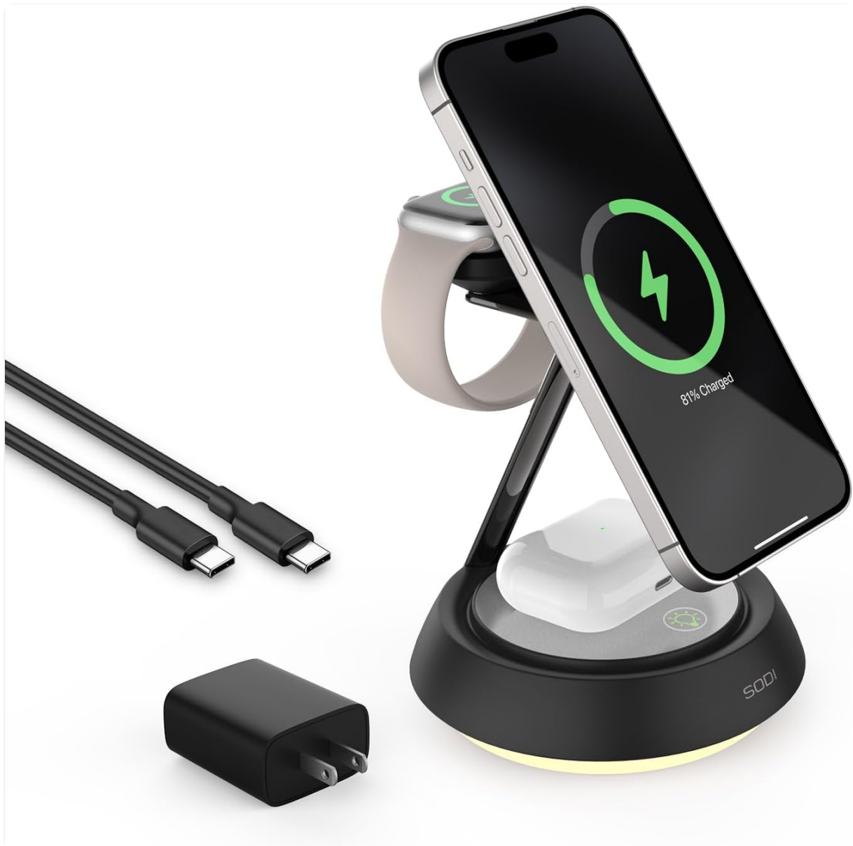
Image: The SODI 3-in-1 Wireless Charging Station in black, shown charging an iPhone, Apple Watch, and AirPods. A USB-C cable and power adapter are also visible.