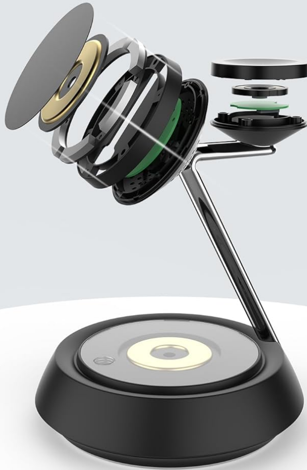
Image: An exploded view diagram of the charging station, highlighting its internal components and the multi-protection system with icons for Temperature Control, Foreign Object Detection, Over-Voltage Protection, and Over-Charge Protection.