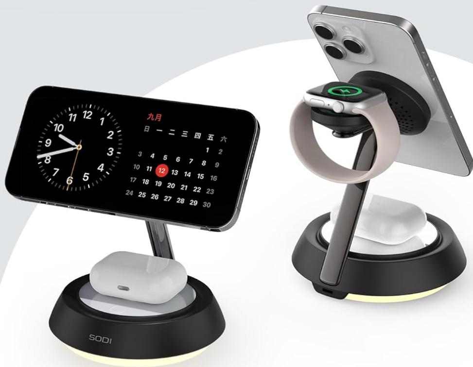
Image: The charging station demonstrating 360-degree rotation, allowing the iPhone to be charged and viewed in both vertical and horizontal orientations.