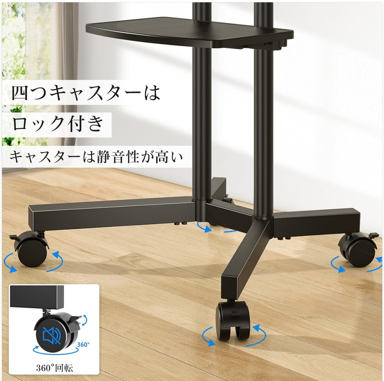
Image 4.2: Detail of the 360° rotating casters with locking function.