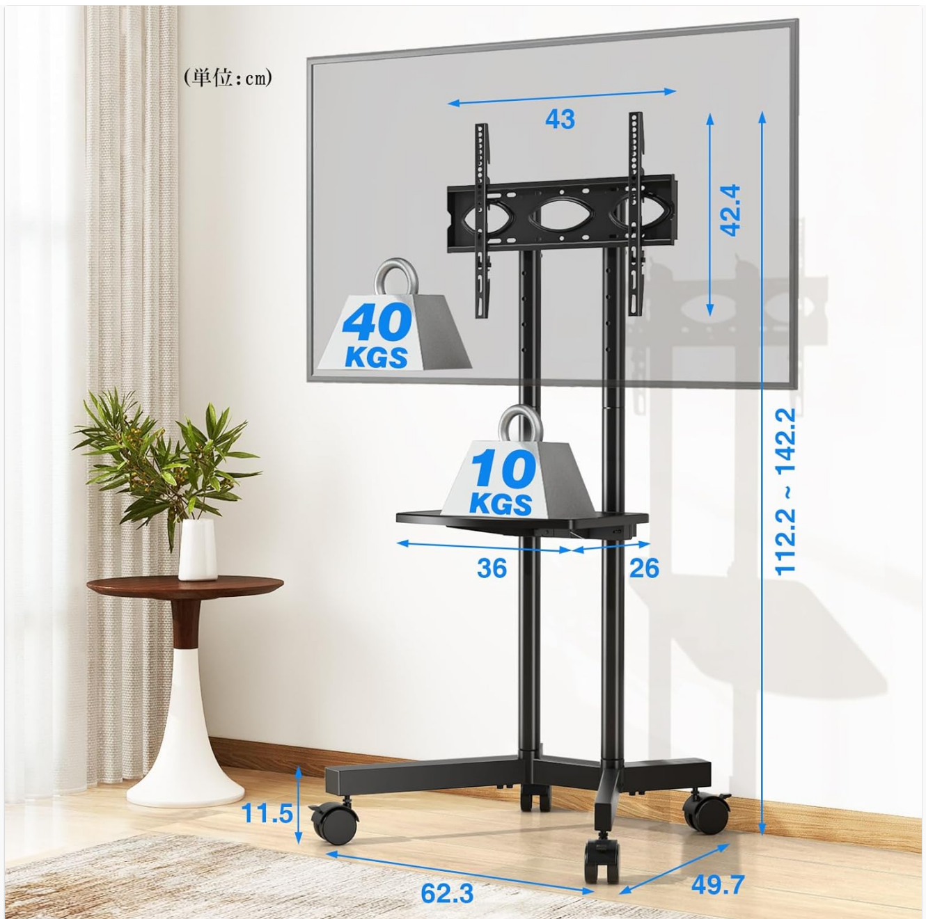
Image 3.2: Detailed dimensions and load capacities of the stand and shelf.