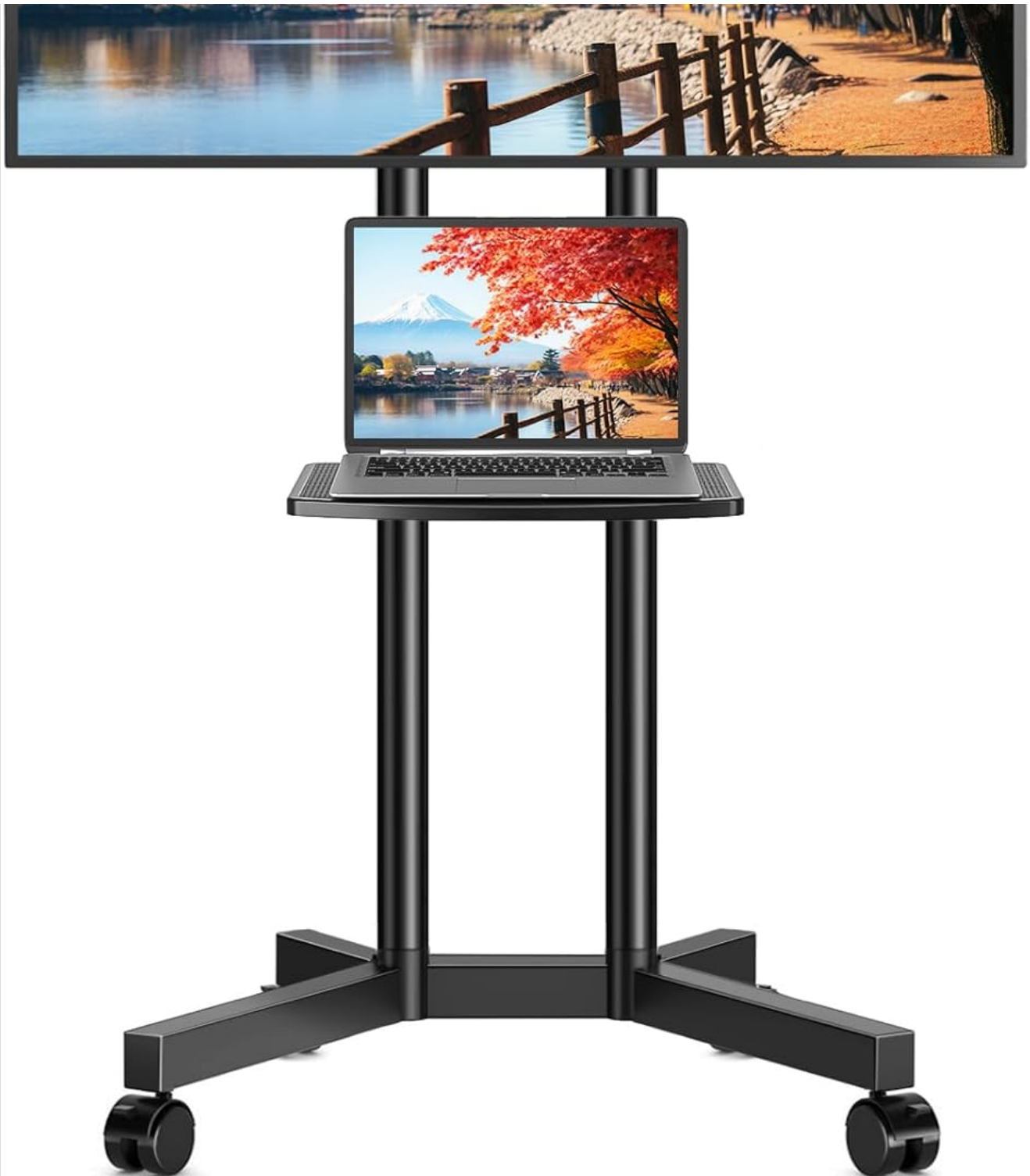
Image 1.1: Overview of the Rfiver Mobile TV Stand MT200 with a TV and laptop.