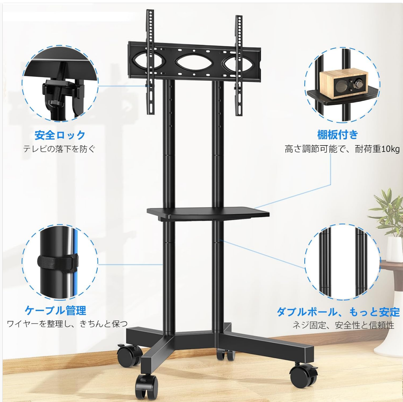
Image 7.1: The Rfiver Mobile TV Stand in a living room environment.