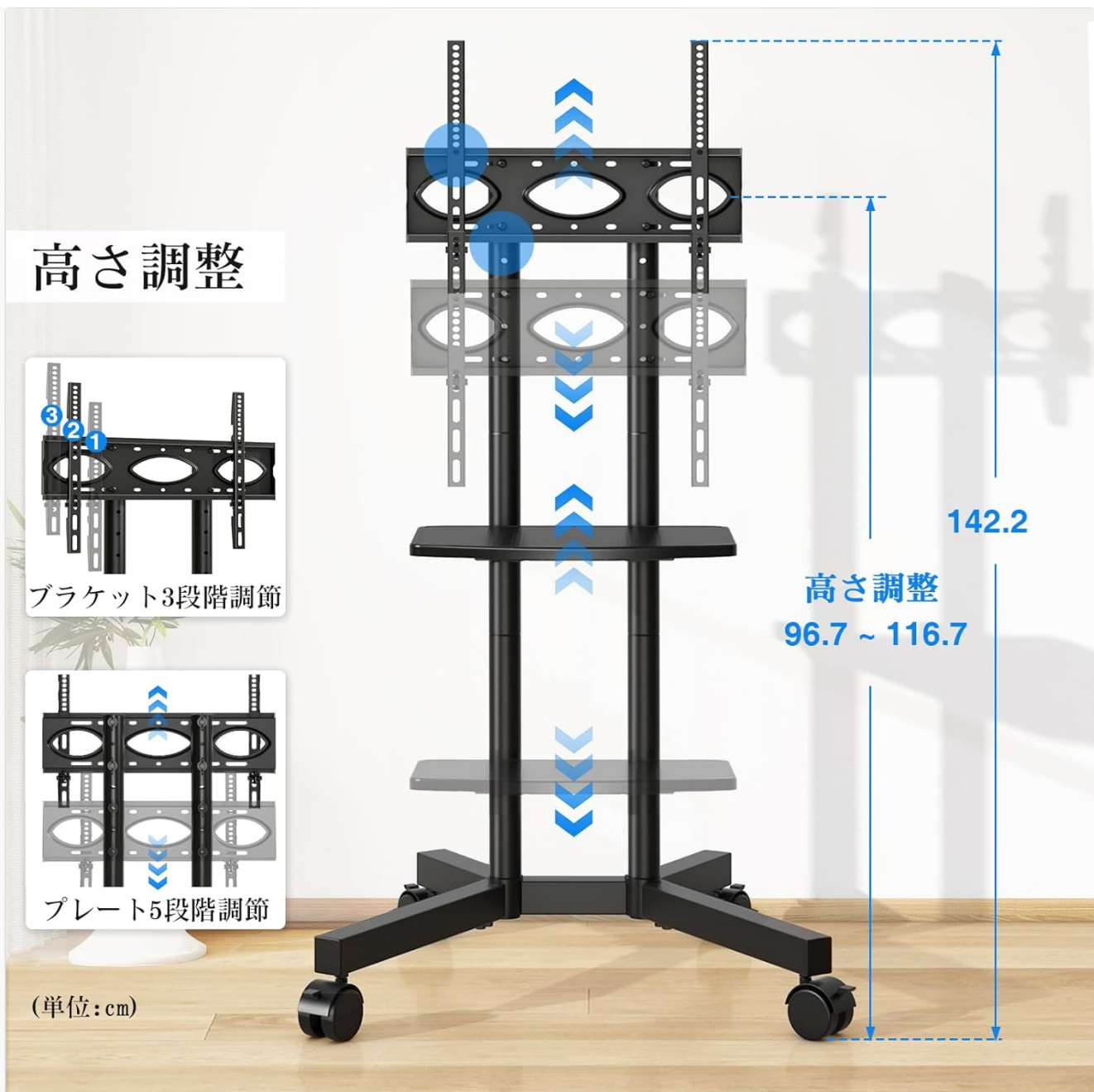
Image 4.1: Height adjustment options for the TV plate and mounting brackets.