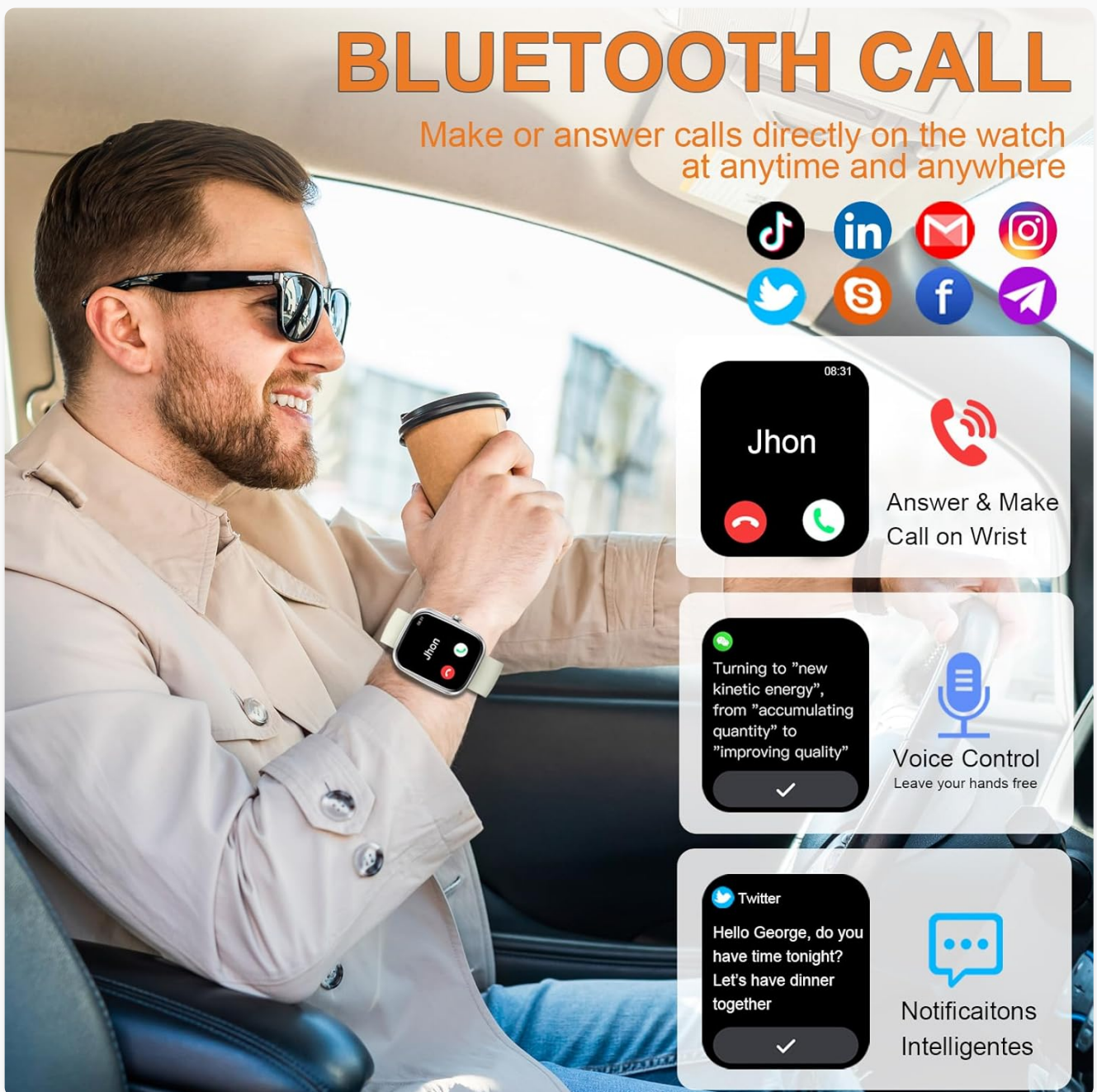
Image 4.1: The Kuizil Smart Watch T70 demonstrating Bluetooth call functionality and notification alerts.