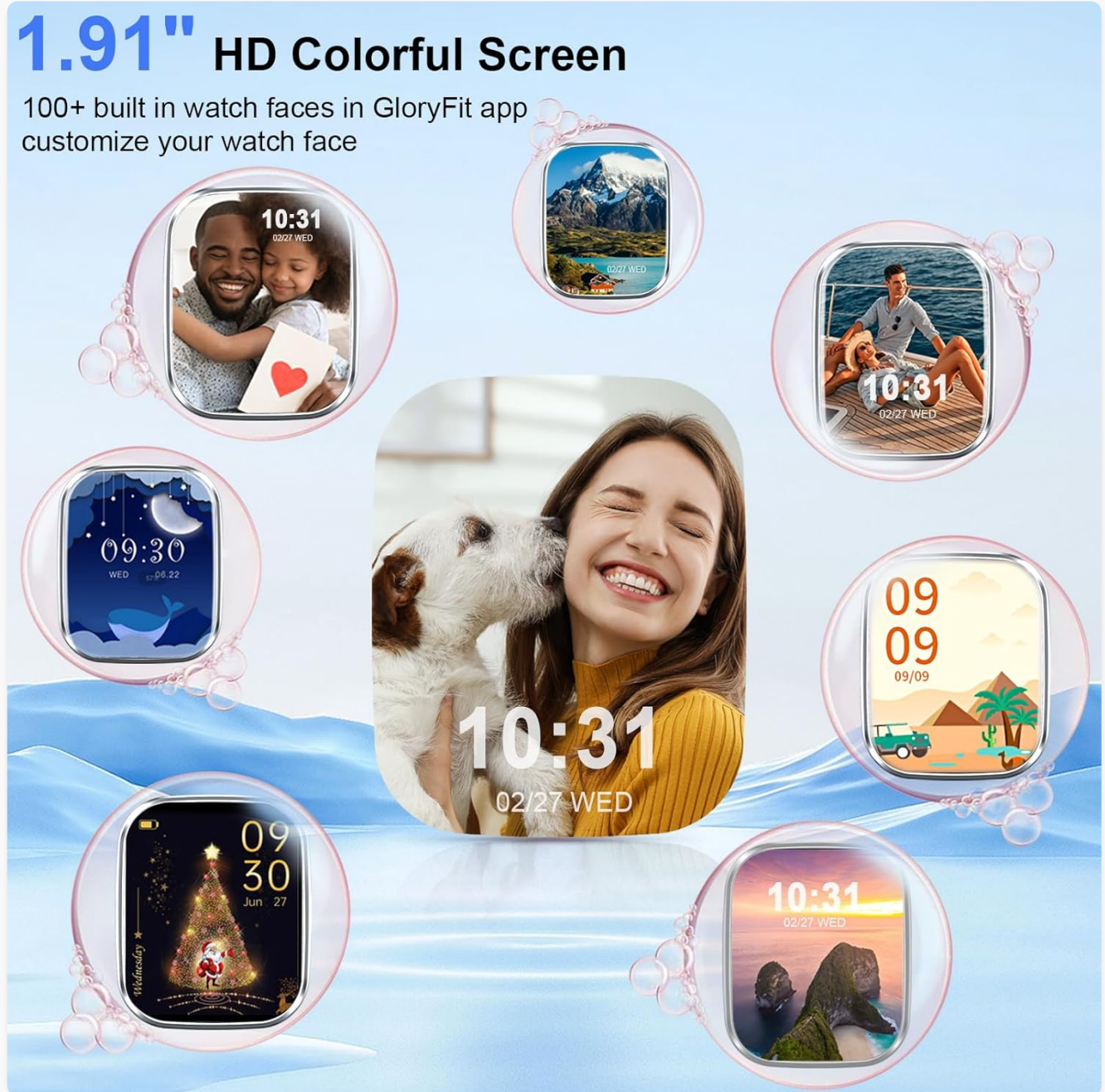
Image 4.2: The 1.91-inch HD colorful screen of the Kuizil Smart Watch T70 showcasing various customizable watch faces.