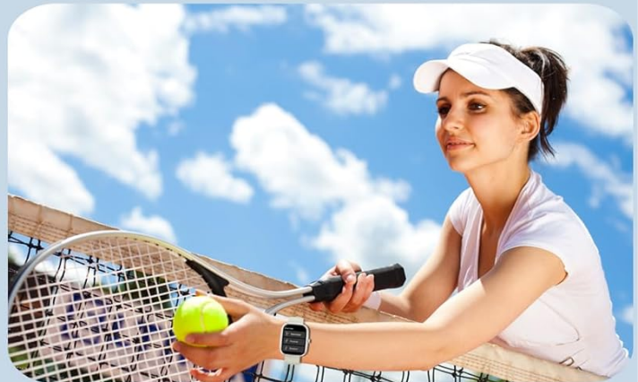
Image 4.4: The Kuizil Smart Watch T70's extensive range of sports modes and activity tracking features.