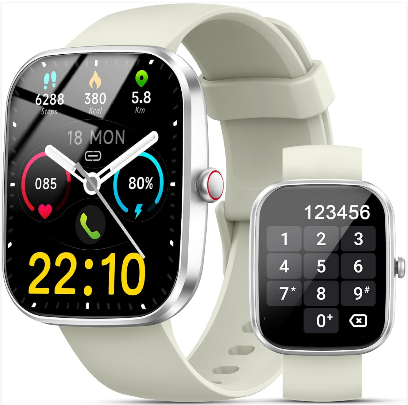
Image 1.1: Kuizil Smart Watch T70 with its main display and a secondary image showing the dial pad for calls.