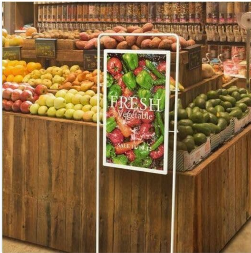
Figure 3: Sharp EP-C251 Digital Signage Display used in a retail environment to display a "Fresh Vegetable" advertisement.