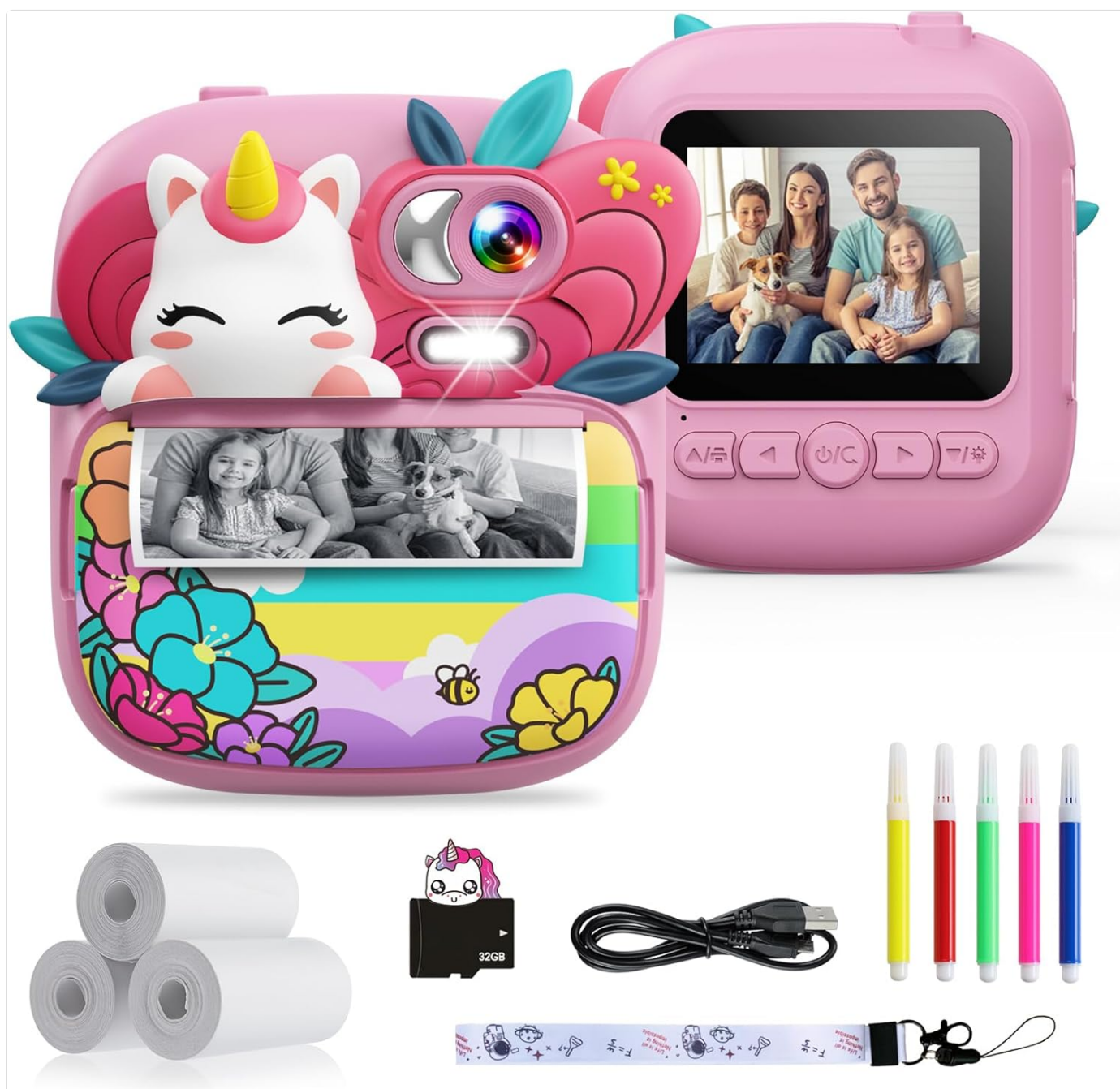
Image: The TIATUA Kids Instant Print Camera in pink, shown with included accessories: three rolls of thermal paper, a 32GB memory card, a USB charging cable, a lanyard, and a set of five color pens.