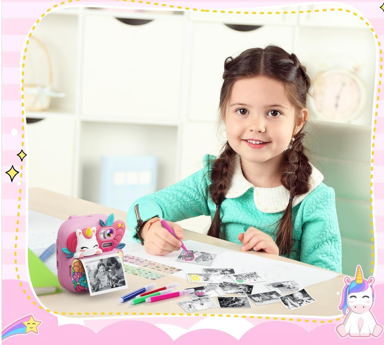
Image: A young girl happily coloring a black and white photo printed from her TIATUA Kids Instant Print Camera, with color pens and stickers laid out.