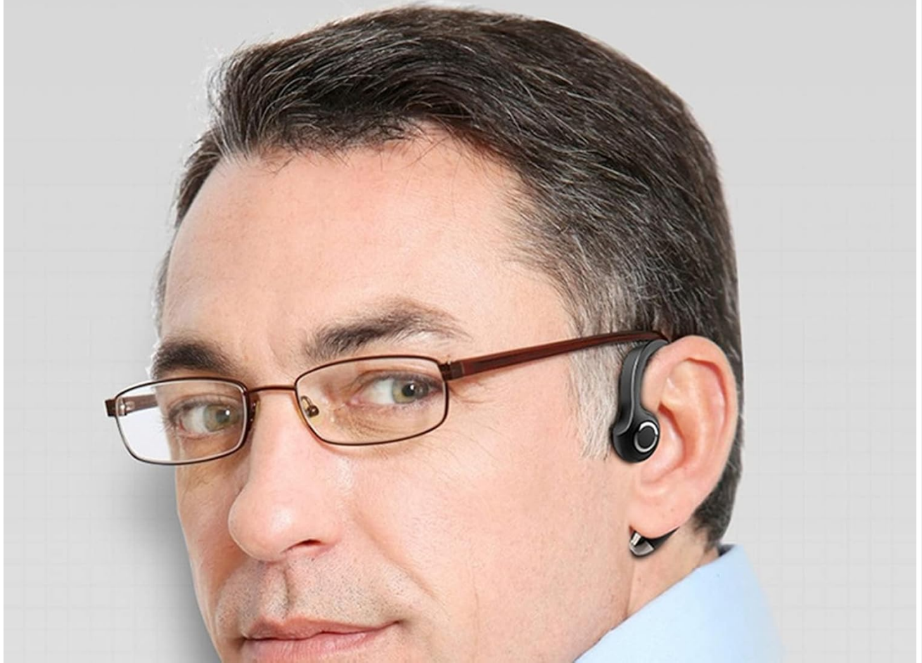
Image: The ESSONIO HM10-2 headset, ready for use.

The Sunken Design and Guide Groove Make it Easy for Eye Users