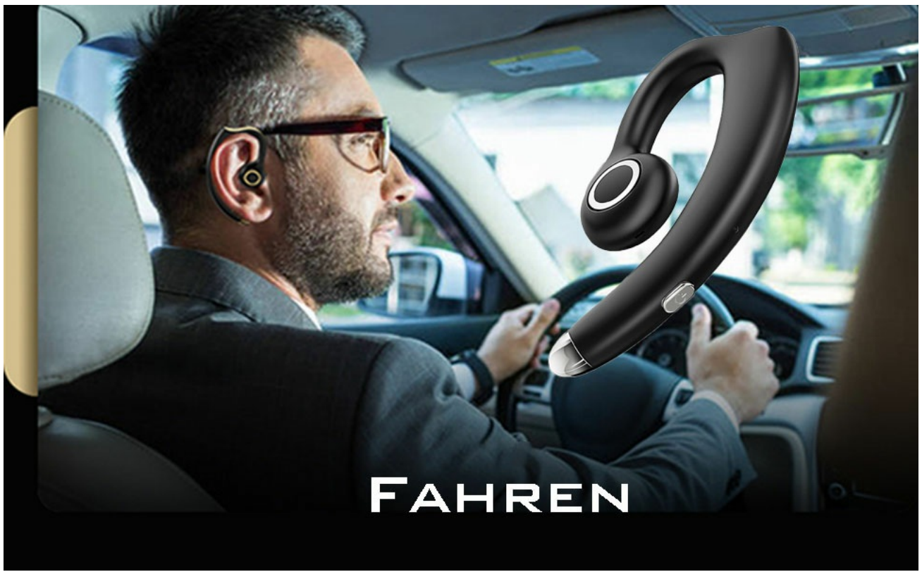
Image: Open Ear Design for painless wearing.