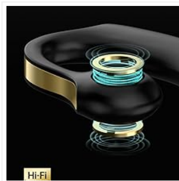
Image: Enjoying quality stereo sound during exercise.