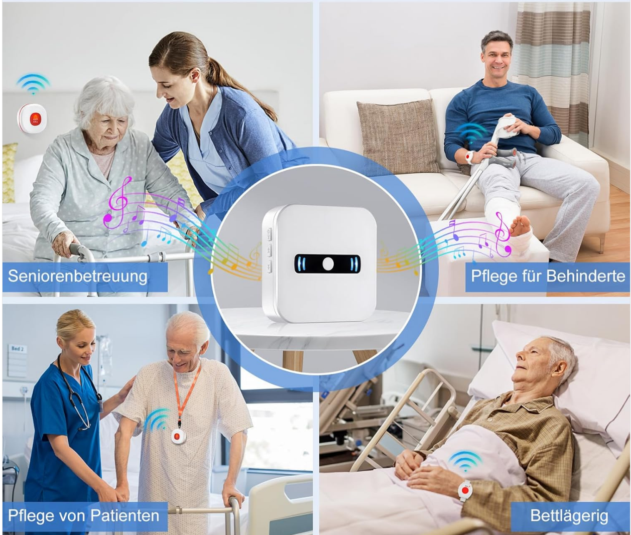
Image: Examples of the system's versatile application in different care scenarios.