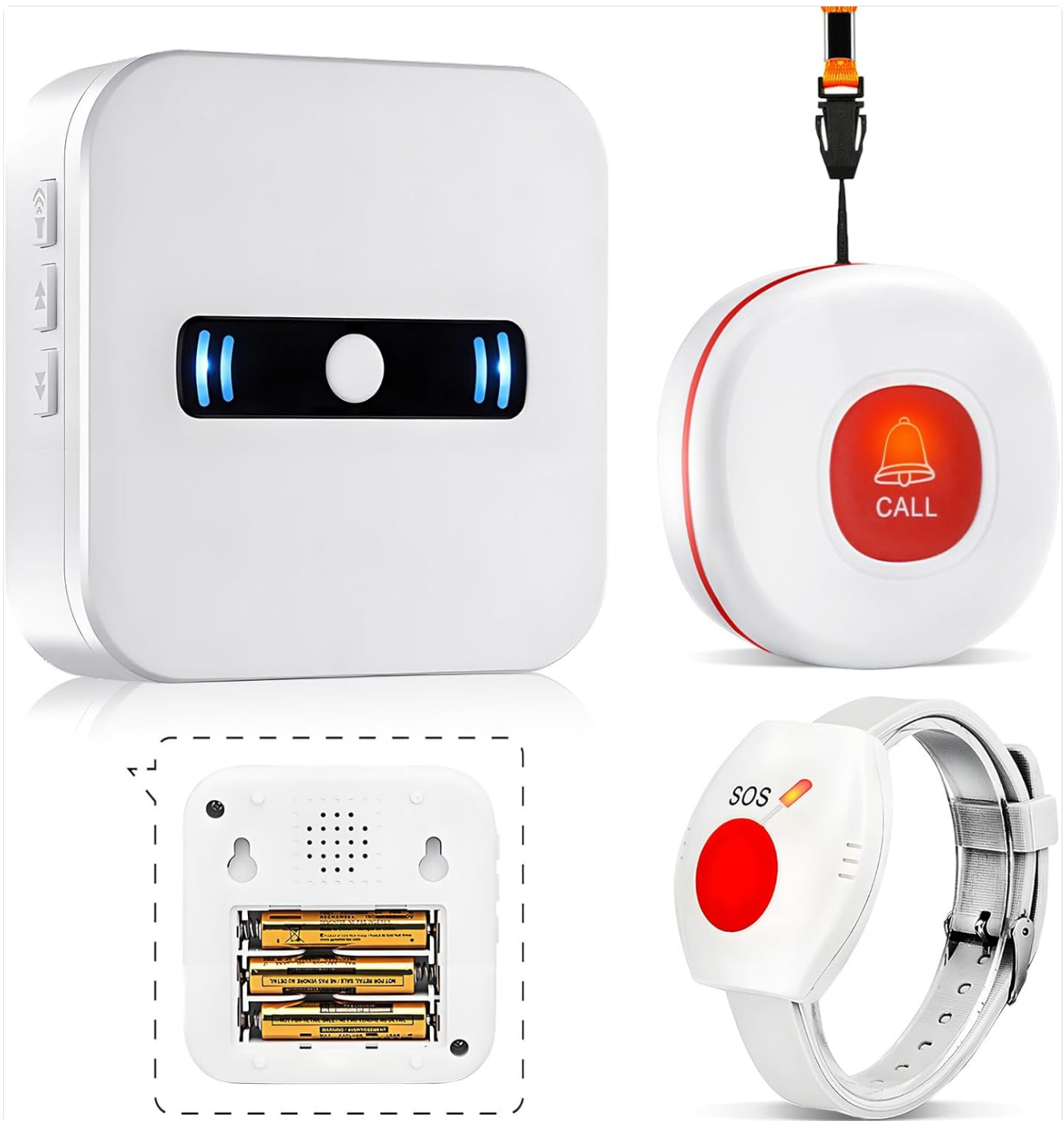
Image: Overview of the Daytech Emergency Call Button System components, including the receiver, a portable call button, and a wearable wristband transmitter.