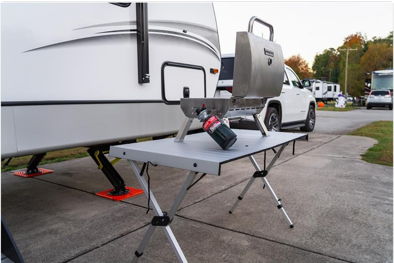
Image: The Venture Forward Portable Propane Gas Grill positioned on a portable table, with a small green propane tank connected to its side, ready for use.