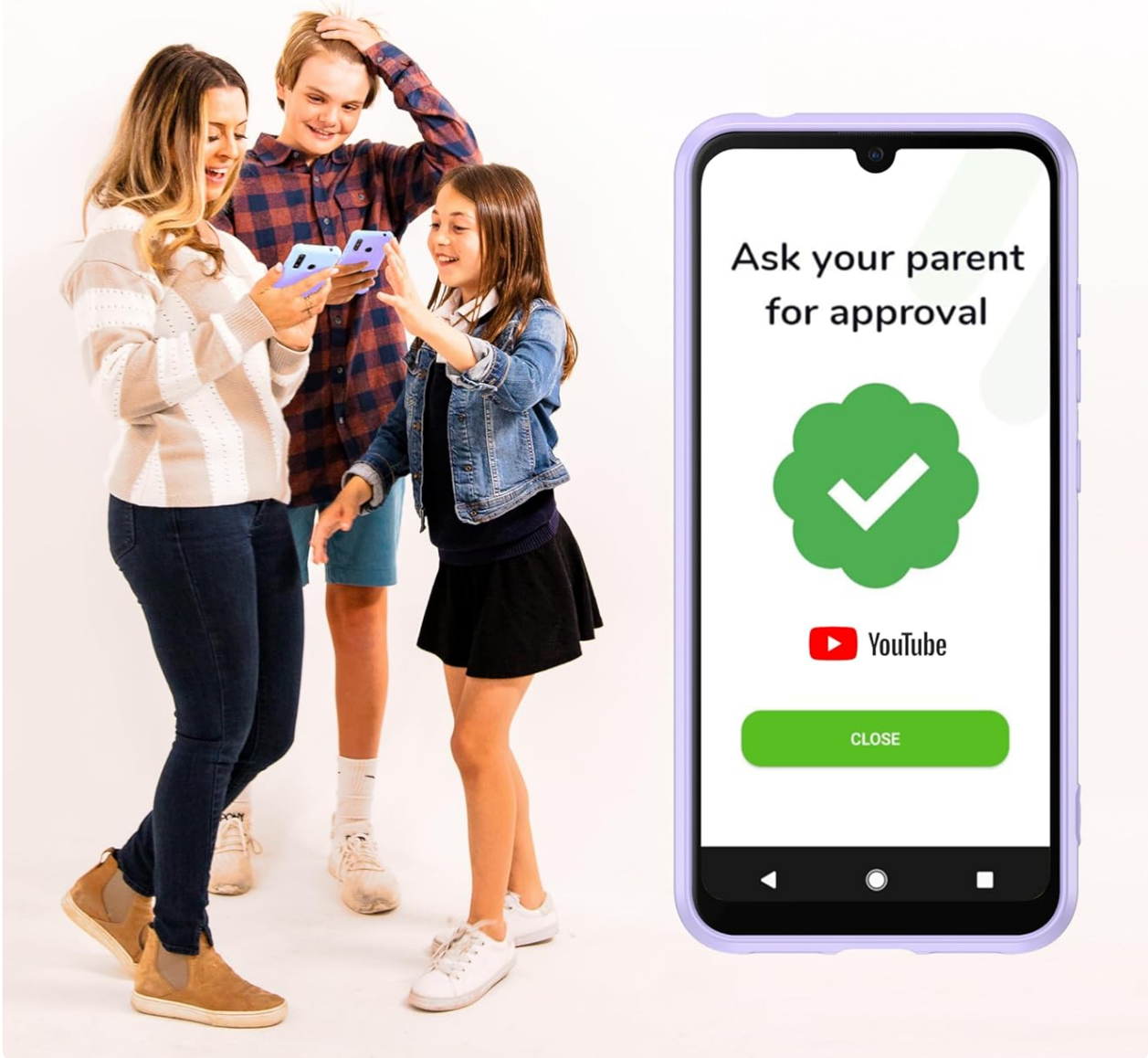
Image 4: The app approval screen on the Teracube Thrive, requiring parent consent for app usage.