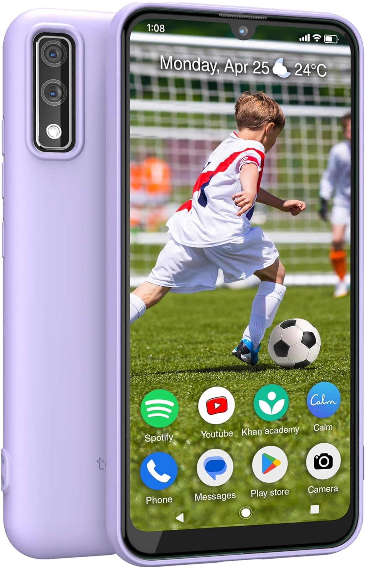
Image 1: The Teracube Thrive Kids Smart Phone, showcasing its design and user interface.