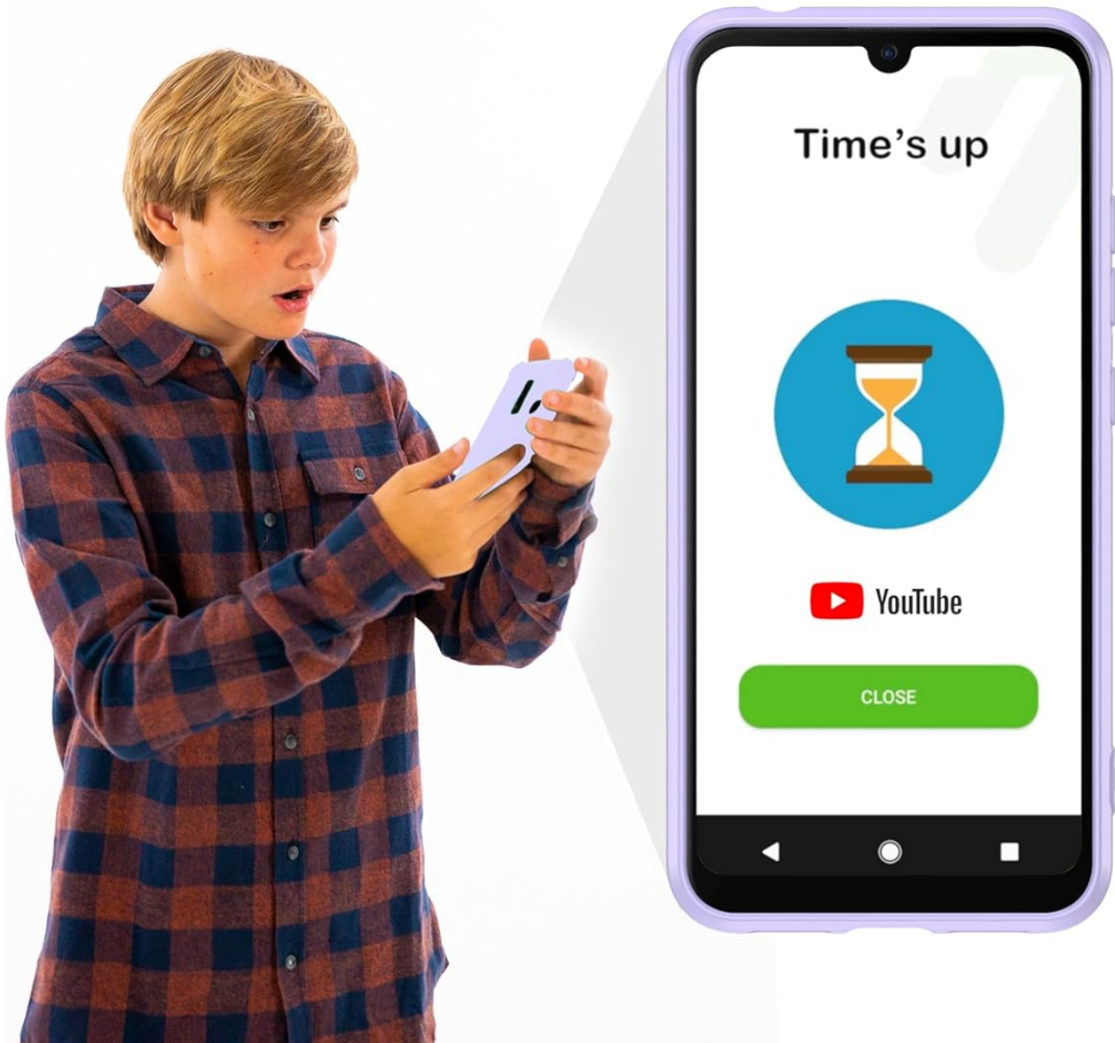
Image 5: The 'Time's up' notification on the Teracube Thrive, enforcing set time limits for applications.