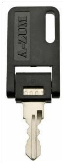
Figure 1: EasyKeys Replacement Key for A-ZUM CC2117. This image displays the EasyKeys Replacement Key for A-ZUM CC2117. The key features a durable black plastic head with the 'A-ZUM' brand name and a precisely cut silver metal blade designed for compatibility with CC2117 series locks.

This document provides instructions for the EasyKeys Replacement Key, specifically designed for A-ZUM lock systems with the code CC2117. This key is compatible with the A-ZUM Key Series CC2001 - CC3000 and is cut on a K79-CC key blank. It serves as a direct replacement for your original A-ZUM CC2117 key.