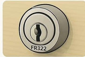
On the Lock Face