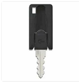
Figure 2: The EasyKeys CC4525 replacement key.

If the key does not turn or feels stiff, do not force it. Refer to the Troubleshooting section.