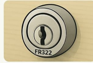
On the Lock Face