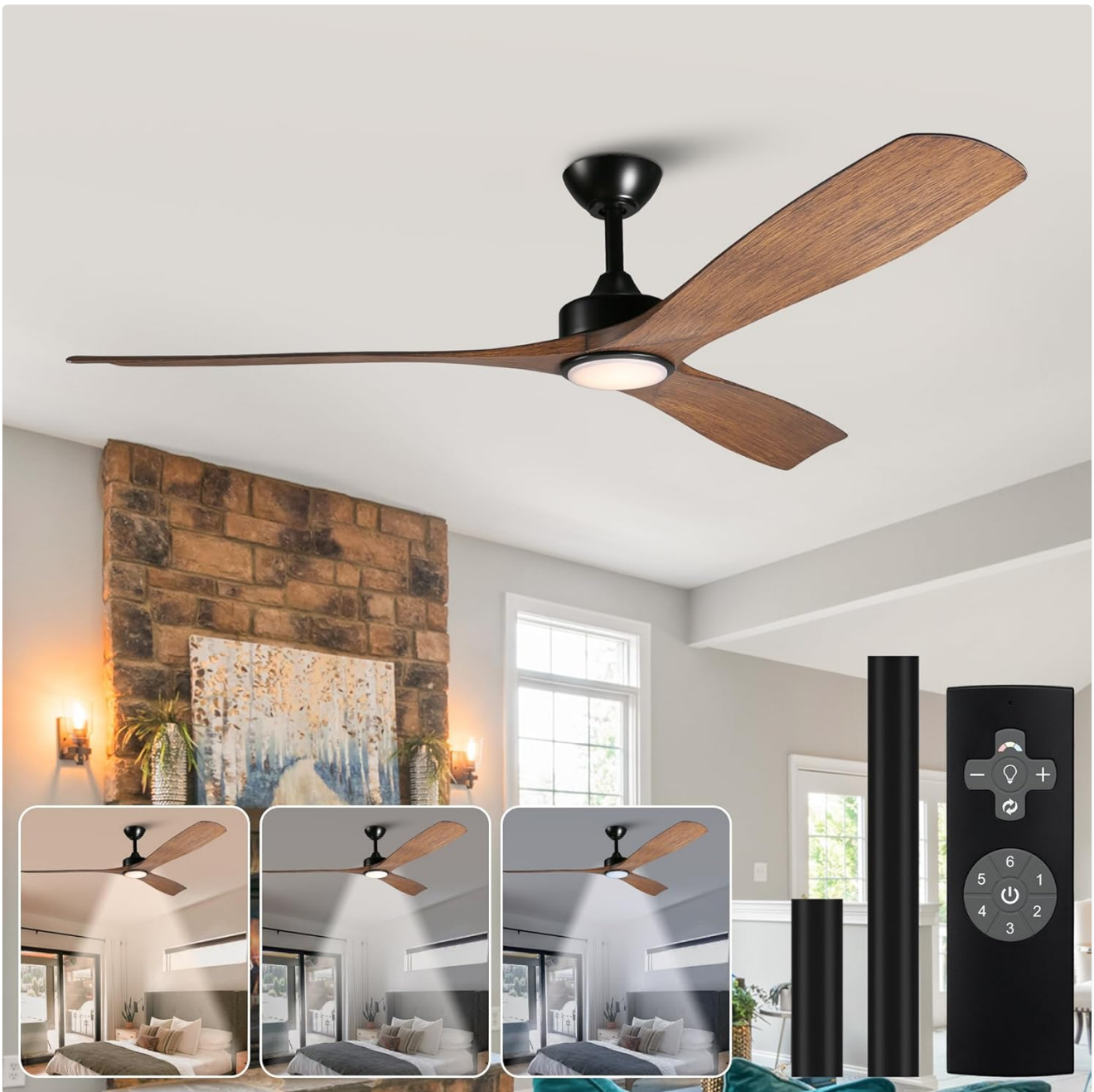
Image: The IHomeAdore 60 Inch Ceiling Fan with Light and Remote Control, showcasing its modern design and integrated LED light. The image also displays the remote control and various light temperature settings.