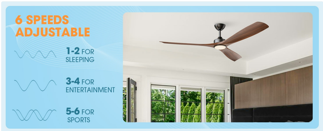
Image: Visual guide for 6 wind speeds: 1-2 for rest, 3-4 for recreation, and 5-6 for sports, demonstrating suitability for various environments.