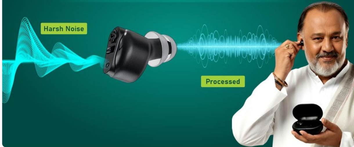
Image: Visual guide for adapting to the Aika AG-7901 hearing aid over four weeks.

Imported chip, powerful noise reduction function, automatic filtering outside noise to make sound more clear and real