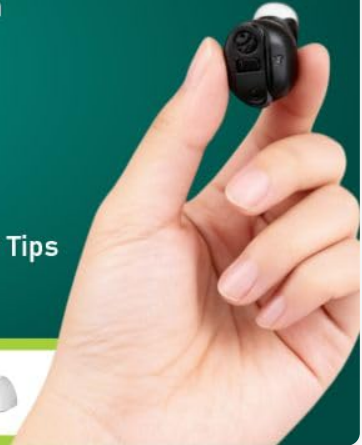
Image: Diagram illustrating the components and operation of the Aika AG-7901, including the ON/OFF switch and volume button.