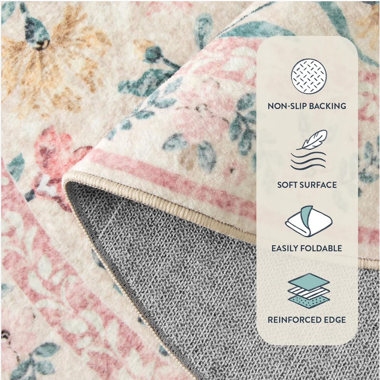
Image: Detailed view highlighting the rug's non-slip backing, soft texture, foldable nature, and reinforced edges.