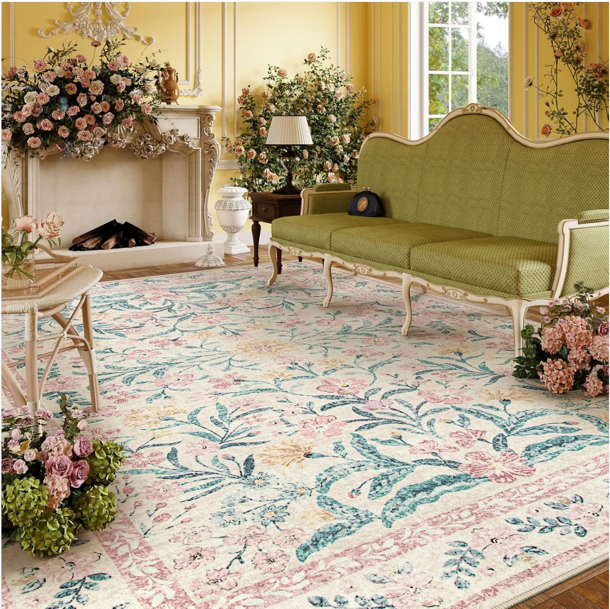
Image: The Lahome 8x10 Blush Pink Machine Washable Area Rug displayed in a living room, showcasing its floral pattern and size.