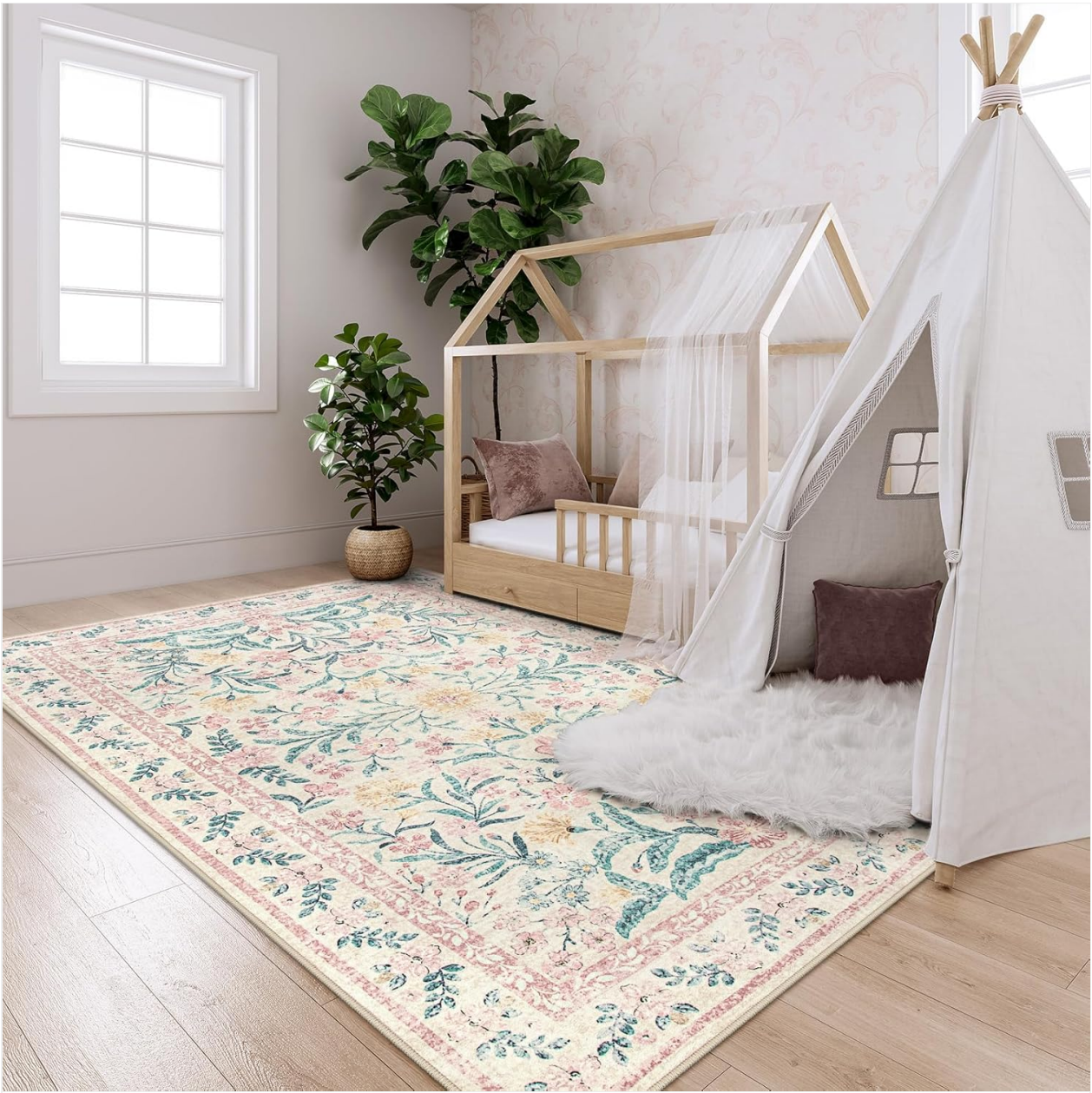
Image: The Lahome rug providing comfort and style in a child's nursery.