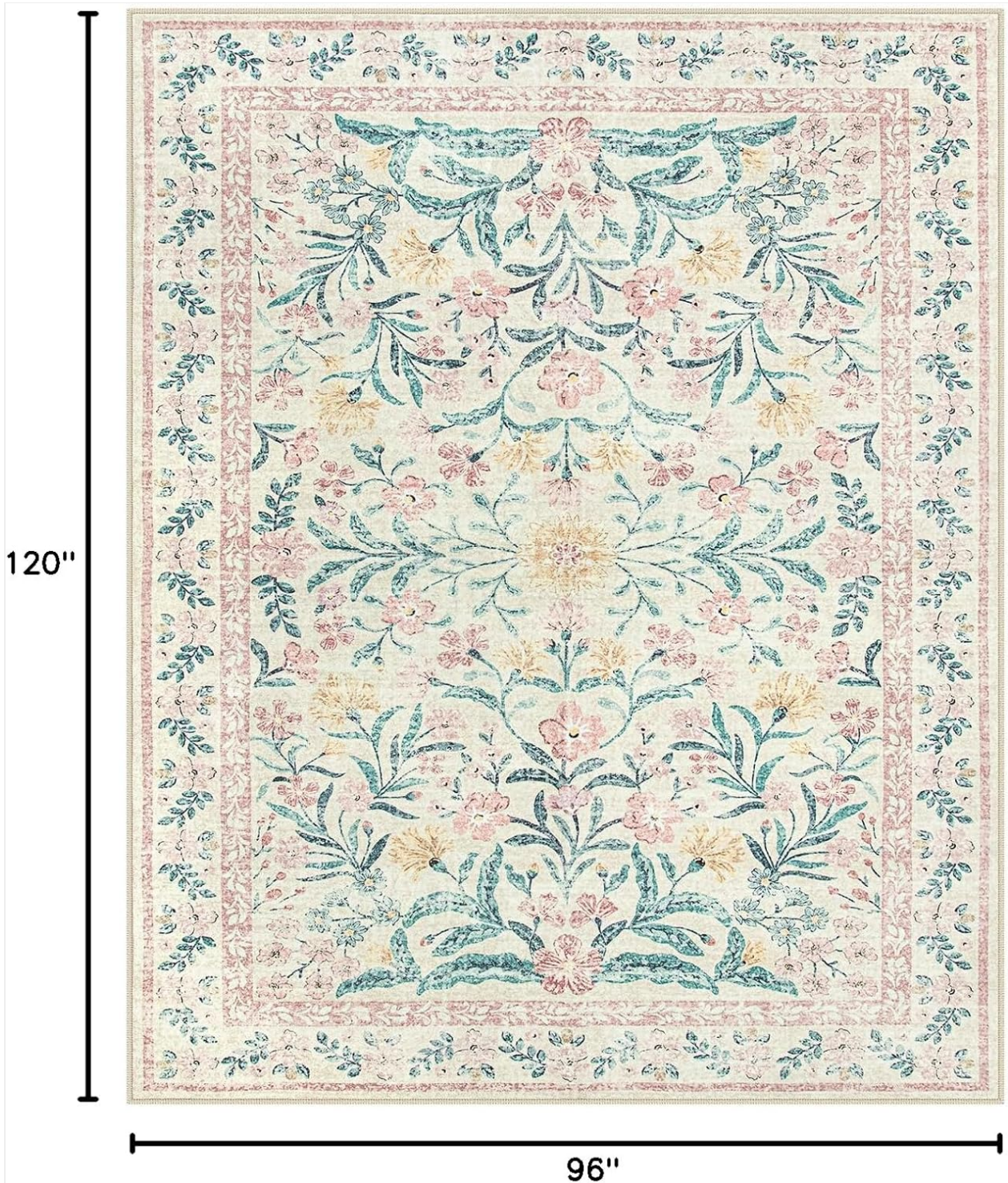
Image: A diagram illustrating the precise dimensions of the 8x10 rectangular rug.