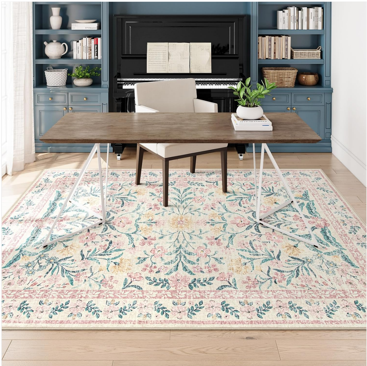
Image: The Lahome rug enhancing the aesthetic and comfort of a home office.