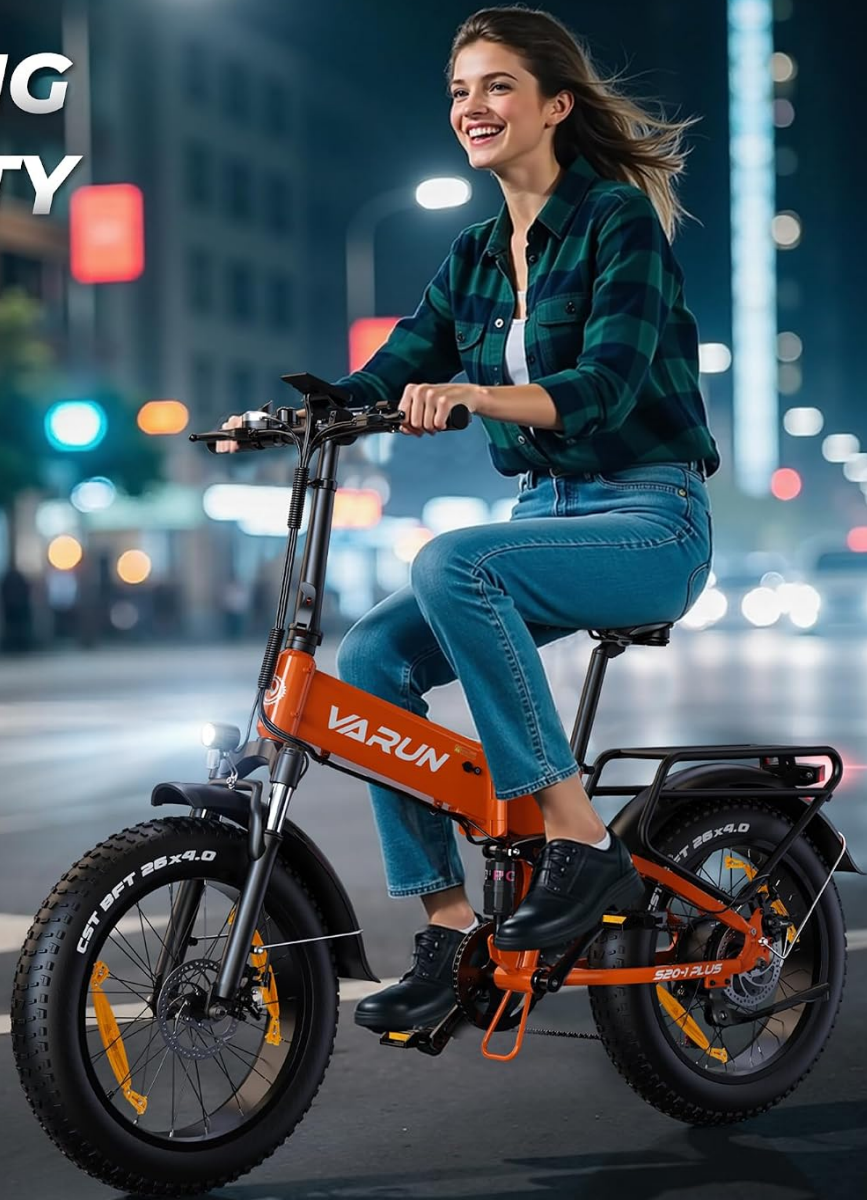
Image: Overview of the bicycle's lighting and safety features, including the LED headlight, red rear light, and double disc brakes.