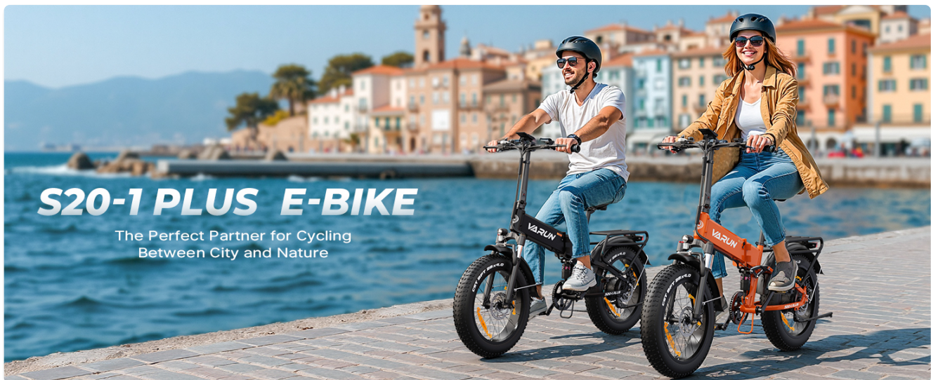
Image: Two individuals riding VARUN S20-1 PLUS electric bicycles, demonstrating the compact nature of the folding design.

Reverse these steps to unfold the bicycle, ensuring all latches are securely fastened before riding.