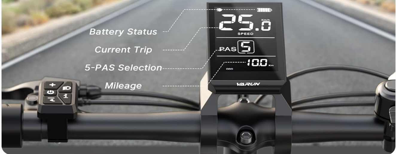
Image: Close-up of the 7-speed gear shifter and the multifunctional LCD display, showing real-time ride data.