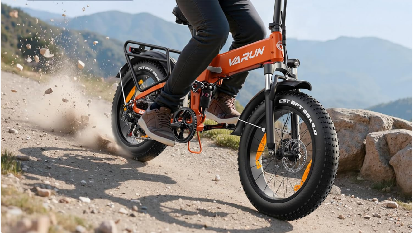
Image: Visual representation of the three primary riding modes: Pedal Assist, Boost (Push Assist), and Fitness (Normal Mode).