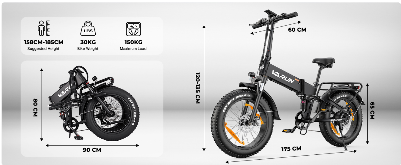
Image: Diagram illustrating the folded and unfolded dimensions of the VARUN S20-1 PLUS electric bicycle.