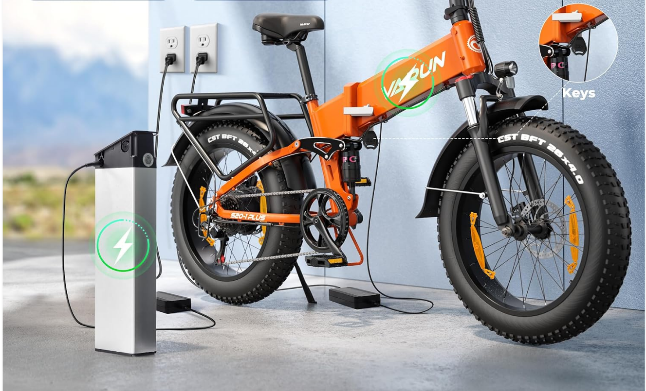
Image: Details of the 48V 13Ah lithium battery, highlighting its removability, IPX6 waterproof rating, and anti-theft features.